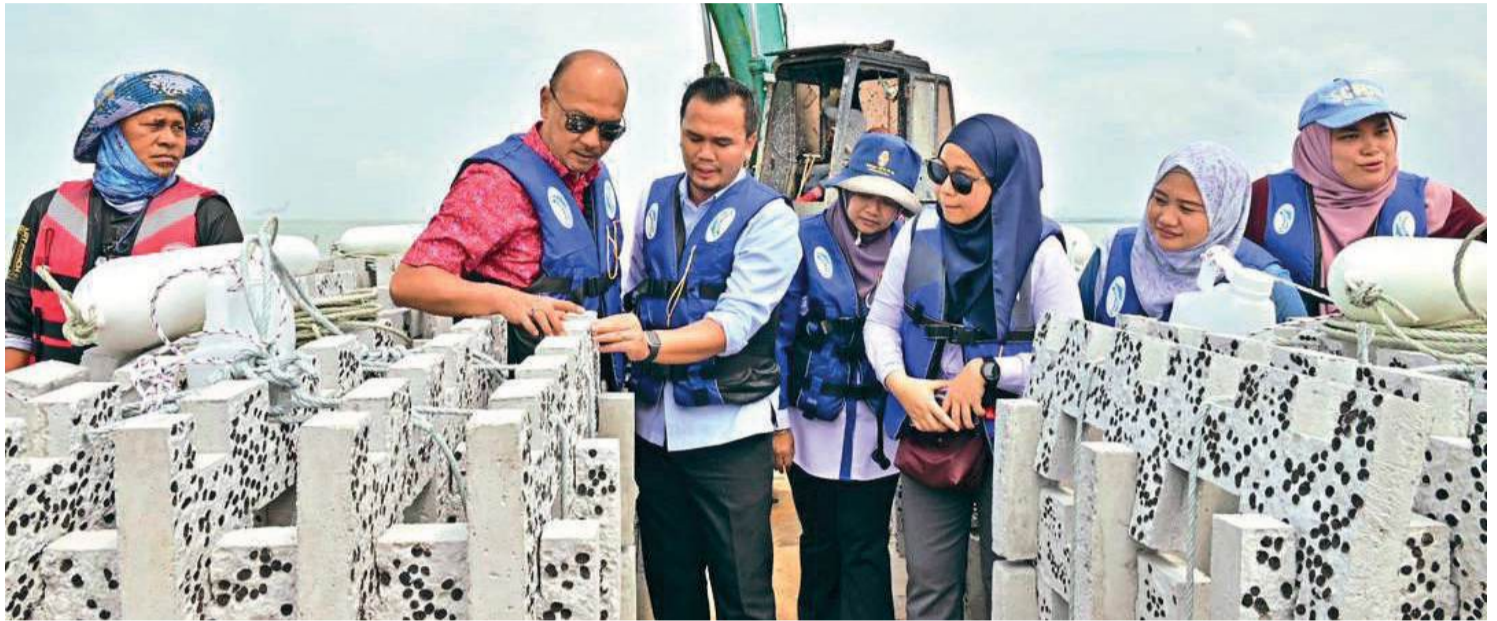
Through its numerous partnerships and collaborative ventures, SIRIM IR is fulfilling its mission as a trusted partner for innovation.

"We utilise the latest technologies and drive innovation to support industry growth and competitiveness. The innovation is carried out through our four key pillars – the Energy and Environment Centre (EEC), Life Sciences Centre (LSC), Smart Manufacturing Centre (SMC) and Advanced Materials Research Centre (AMREC)," he says.