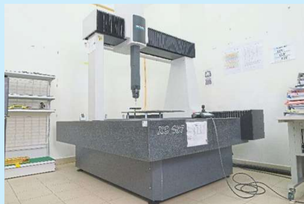
The Wenzel XC 107-CMM is designed for high precision and versatility in measuring components in manufacturing and quality control environments.

Moreover, our new 3D printing capability positions us to become a market leader in rapid moulding manufacturing, combined with our existing high-precision machining.