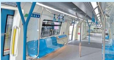
LRT and MRT seats designed and manufactured by DK Composites.

In the marine sector, DK Composites has built over 3,000 boats and racing yachts, including the renowned DK46 and Farr52, tailored for export markets. The company has also supplied the