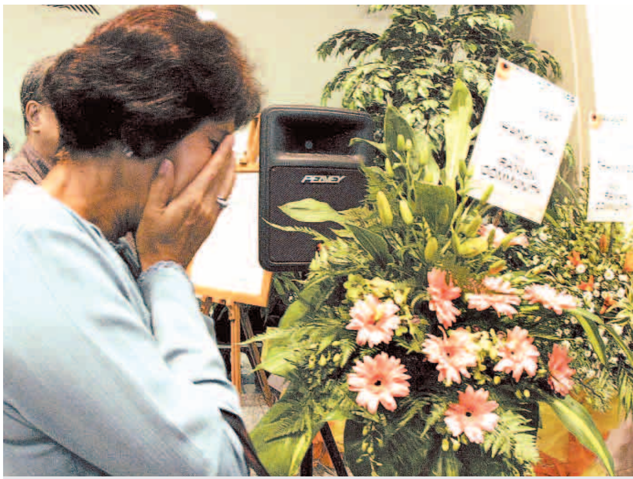
OVERCOME BY EMOTION: A member of the Iranian community weeping during the announcement of the death of the Bijani twins at the Raffles Hospital in Singapore yesterday. Hundreds of supporters and friends of the twins had gathered at the hospital in a show of support.