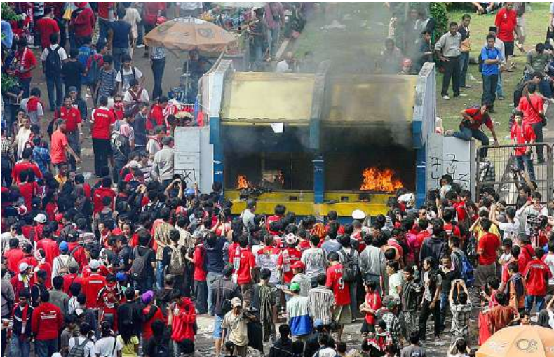
Football fury: Angry Indonesian football fans torching another ticketing booth after tickets for the football final were sold out. A day earlier, fans had also mobbed and vandalised another ticket booth.

SCORES KILLED IN TAHRIR VIOLENCE > Page 32