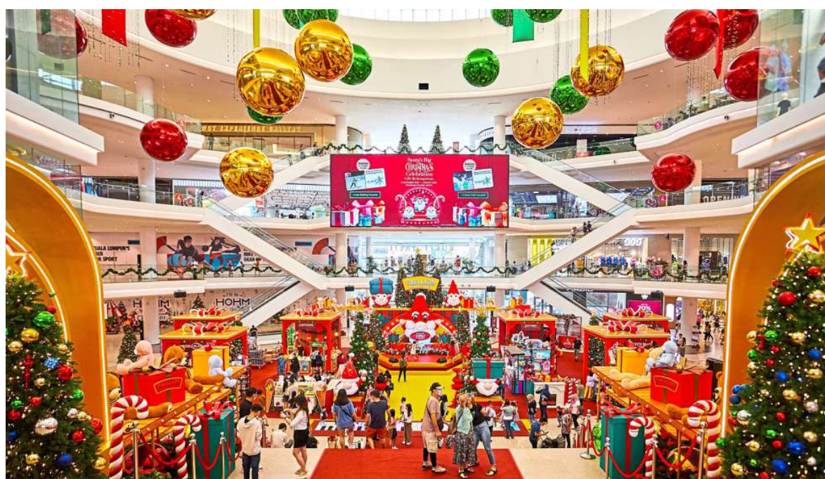
Pavilion Bukit Jalil presents "Santa's Big Christmas Celebration" for all your festive shopping, dining and entertainment needs.

Shoppers can also enjoy weekly orchestra and ukulele performances by the Clap & Tap children's orchestra, and hang out with Santa and Santarina during their meet