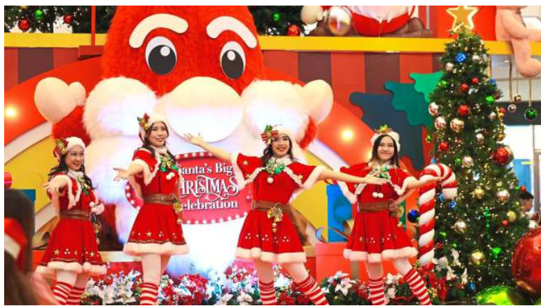
This festive season, there's something for the whole family at Pavilion Bukit Jalil.

DJI will also host a "Snap and Win" contest at their Christmas