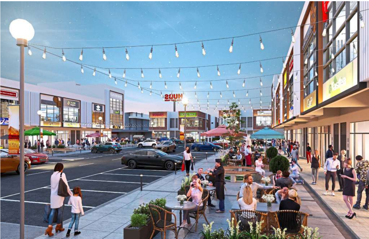
The location's prime positioning ensures a comprehensive 360-degree experience with excellent connectivity.

township of Bandar Puteri Jaya (BPJ), renowned for its bespoke homes harmoniously integrated with nature's grand design, the commercial precinct becomes an integral part of a self-contained garden township. Bandar Puteri Jaya, with its complete array of residential, retail and commercial elements, along with excellent community amenities, solidifies its reputation as one of the premier townships in the north. Beyond its commercial offerings, BPJ Business Park contributes to a balanced living environment, adding to the overall convenience for its residents. Savings galore As a special Christmas and year-end celebration, the BPJ Business Park developer is offering an early bird promotion with limited units. This includes free legal fees on the Sales & Purchase Agreement (SPA), loan agreement, free loan stamp duty and other enticing benefits. This is a very attractive opportunity for potential investors and businesses looking to establish a presence in this thriving locale. ■ For more information, drop by OSK Property Sales Gallery in Bandar Puteri Jaya, log on to www.bandarputerijaya.com.my or contact 012-429 1818.