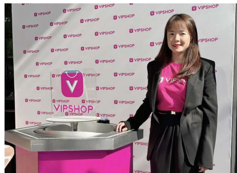
Ong shared her vision for the future of online shopping during the launch of Vipshop.

During this campaign period, Malaysians can enjoy exclusive perks, including daily deals of up