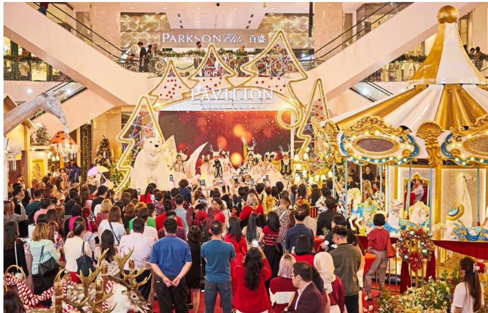
Step into the enchanting realms of 'Christmas – Love and Magic' at the transformed Centre Court, at Pavilion Kuala Lumpur where a breathtaking mystical forest awaits.