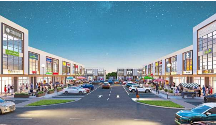
BPJ Business Park is poised to become a vibrant destination for shopping, dining and services in Sungai Petani.