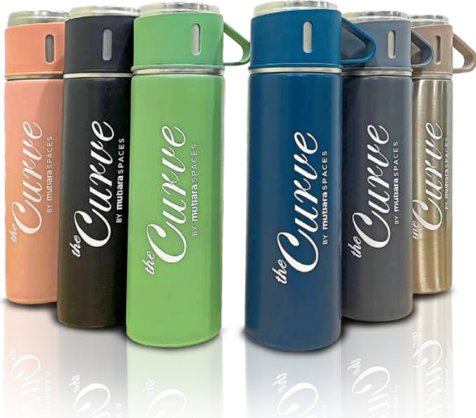
The Curve introduces a Redemption Programme where shoppers who spend a minimum of RM350 in two combined receipts will be able to redeem a limited-edition thermal flask.

■ For more information, log on to www.thecurve.com.my