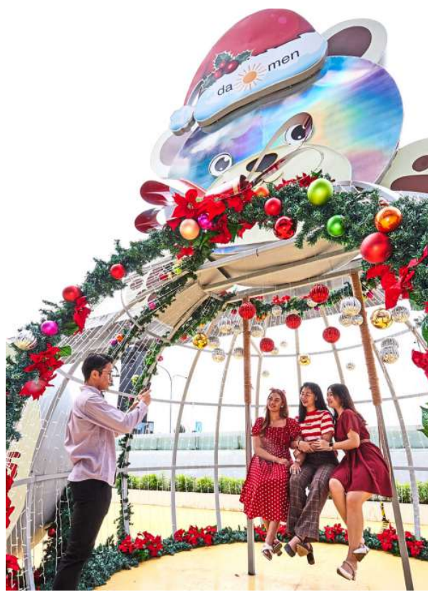
Da Men is adorned with twinkling decorations, featuring teddy bears in various sizes and colours, giant candy canes, a teddy-shaped dome with a swing, and so much more.

The mall is adorned with twinkling decorations, featuring teddy