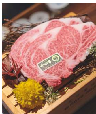
Miyazaki Wagyu beef has a solid texture and a chewy, juicy mouthfeel.

Lim emphasised that Wagyu beef is graded, with A5 being the highest level,