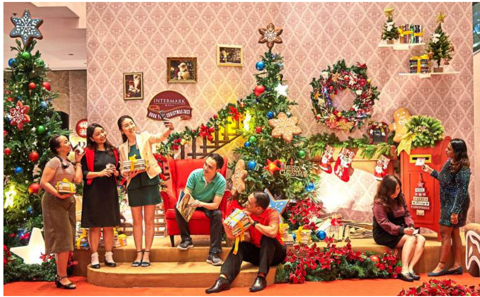
In partnership with Tsutaya Bookstore Intermark Mall and DoubleTree Kuala Lumpur, Intermark Mall aims to spread love and generosity through the 'Books Have Feelings' and 'Book For Care' campaigns.