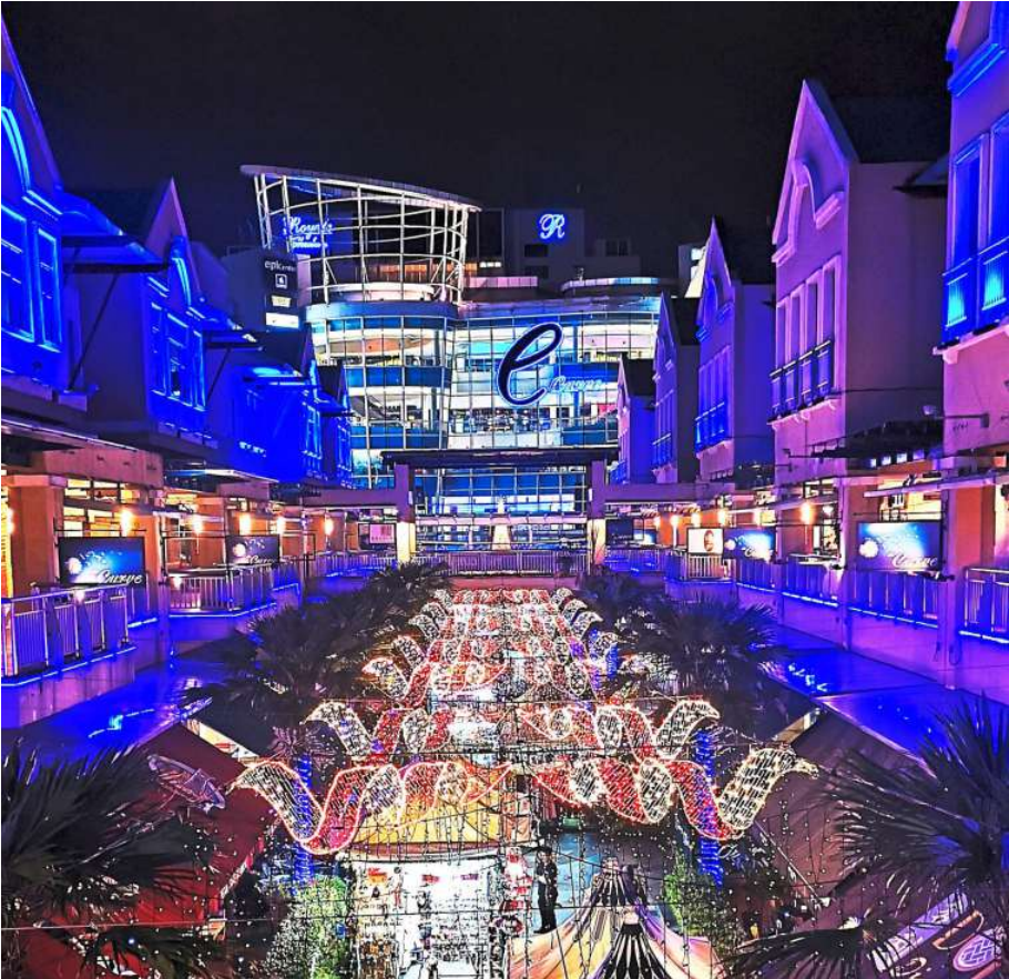
Spend a joyful Christmas with your family at the Curve and immerse yourself in the holiday magic as the mall transforms into a Pop Art-inspired Christmas Village Carnival.

EMBARK on a magical journey this festive season as the Curve transforms into a captivating “Jolly Christmas Carnival”, enchanting all who visit.