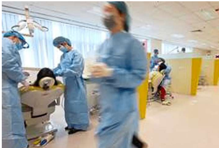
A glimpse of the everyday life of dental students in their clinical years at the on-campus dental clinic.

MEDICINE and dentistry remain hot career choices for young Malaysians leaving high school. While career choices are often easy to make, driven by a student's inner passion and drive, the same cannot be said when choosing the higher education institution where they can pursue their studies.