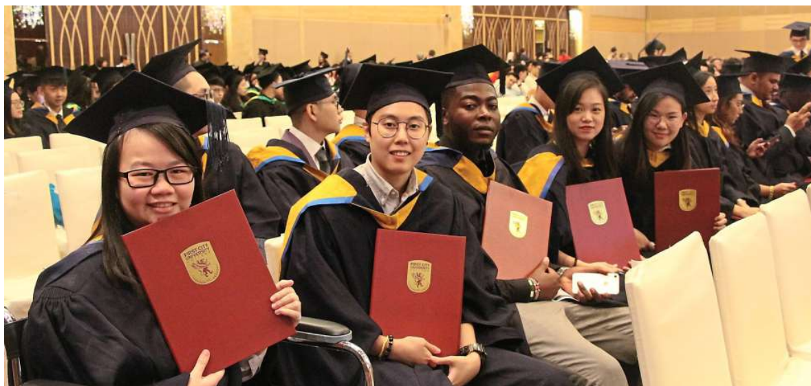
First City UC's Business and Finance graduates are not only familiar with the theoretical aspect of their respective fields, but are also able to demonstrate the necessary soft skills to thrive in their workplaces. (Graduation class of 2019)

Graduates will easily gain recognition from professional bodies such as CIMA (Chartered Institute of Management Accountants).