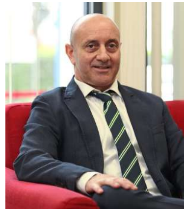
'Our staff believes in the value of each individual student and are committed to their growth,' says Cassarchis.

have finished in the top 20% in the world.