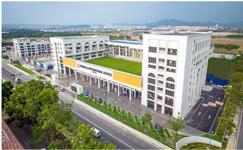
PISA offers the Victorian Curriculum for preschool, primary and secondary education.

PISA does not want its students to be just book smart, which is why