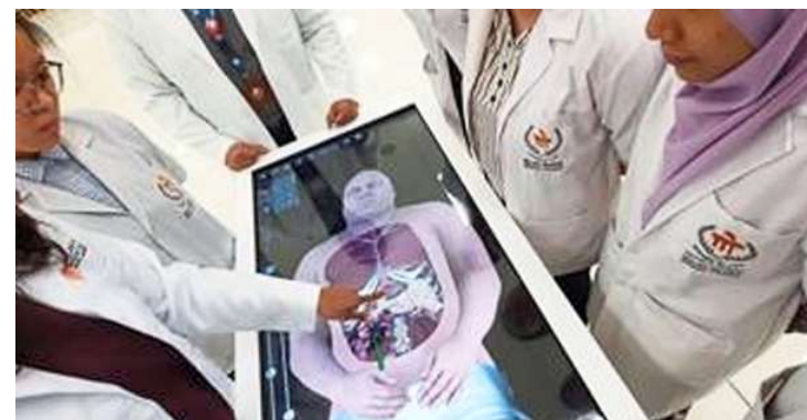
Students learning anatomy through augmented reality in the Augmented Laboratory.

Penang Branch Campus Tel: 011-1082 5618 / 04-899 5230 Email: penang@tarc.edu.my Perak Branch Campus Tel: 011-1075 8513 / 05-466 0388 Email: perak@tarc.edu.my Johor Branch Campus Tel: 011-1082 5624 / 07-927 0801/3 Email: johor@tarc.edu.my Pahang Branch Tel: 011-1082 5631 / 09-573 8171 Email: pahang@tarc.edu.my Sabah Branch Tel: 011-1082 5619 / 088-348 080 Email: sabah@tarc.edu.my