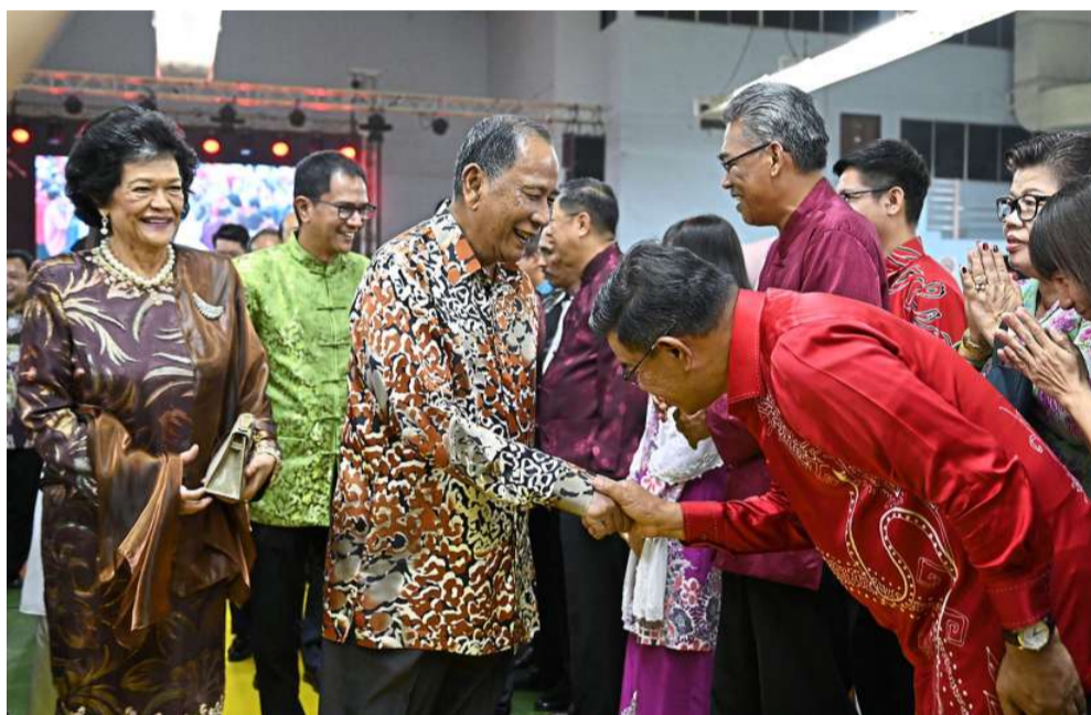
Sultan Sallehuddin greeting his subjects at a gathering with the people in Kulim in February 2020.

was engaged in security operations along the common border with Thailand in the states of Kelantan, Kedah and Perak.