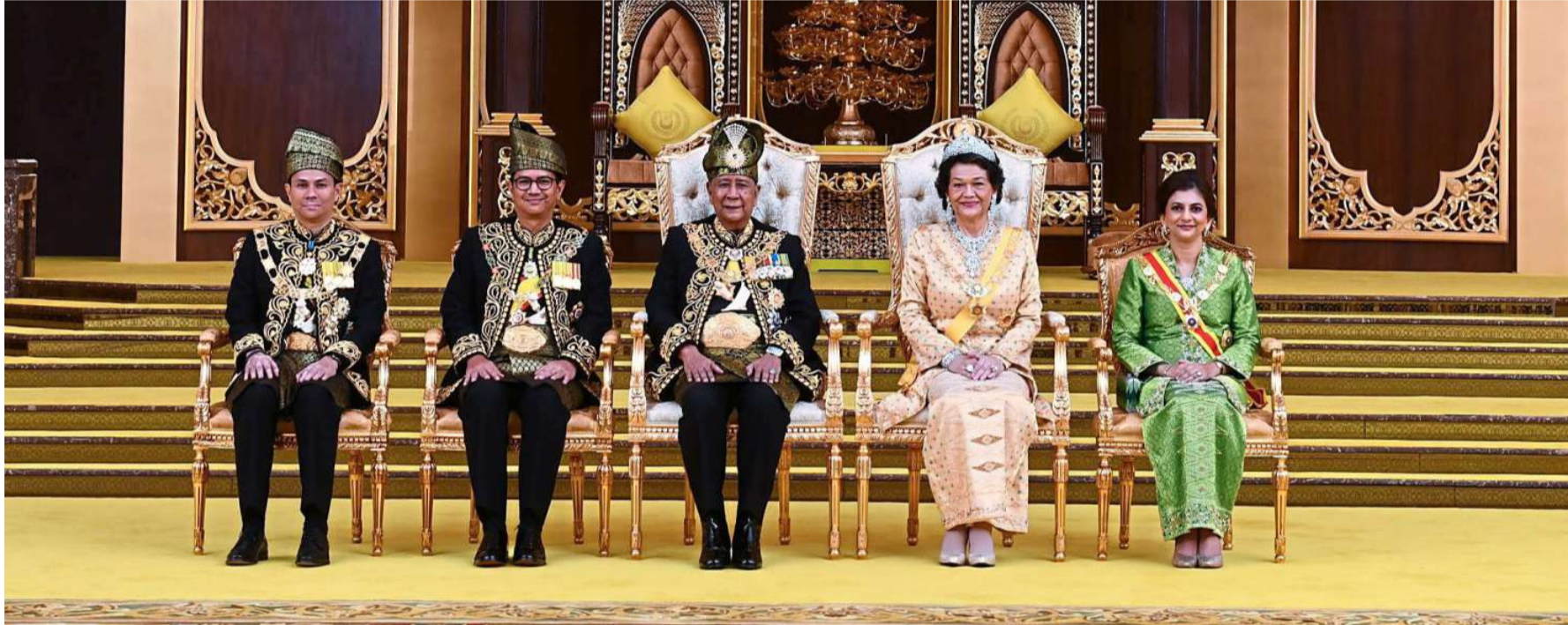
The royal family posing for an official photo.