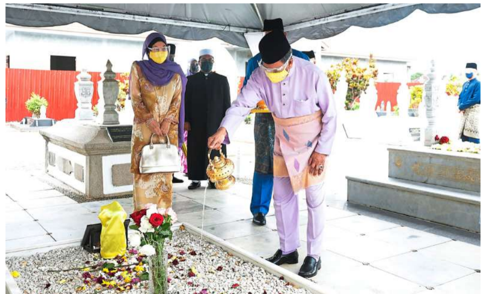
The Kedah Sultan and Sultanah visiting the Royal Mausoleum in conjunction with Hari Raya Aidilfitri.