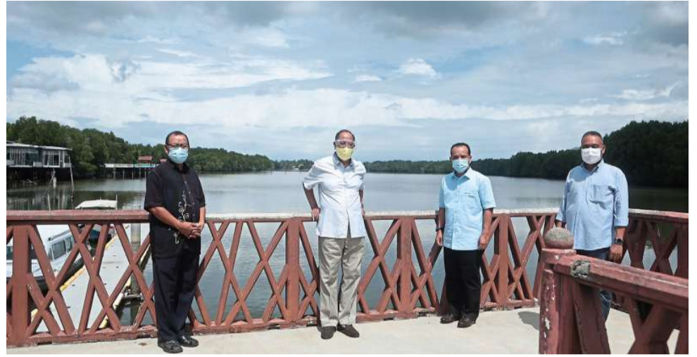
The Sultan visiting the Sungai Merbok Tourism Complex at Jeti Semilang in Kuala Muda.