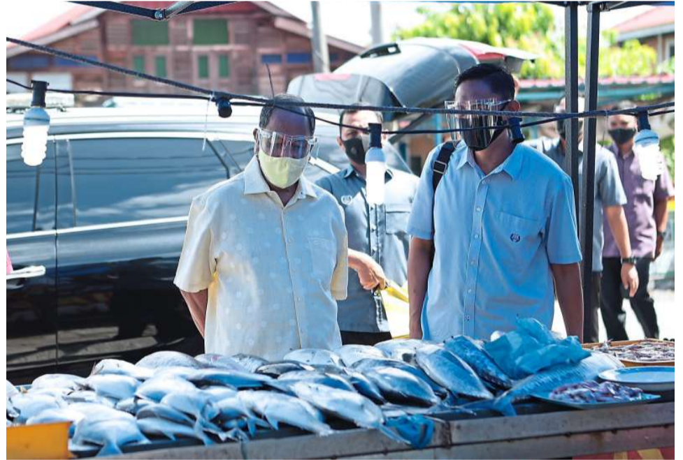
Sultan Sallehuddin visiting the fishermen's market in Kuala Kedah.