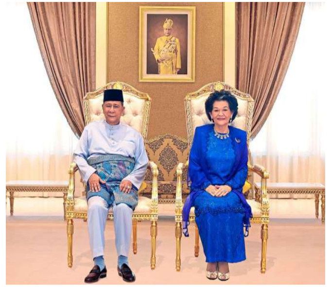
The Sultan and Sultanah at the Majlis Ramah Mesra for the royal family members.