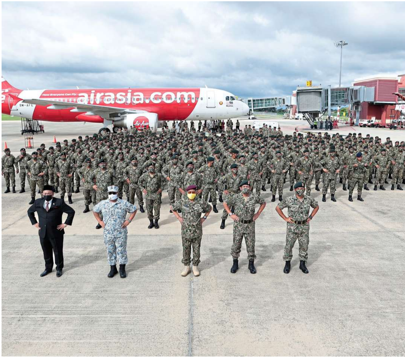
The Sultan flagging off a group from the Royal Malay Regiment's Sixth Battalion on an operation to Sabah. (Right pic) Sultan Sallehuddin performing solat sunat Hari Raya Aidilfitri at Masjid Zahir.