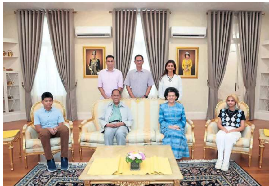
The Kedah royal family.

(Left pic) The Sultan and Sultanah at the breaking of fast event held in conjunction with his actual birthday on April 30.