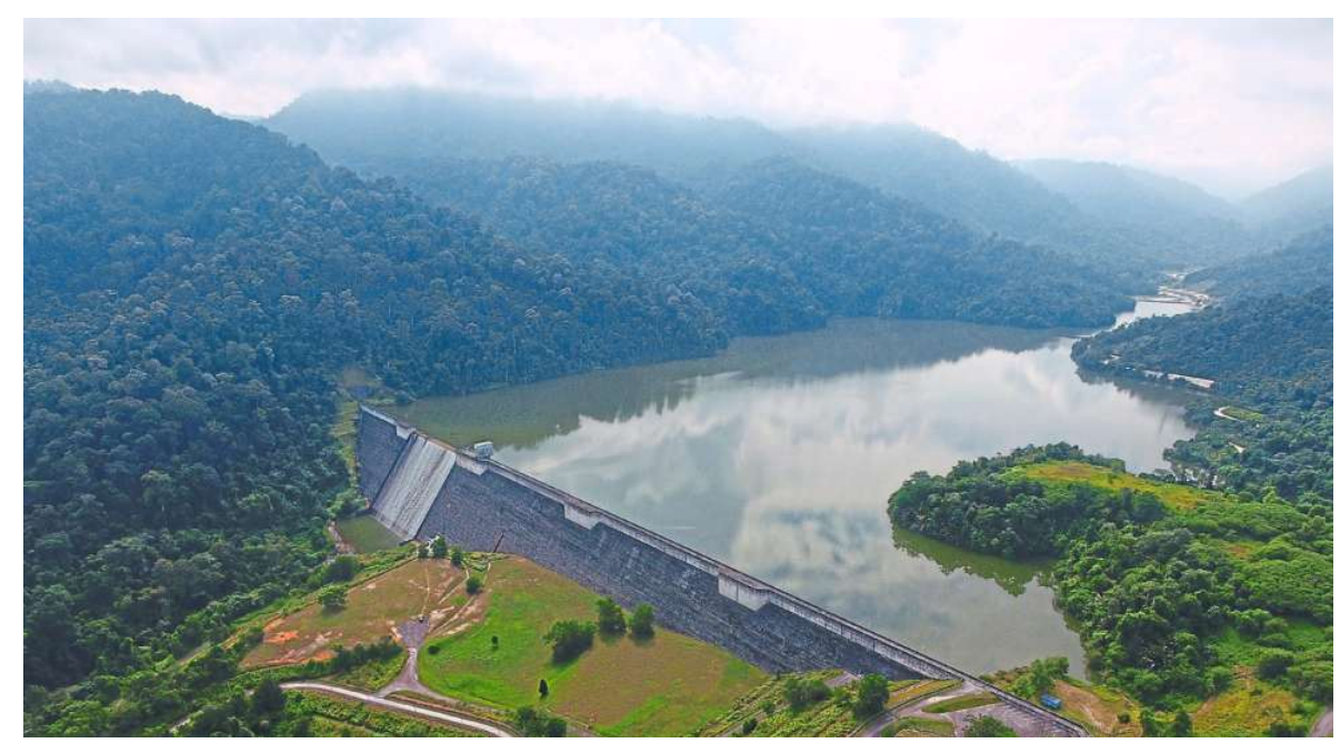
LAP has developed and used information technology systems for water quality monitoring, non-revenue water management and supply digital mapping among others.

Perak Water Board using technology to improve services, efficiency