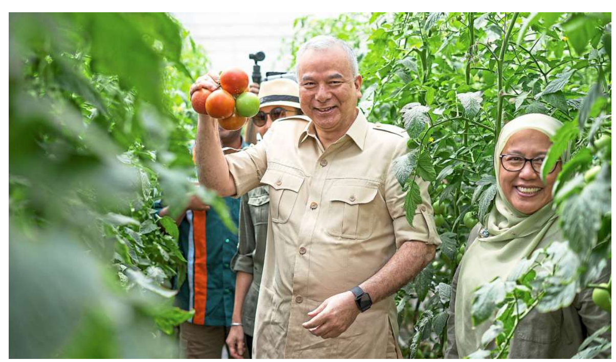
Sultan Nazrin holding a bunch of tomatoes grown at the Agroto Collection, Processing and Packaging Centre at KM19 Jalan Simpang Pulai, Cameron Highlands.

while also creating new jobs for locals and also opening up the international market for high value products from Perak.