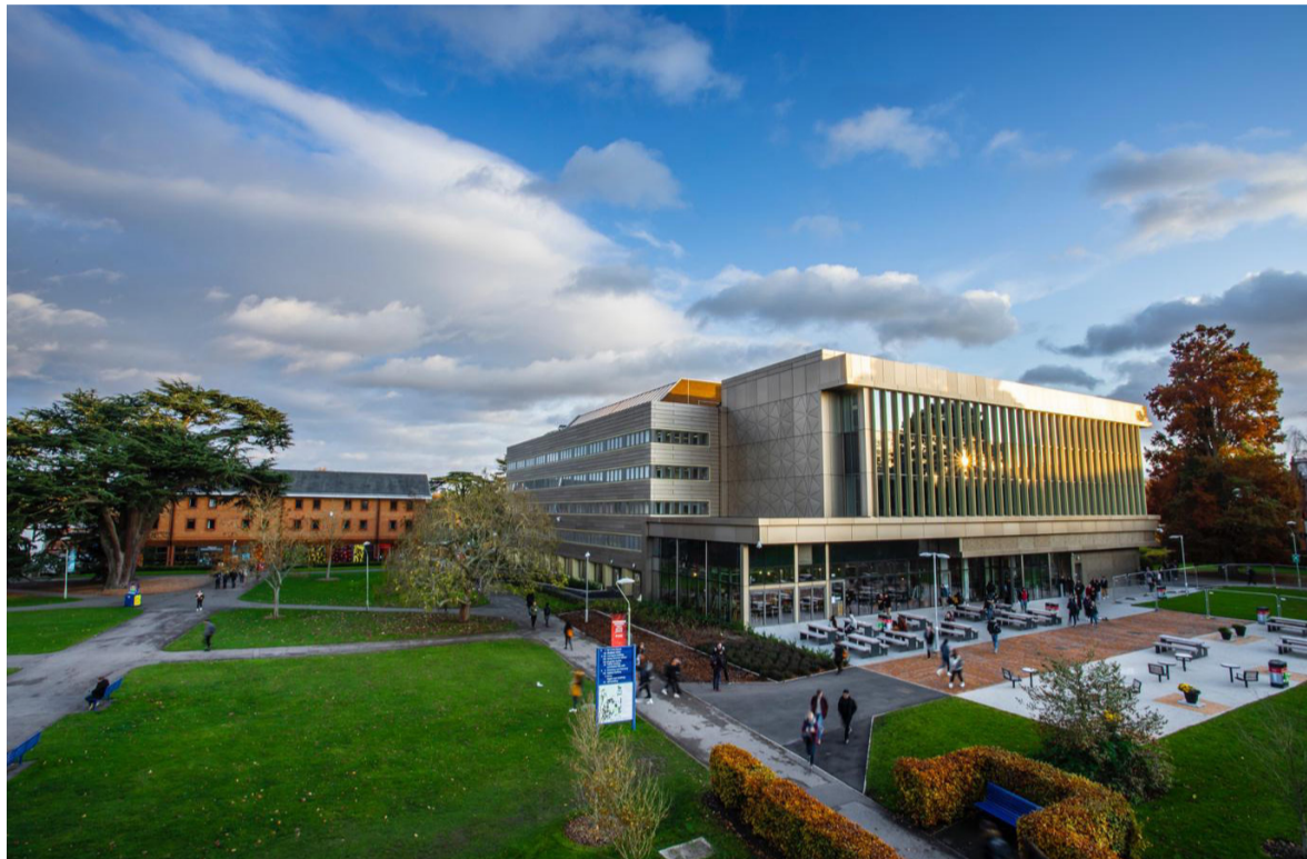
The award-winning campus in Reading UK is only 22 minutes by train to London.

Students in Malaysia have the opportunity to study with Henley Business School at the University of Reading's international branch campus located at Educity, Iskandar Puteri. Students get the best of both worlds – they receive exactly the same prestigious