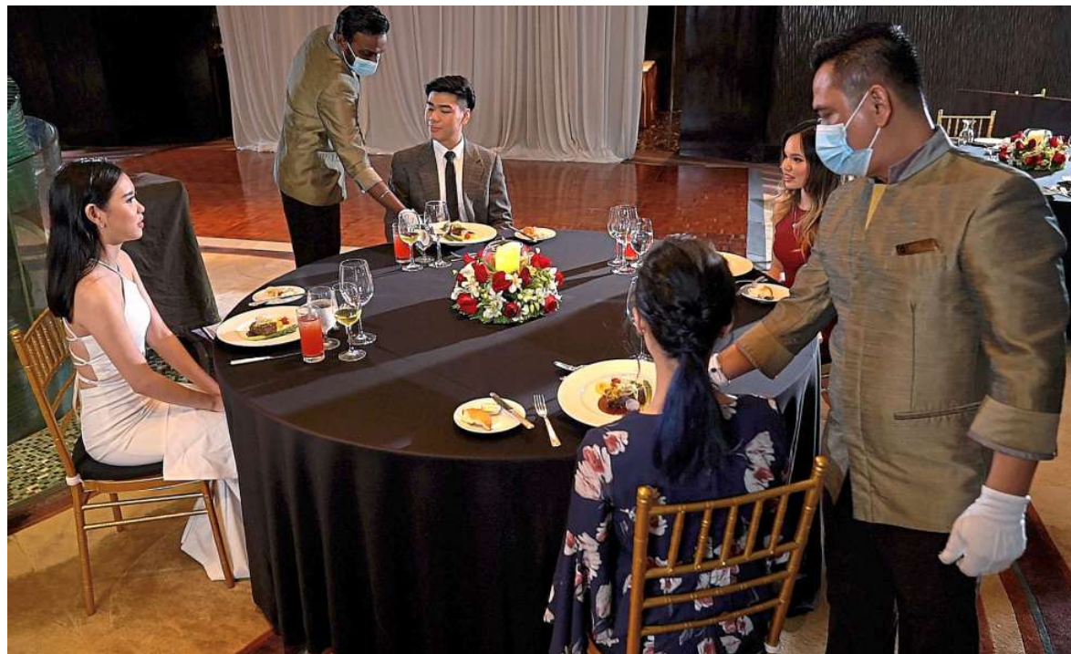
HELP University students being served at Lafite Restaurant, Shangri-la Hotel, Kuala Lumpur.

practised, smooths the path of daily activity, work, and play. This behaviour includes the common courtesies of life that many have forgotten or may not have learned at all.