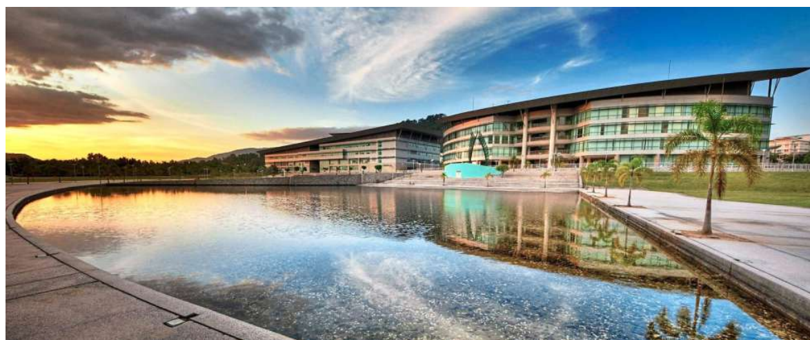
Despite the challenges of the pandemic, AIMST University is expanding and thriving.

Its academicians have produced high-impact scholarly publications and intellectual properties, and received coveted international innovation awards like PECIPTA'19,