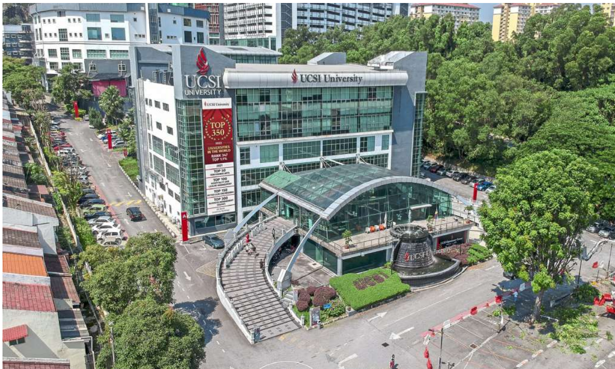
Above: UCSI is ranked as one of the world's top 350 universities in the QS World University Rankings 2022.

SUCCESS is attained from perseverance, audacity and a strong devotion to the things you want to see become. Often, a formal qualification is associated in the preliminary steps of building your "dream future".