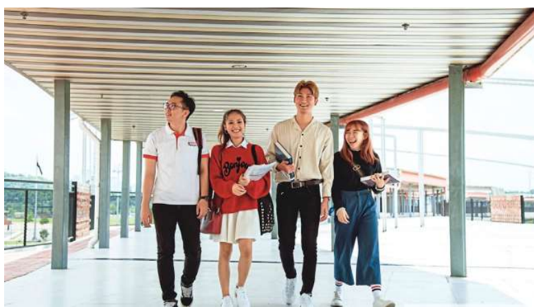
With global campuses, students can benefit by choosing to study in different geographical locations and interacting with different nationalities and cultures.

Acclaimed for its renowned UK degree programmes from Bangor University, Kolej MDIS Malaysia is all geared up to welcome its new