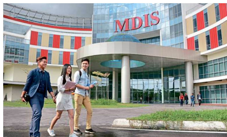
Kolej MDIS Malaysia spans across 12.14ha and is equipped with state-of-the-art infrastructure to facilitate students' learning experience.

Furthermore, the financial study loan provided by the National Higher Education Fund (PTPTN), for tertiary education and the Employee Provident Fund (EPF) withdrawal scheme, enables local students to tap on this financial assistance to graduate with a