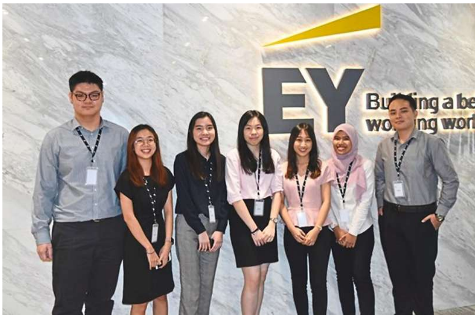
Former students on their industry placement at EY Johor.

Students in Malaysia have the opportunity to study with Henley Business School at the University of Reading's international branch