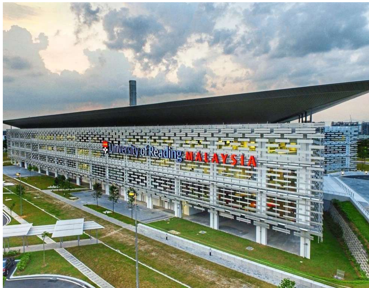
University of Reading Malaysia's state-of-the-art campus in EduCity Iskandar Johor.