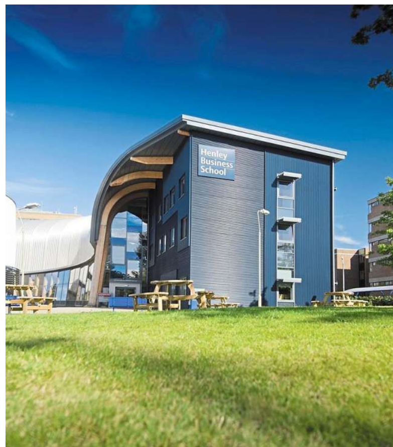
Students have the option to spend part of their studies at Henley in the UK.