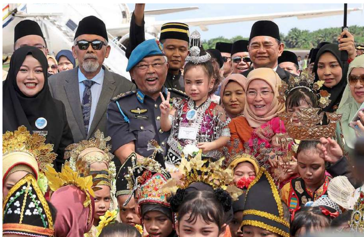
Sultan Abdullah and Tunku Azizah Aminah Maimunah Iskandariah were greeted by students from Tadika Kemas and Perpaduan Tawau when they arrived at the Tawau Airport.

THROUGHOUT Al-Sultan Abdullah Ri'ayatuddin Al-Mustafa Billah Shah's reign as the 16th Yang di-Pertuan Agong, the Raja Permaisuri Agong has stood as a pillar of strength beside her husband.