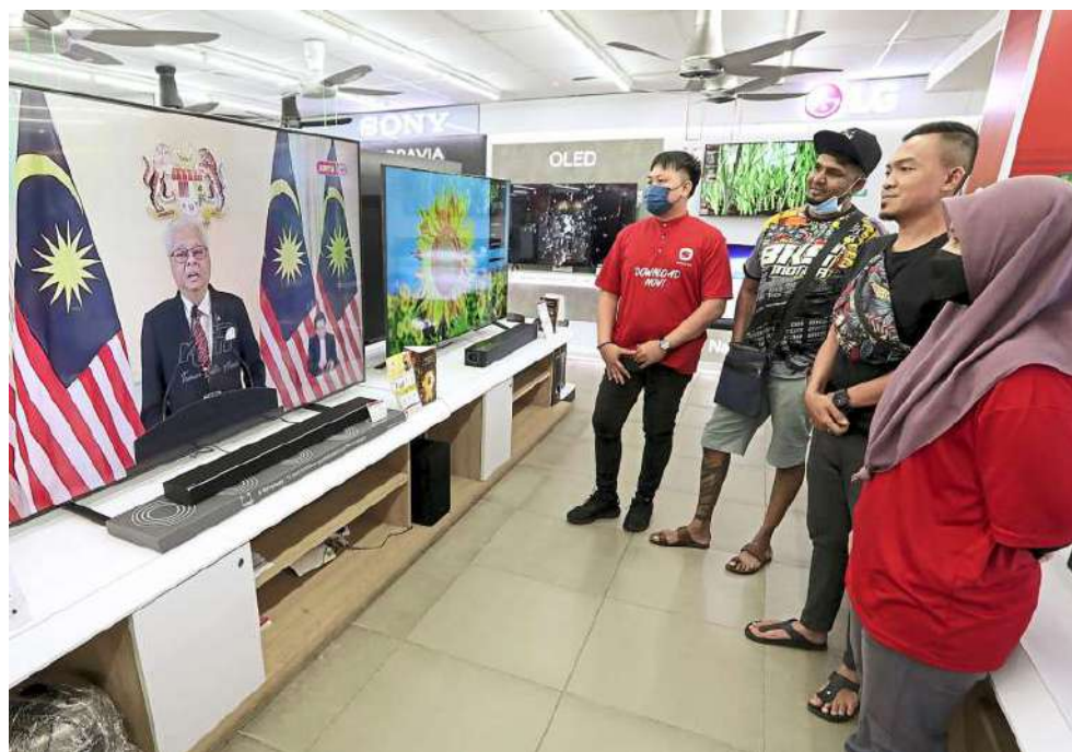
Staff members and customers watching the dissolution of Parliament announcement by Ismail Sabri on Oct 10, 2022.