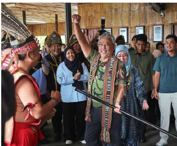
Sultan Abdullah trying the sumpit during a visit to the Kadazandusun Cultural Association Complex (KDCA) (left) and with a baby Bornean elephant known as Taburi at the Orang Utan Conservation Centre in Sepilok in conjunction with the Kembara Kenali Borneo programme. With His Majesty is Tunku Azizah.

Sultan Abdullah did not give his assent in October 2020 when then-prime minis-