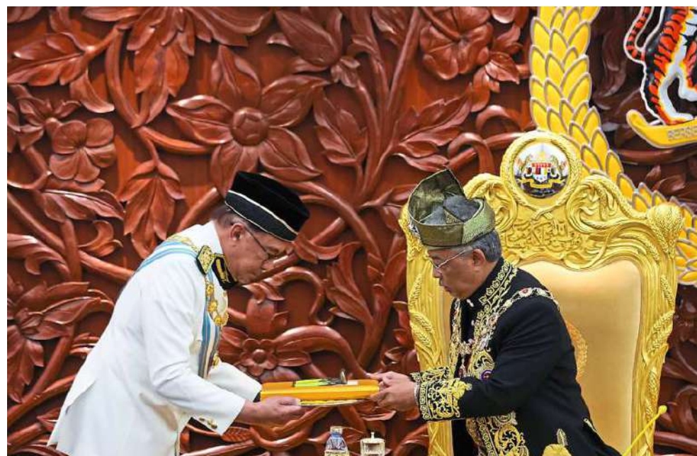
Sultan Abdullah presenting Anwar Ibrahim with the Royal Decree at the opening of the 15th Parliament.