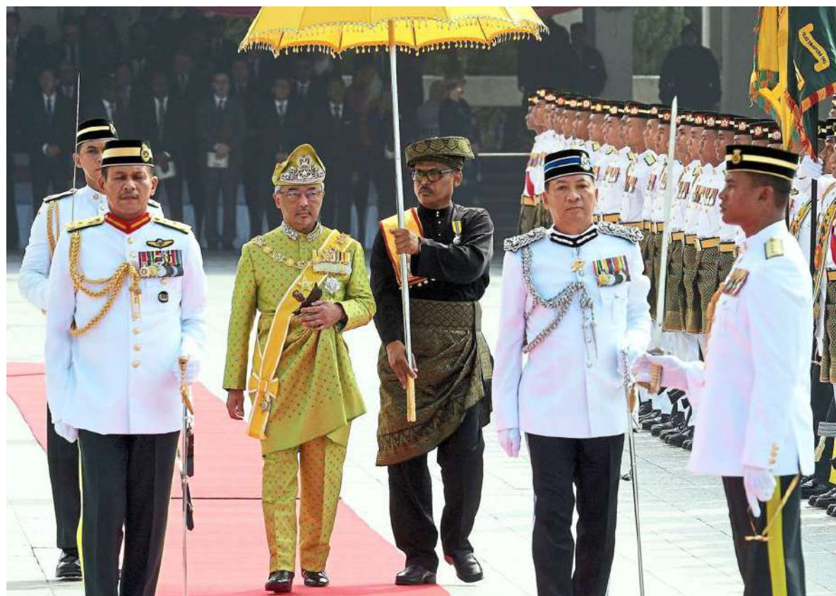
Sultan Abdullah inspecting the guard of honour during the opening ceremony of the second session of the 14th Parliament in March 2019.