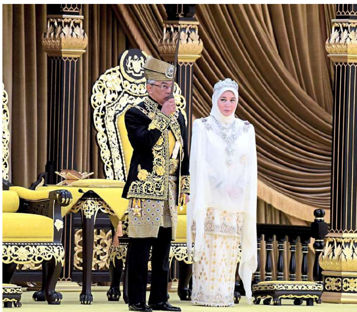
Sultan Abdullah kissing the Keris Panjang Diraja which symbolises the centralisation of power entrusted to him during his installation ceremony at Istana Negara on July 30, 2019.

Jan 30, 2024 – Sultan Abdullah ends his tenure as Yang di-Pertuan Agong, with Sultan Ibrahim Almarhum Sultan Iskandar beginning his term next.