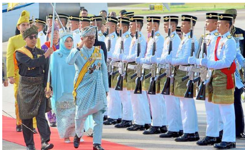
Sultan Abdullah and Tunku Azizah arriving at the Bunga Raya complex, KLIA, for the welcome ceremony in Parliament on Jan 31, 2019.

AS Al-Sultan Abdullah Ri'ayatuddin Al-Mustafa Billah Shah ends his term as Yang di-Pertuan Agong, we take a look back at how His Majesty ascended to the position.