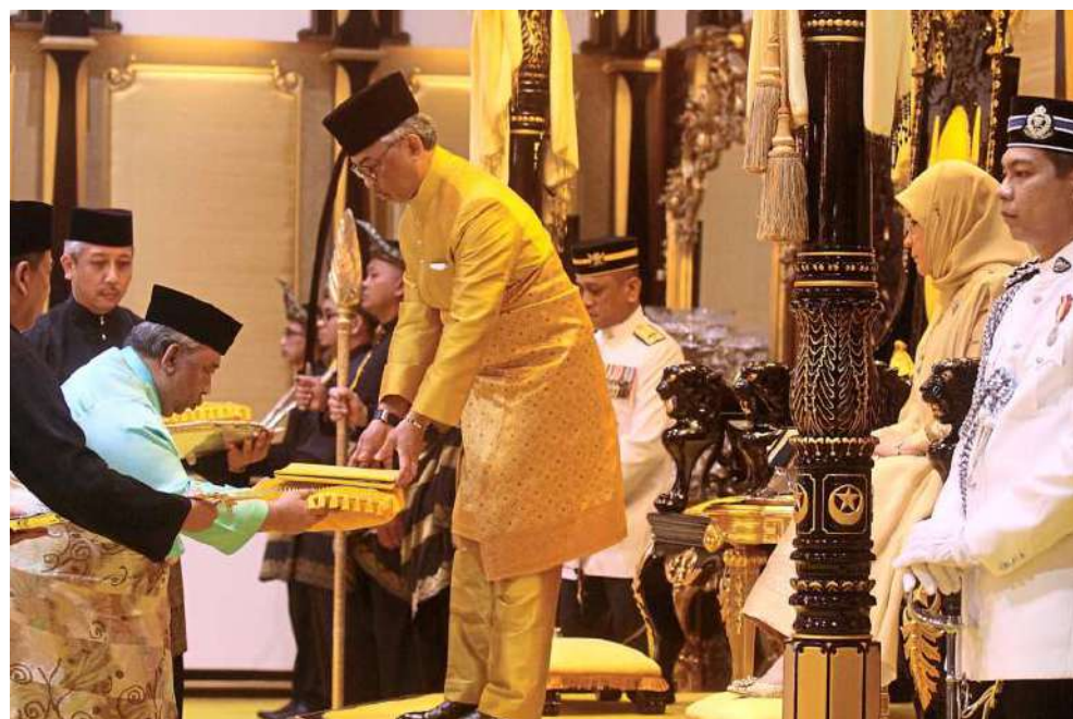
Sultan Abdullah receiving the 'Titah ikrar' text speech as the Sixth Sultan of Pahang, from his brother Tengku Abdul Rahman during the ceremony held in Istana Abu Bakar, Pekan.