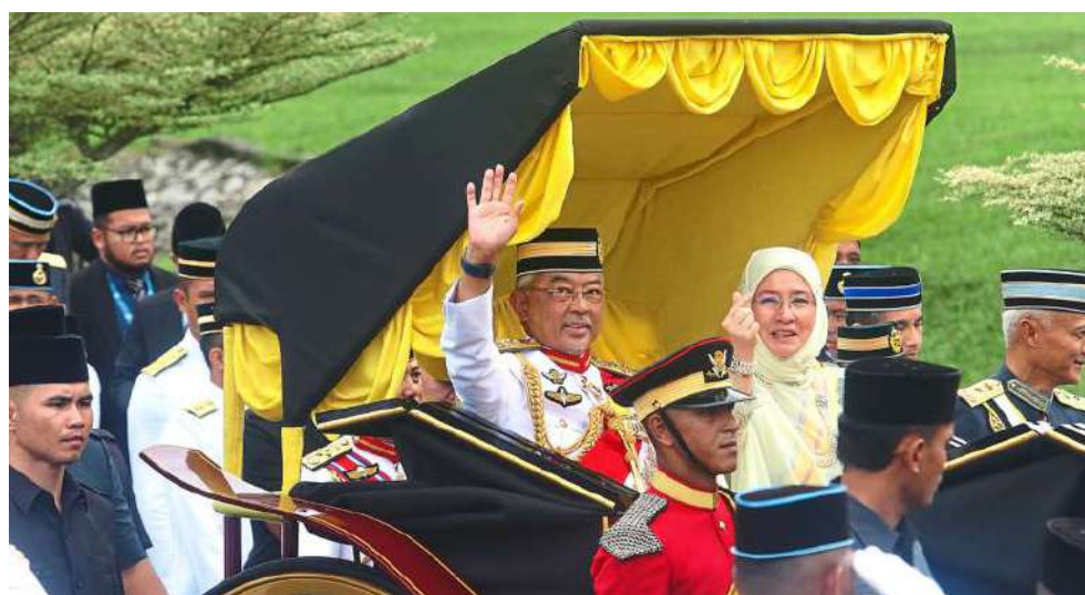
Sultan Abdullah and Tunku Azizah gracing the Parade of Thanks to mark the end of his reign as the 16th Yang di-Pertuan Agong at the Army Square, Sungai Besi Camp.