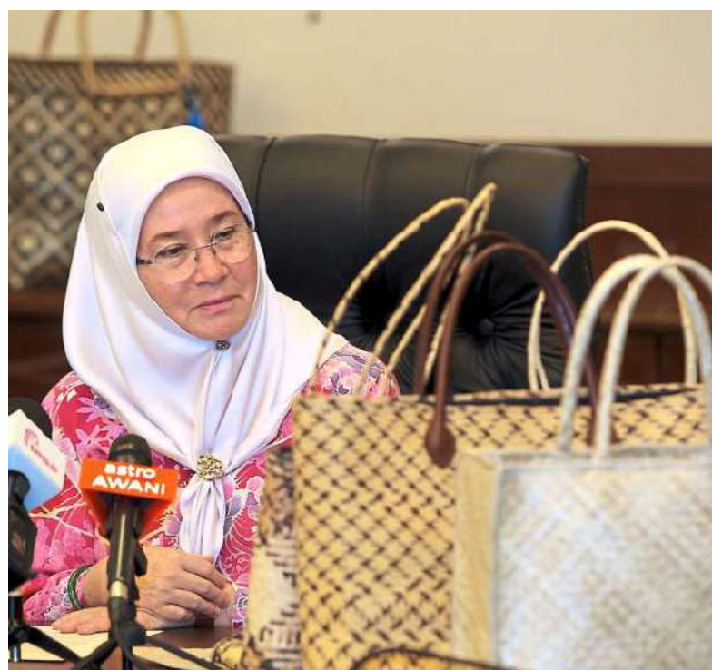
Tunku Azizah speaking during a press conference at Istana Negara to announce details of the Malaysia Heritage Crafts exhibition organised as part of London Craft Week.