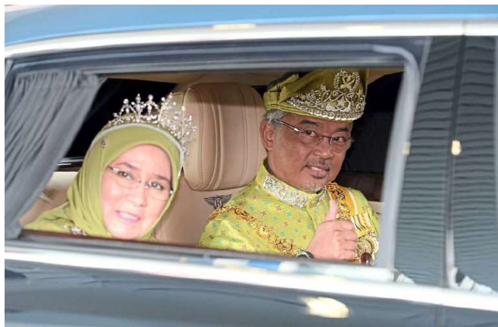
Their Majesties leave after the opening ceremony of the second session of the 14th Parliament.