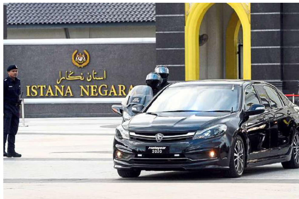
Dr Mahathir leaving the palace after meeting the king on Feb 24, 2020. His resignation as prime minister caused the collapse of the Pakatan Harapan government.