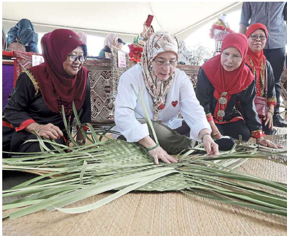
Tunku Azizah weaving a mat during the Pesta Keramaian at the Kembara Kenali Borneo programme in Pantai Bungai Bekenu.