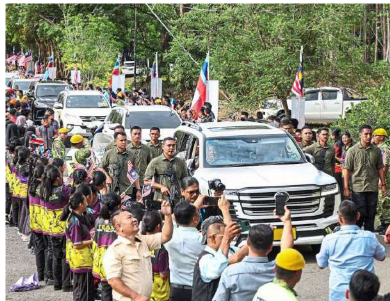
Sultan Abdullah and Tunku Azizah being greeted by hundreds of people upon arrival at the Sabah Forestry Institute in Telupid (above) and by teachers and students in Tawau (below).