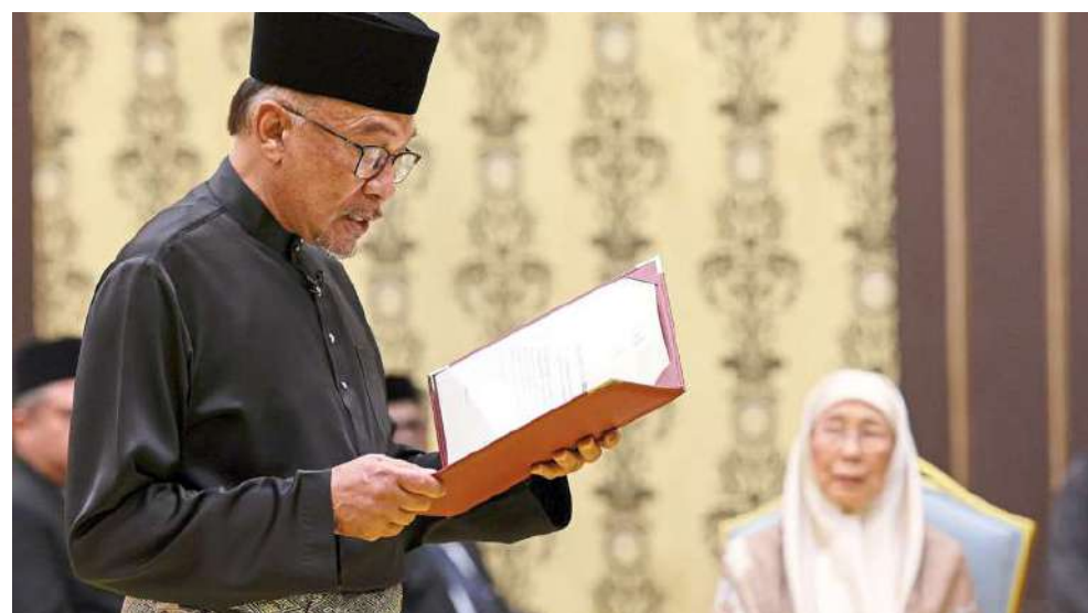
Anwar took his oath of office, loyalty and secrecy before Sultan Abdullah at Istana Negara on Nov 24, 2022.