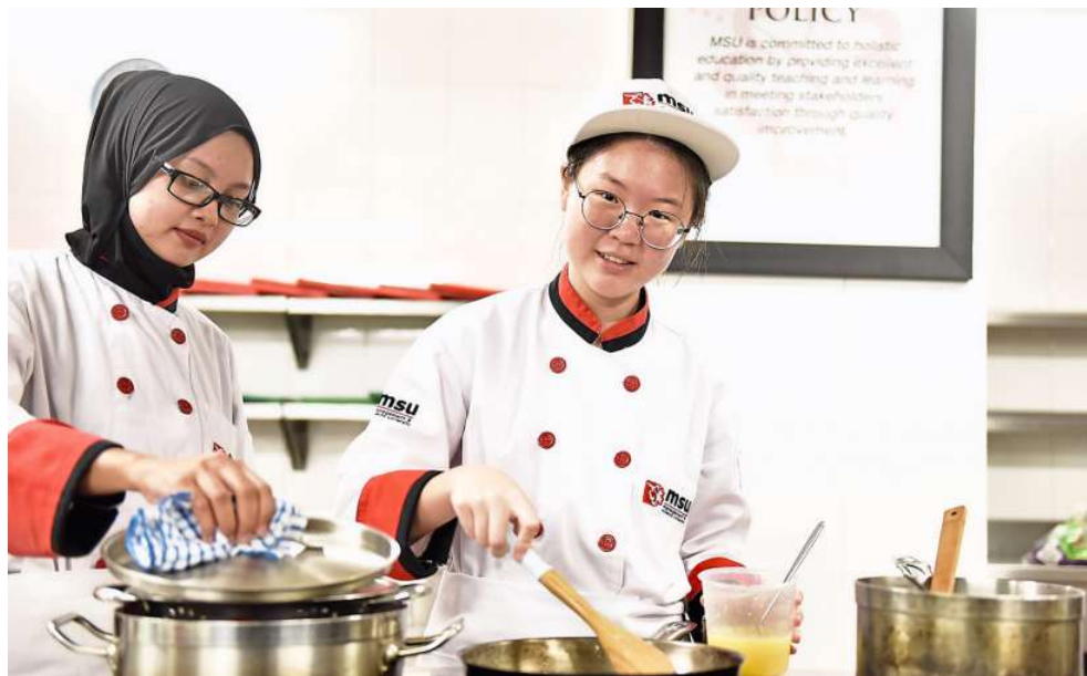
MSU College's Diploma in Culinary Arts programme prepares students for the exciting and rewarding world of food preparation.