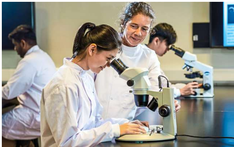
NUMed's biomedical sciences students can explore a number of interesting and rewarding career opportunities.

"This multidisciplinary approach gives students in-depth knowledge