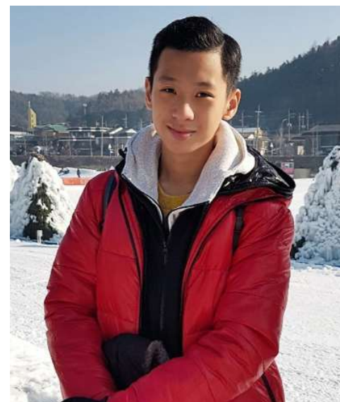
Song says studying at UTAR has taught him to solve problems critically and logically.

Other elective courses offered in the programme include Management Principles,