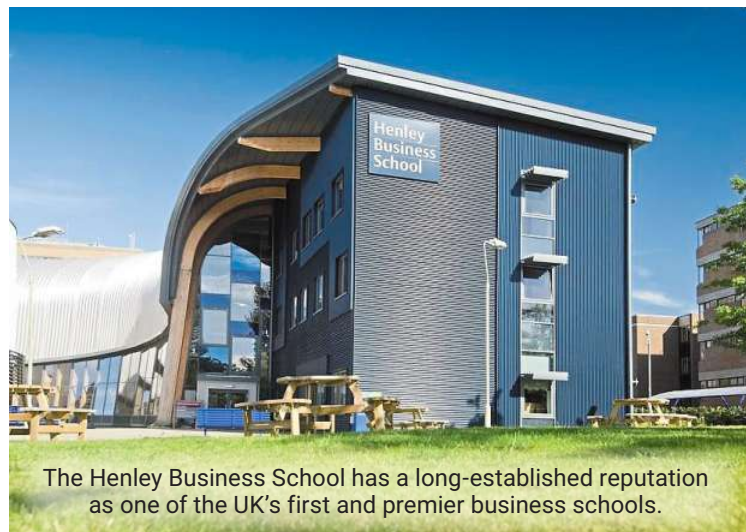
The Henley Business School has a long-established reputation as one of the UK's first and premier business schools.