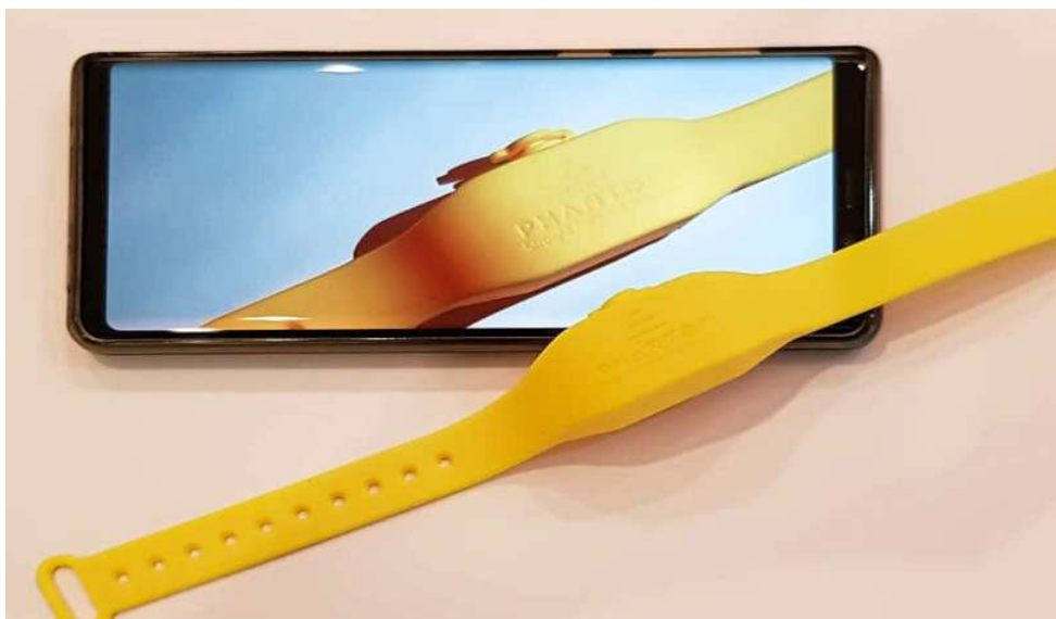
The PhantomBand can be used to dispense hand sanitiser, sunblock and other liquid or gel-based products.

Currently, Phantom Trading Co is an online business that operates mainly on Shopee and Lazada. It also has its own website at www.phantomtrading.co , and is performing positively and generating steady profits.