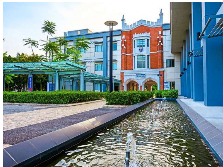
NUMed offers students in Malaysia and around the region solid grounding in the field of medical and biomedical researches.

NUMed is also actively involved in research projects that impact communities in South-East Asia.