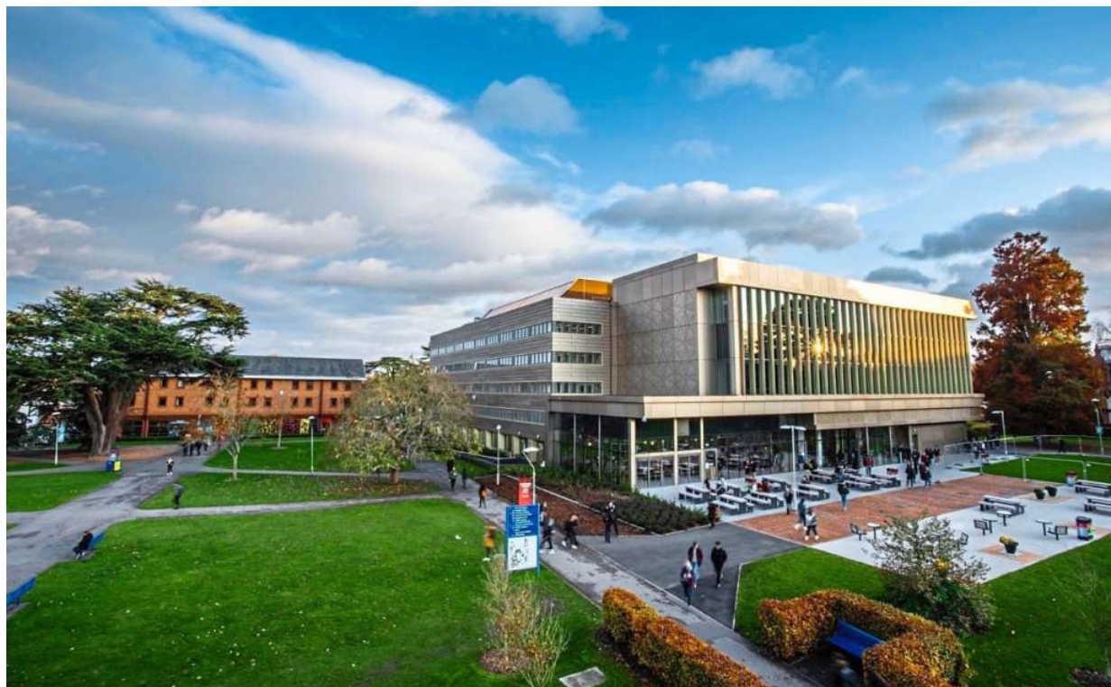
The award-winning Whiteknights campus in Reading, the UK, occupies 130ha of beautiful parkland.