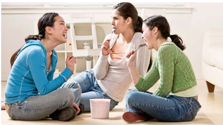
Widen your social circle by meeting new people and introduce existing friends to new ones. That way, you can meet in groups.

Second, there will be people you click with instantly and it will be