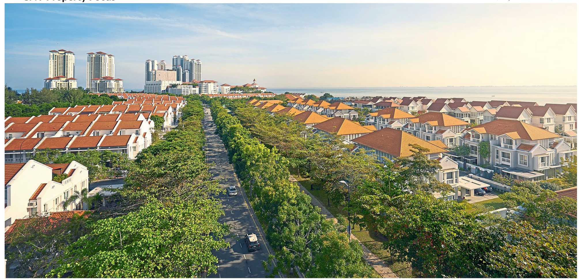
The second phase of the idyllic seafront township of Seri Tanjung Pinang in Penang is about to kick off, bringing more quality residential, commercial and leisure facilities.

CNY Property Focus THE STAR, FRIDAY 12 FEBRUARY 2021