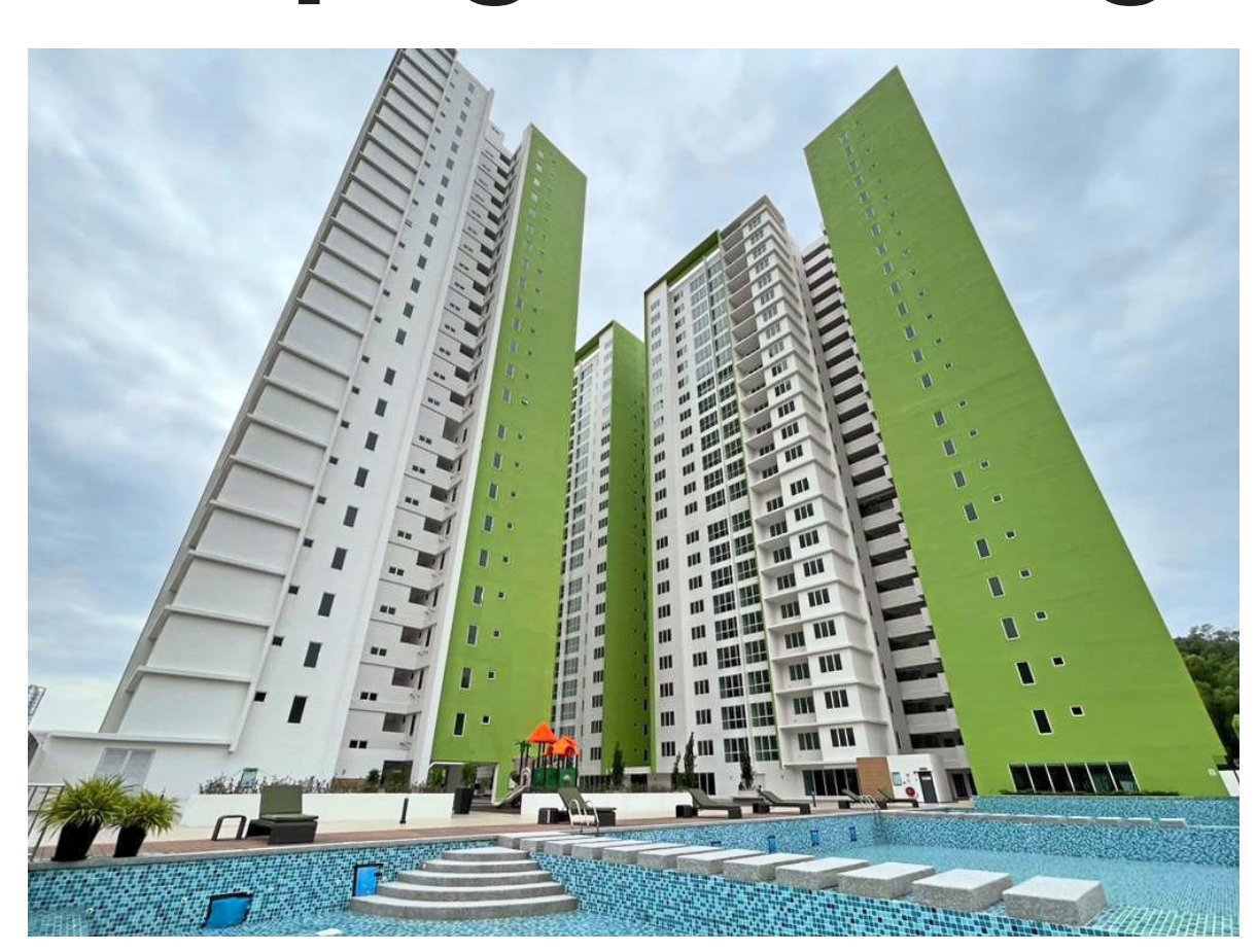
Emerald Residence is equipped with a host of condominium facilities