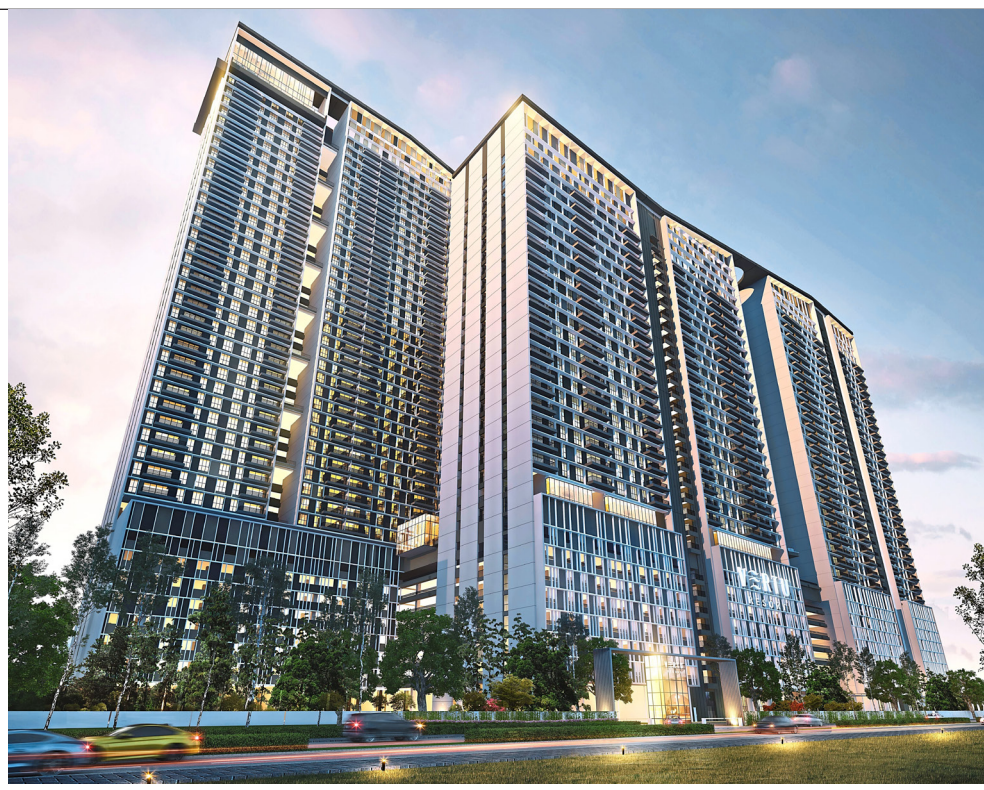
Buyers can easily own an elegant unit at Vertu Resort thanks to Aspen Group's Aspernormous 2021 offerings.