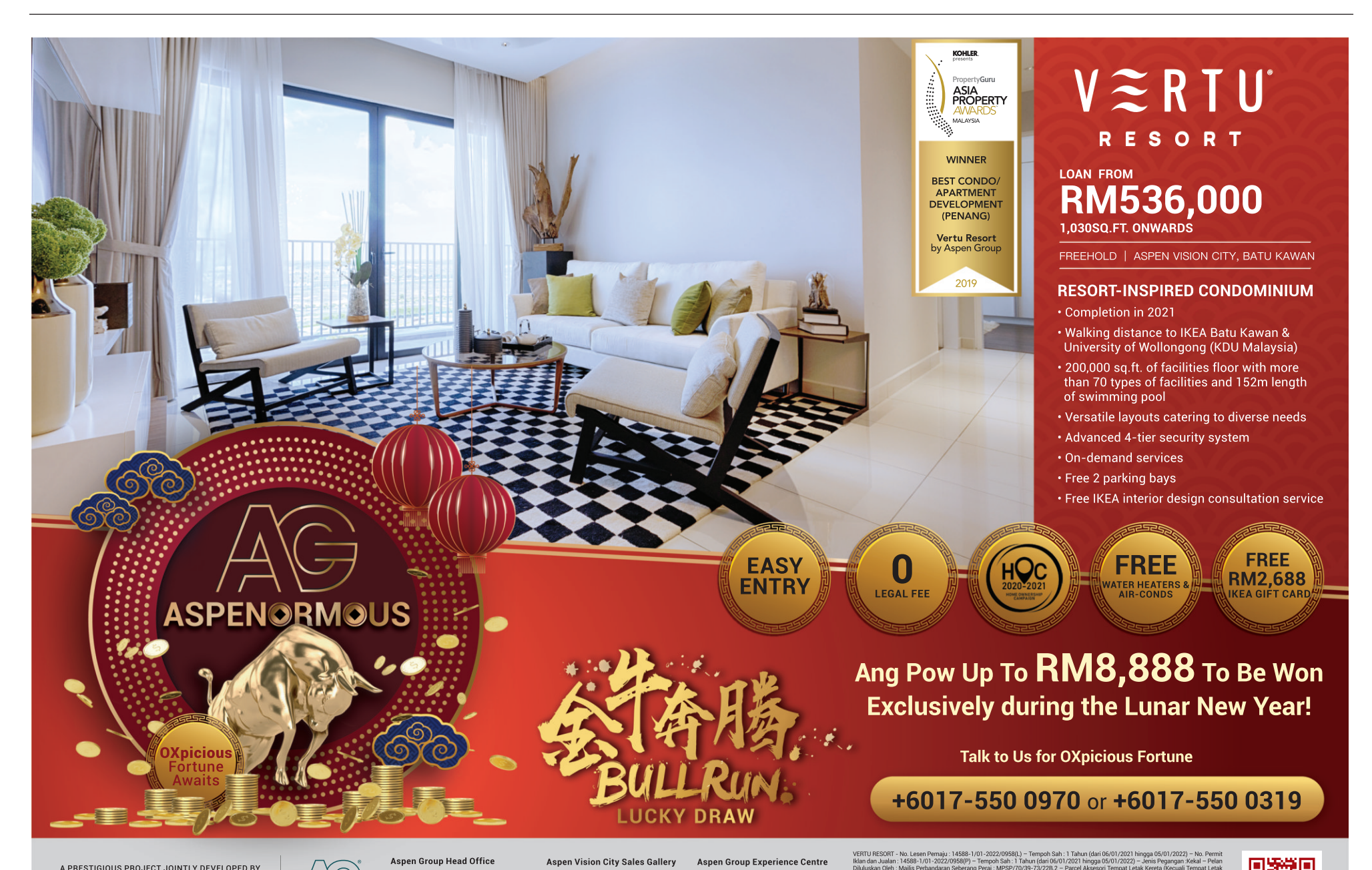
Vertu Resort in Batu Kawan boasts the longest swimming pool in Southeast Asia.