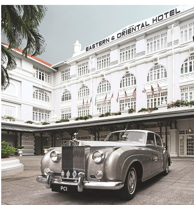
E&O's portfolio ranges from hospitality to luxury. An aerial view of the masterplanned Seri Tanjung Pinang (left) and the globally renowned E&O Hotel in Penang (right).