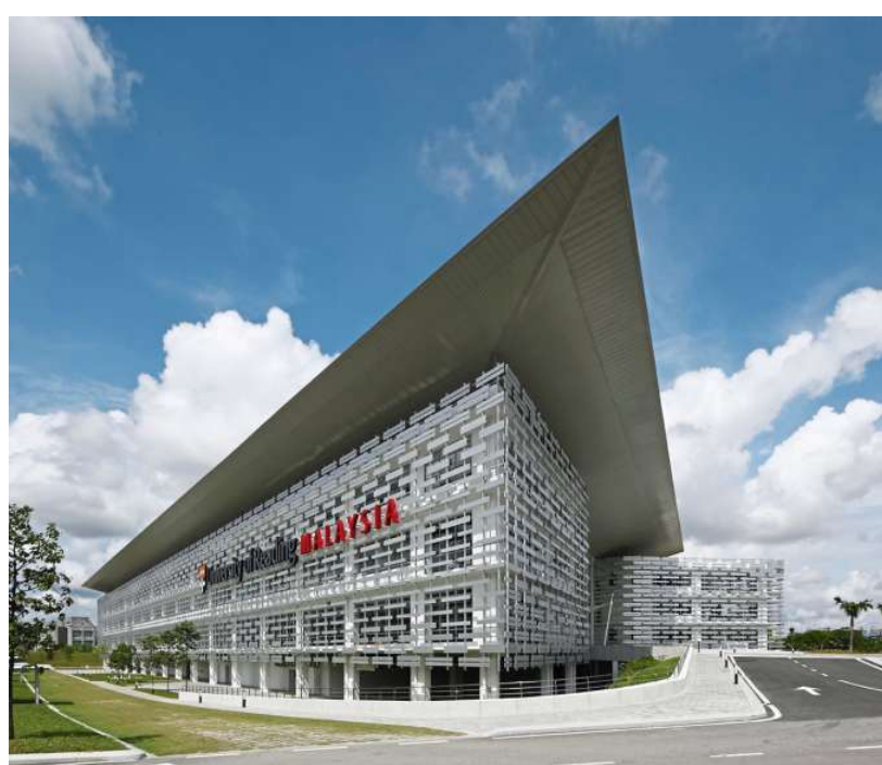
University of Reading Malaysia's iconic, state-of-the-art campus in EduCity Iskandar Johor.

Further programme details can be found at reading.edu.my/programmes