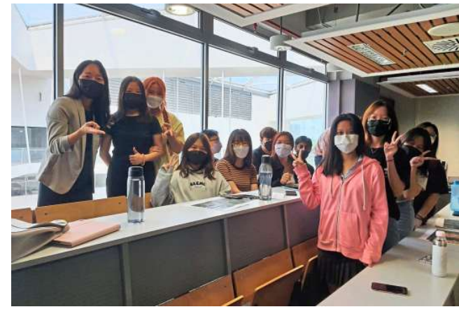
Students enjoy an immerse learning environment where they can develop their soft skills and enhance their English

Top 3 in Graduate Employability By Talentbank's GE Index 2022