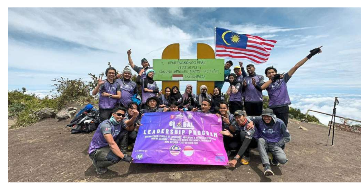
Hiking up Indonesia's Mount Merbabu of Central Java in I.P.E.A.K. Expedition 1.0.

Envisioning a better, more sustainable future for all, it champions equality by providing a level playing field across extensive efforts in transforming lives, enriching future through