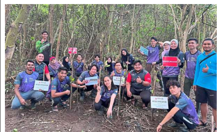
Mangrove planting in the Baros Conservation Area, initiatives by a

■ For details, look out for the advertisement in this StarSpecial.