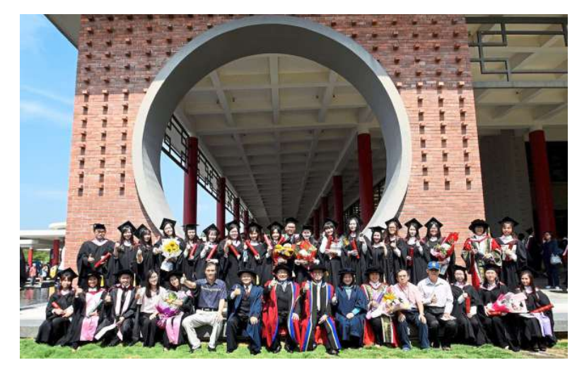
Chinese Studies' graduates sharing the joy with their lecturers.

The programme covers courses such as History of Chinese Literature, Chinese History, Modern and Contemporary Chinese Literature, The Four Confucian Classics, Modern Chinese Language, Chinese in Malaysia, Malaysian Chinese Literature, History of Chinese