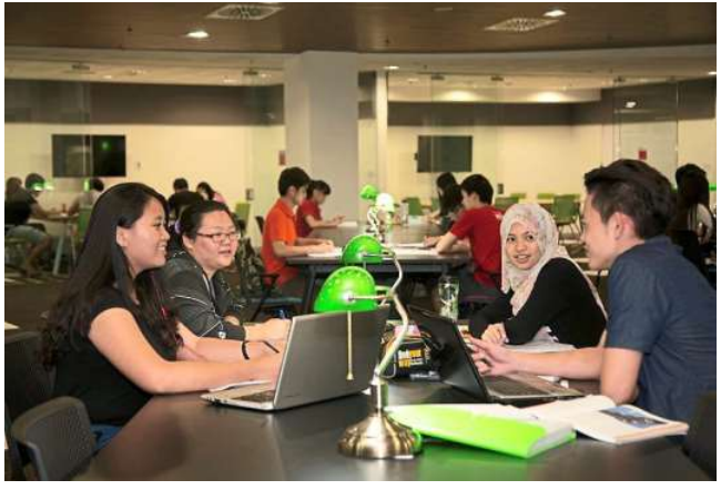
Students benefit from spacious state-of-the-art learning facilities and small class teaching that promotes interactive