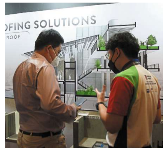
Guests learning what Total Coating and Construction Solutions has to offer at the booths.