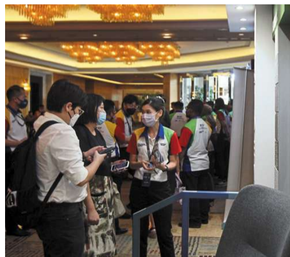
Guest going on an experiential tour to understand the concept of Total Coating and Construction Solutions.