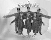
Raya OpenHouse Performance

CULTURE LEGACY OF MALAYSIA PERFORMANCES 15 th Mar - 11 th Apr 2025