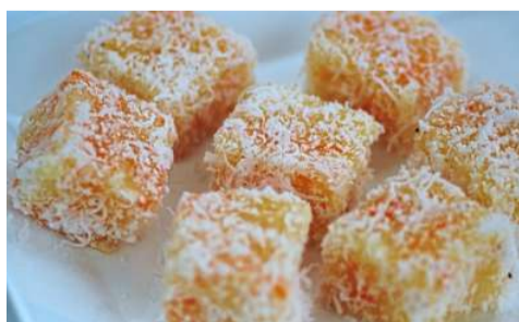
Dainty cubes of tapioca and sweet potato kuih.

powder and coconut milk. Stir well to mix.