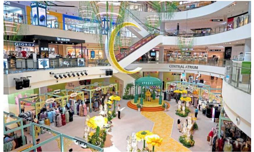
Aman Central provides a vibrant setting for Eid celebrations, offering families a space to shop, gather and enjoy the festive spirit of Raya together.

■ Get exclusive updates at www.amancentral.com.my , www.facebook.com/AmanCentralAlorSetar , www.tiktok.com/@amancentraltiktok and @amancentral (Instagram) or call 04-735 2626.