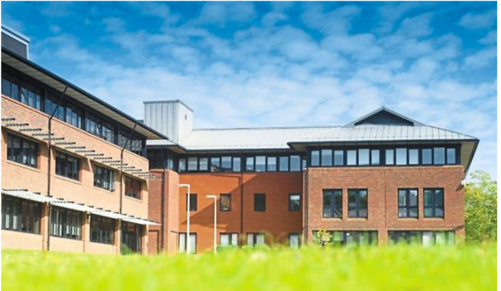
The University of Reading is ranked among the Top 150 in the World for Psychology (THE Subject Ranking 2021).