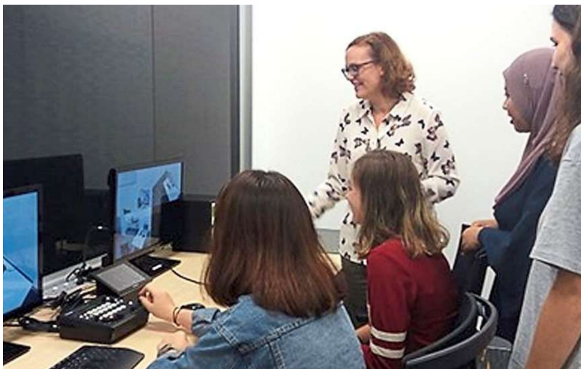
Psychology students undertake research projects as part of their studies.

More recent studies in 2019 showed that fruit and vegetable