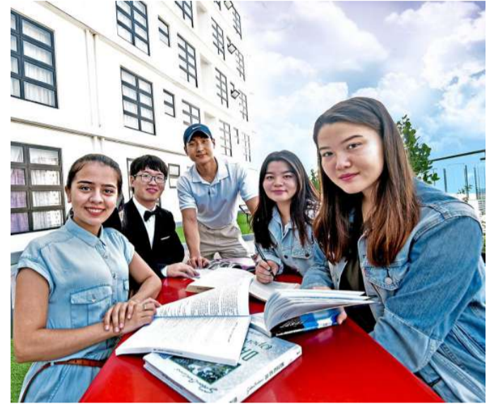
Comprehensive mobility opportunities for all MSU students enhance their graduate employability.

■ For details, look out for the advertisement in this StarSpecial .