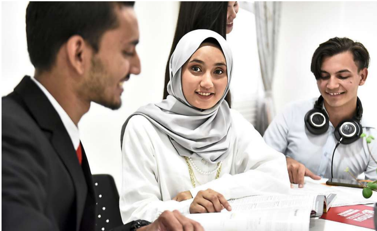
MSU College's Diploma in Management programme offers a broad business management education and equips students with essential soft skills.