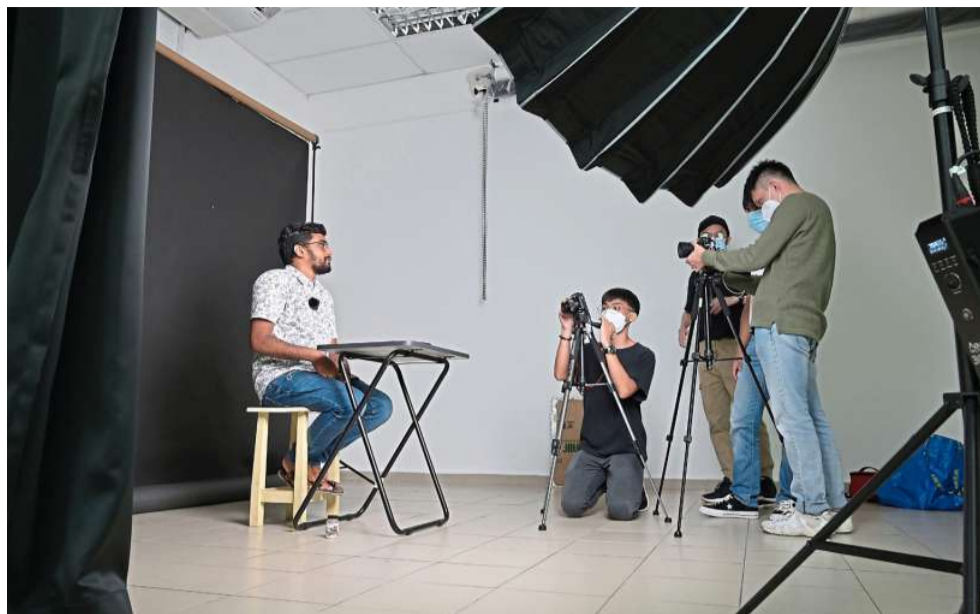
TAR UC's Broadcasting programme provides students with skills and hands-on experience with a number of production-based subjects.