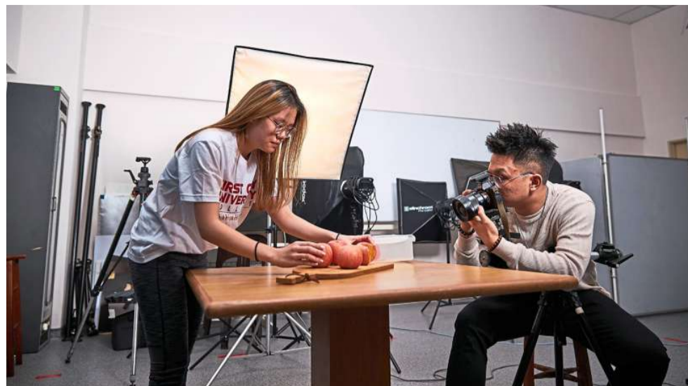
FDBE students learn photography skills in a state-of-the-art photography studio.