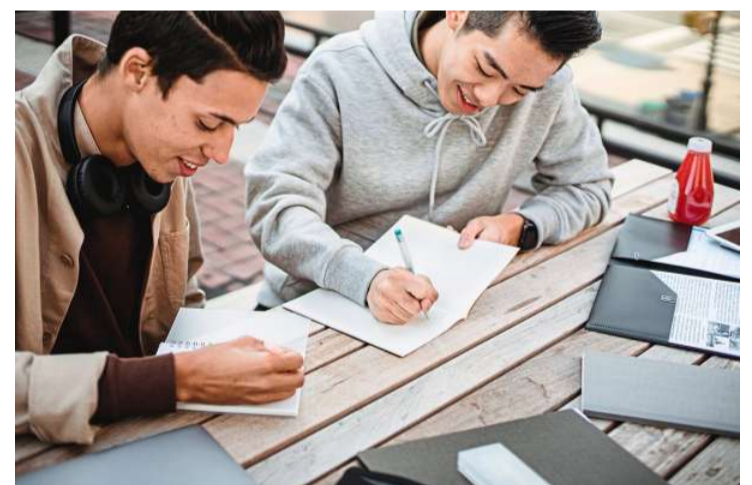
Studying is not about having fun with someone you like; it's about finding someone you can work with.

Sabah Branch ☎ 011 - 1082 5619 088 - 348 080 sabah@tarc.edu.my