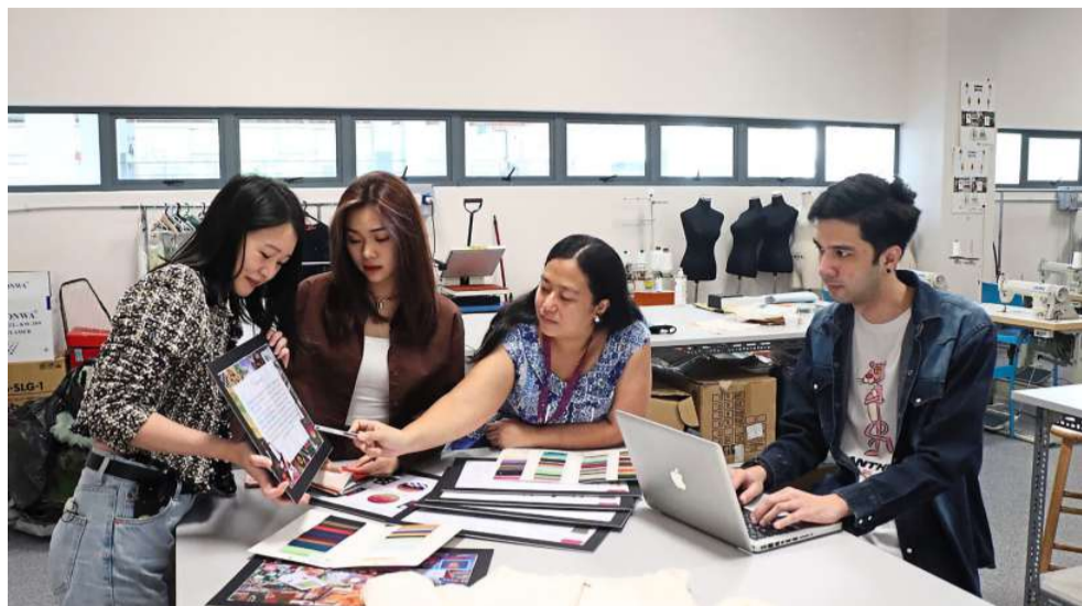
Fashion Marketing programme students present their ideas and designs during a class.