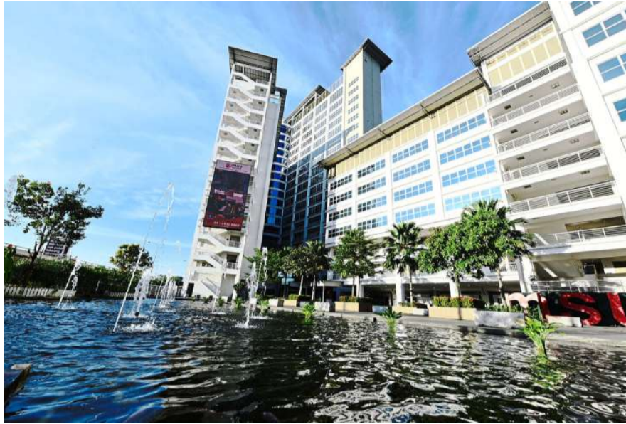
The MSU campus in Shah Alam.

The university's award-winning academic programmes meet stringent standards of local and