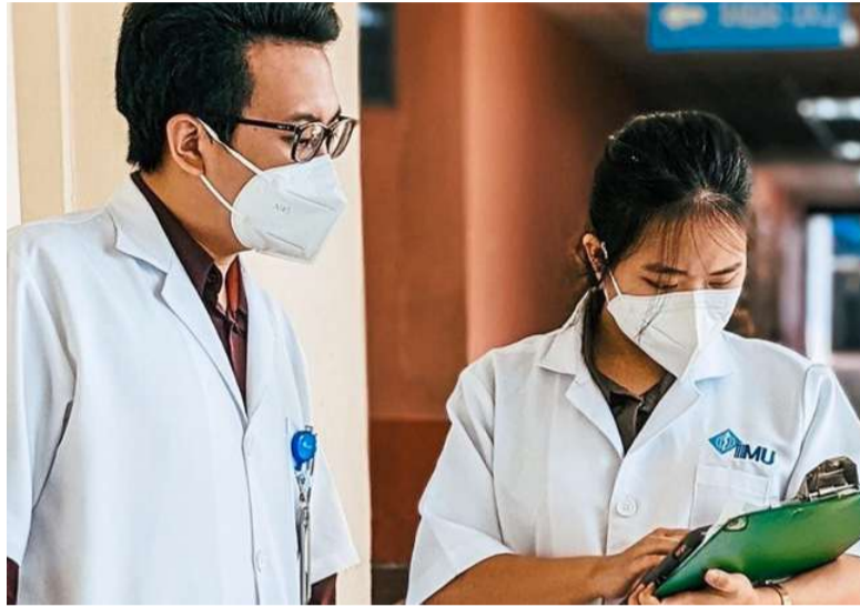
IMU pharmacy students get to experience working in a real hospital setting through mandatory placements.

During each rotation, students were given the chance to clerk