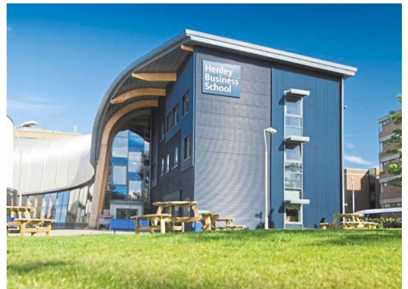
Henley Business School is one of the world's leading schools and institutions represented at the Malaysia campus.

Students also have access to excellent recreational facilities at EduCity which include an Olympic swimming pool, a