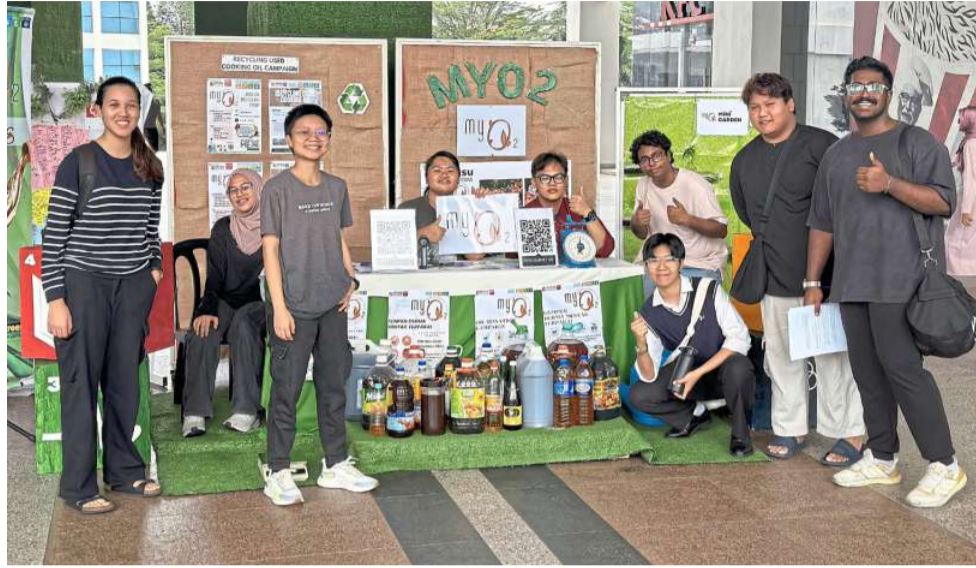
MSU students lead the way in promoting recycling and environmental stewardship through the MyO2 project.

In 2024, the MyO2 programme expanded its reach beyond the university, engaging local industries and residents. One such collaboration involved PPR Lembah Subang 2, in collaboration with the