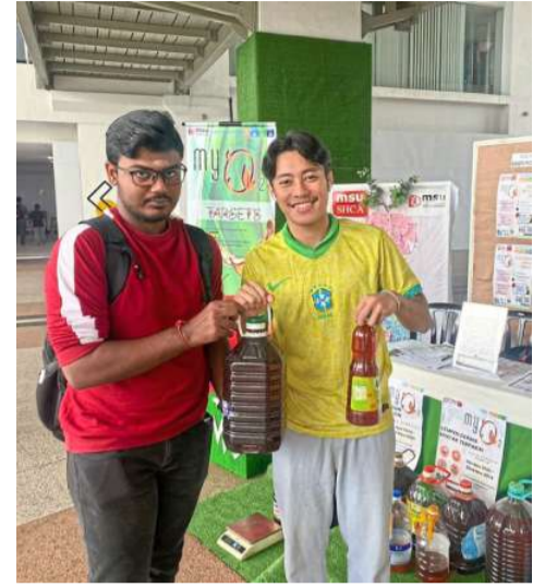
The MyO2 project transforms used cooking oil into a force for environmental good, funding tree-planting efforts in Malaysia.

tion in the Times Higher Education World Impact Rankings 2024 (ranked 301-400 globally) and the QS World University Rankings: Sustainability 2025.