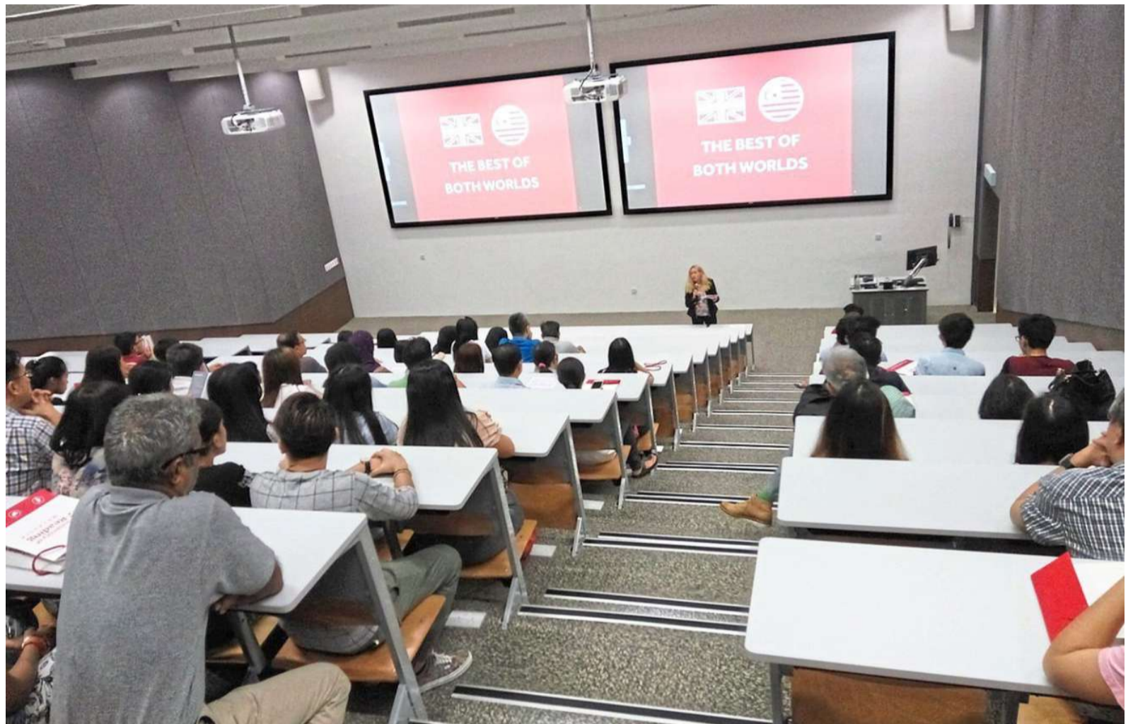
University of Reading students benefit from excellent facilities and a UK-based curriculum.

Graduates of the University of Reading have enjoyed excellent employability, with many secur-