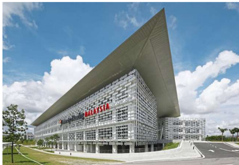
The University of Reading's state-of-the-art branch campus in EduCity, Iskandar Puteri in Johor, provides top-notch facilities and quality education for its students.

ing job offers prior to graduation. IGCSE, SPM and equivalent holders can join its 12-month International Foundation Programme as a pathway to their chosen undergraduate degree.