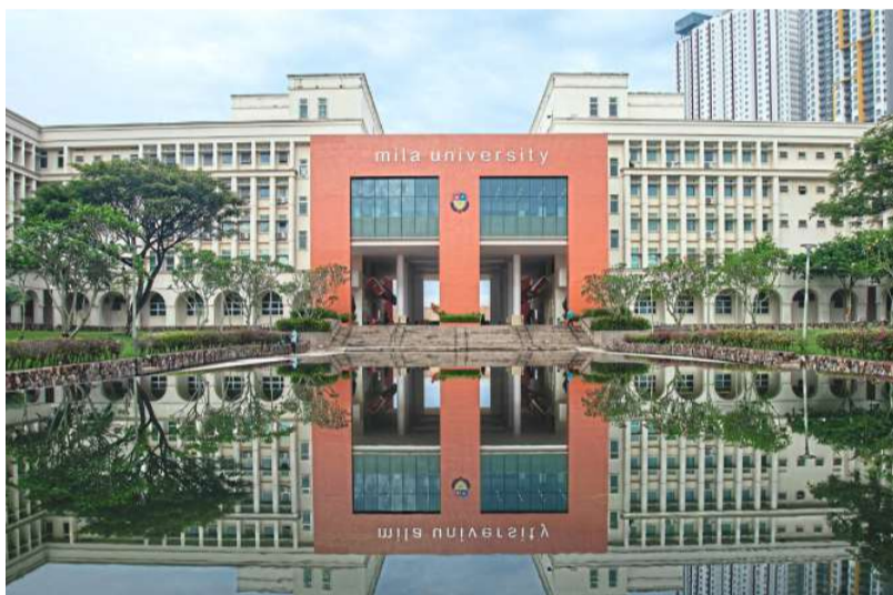
Located in Nilai, MILA University offers diverse academic programmes and an international atmosphere.

The school features nine unique learning spaces, each designed to