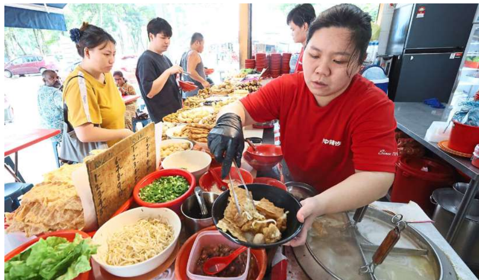
The popular Foon Yew Laksa stall serves piping hot curry noodles with more than 50 types of yong tau fu and other stuffed vegetables to choose from. They also amassed a large multi-racial following over the years since moving to Stulang Walk about a decade ago.