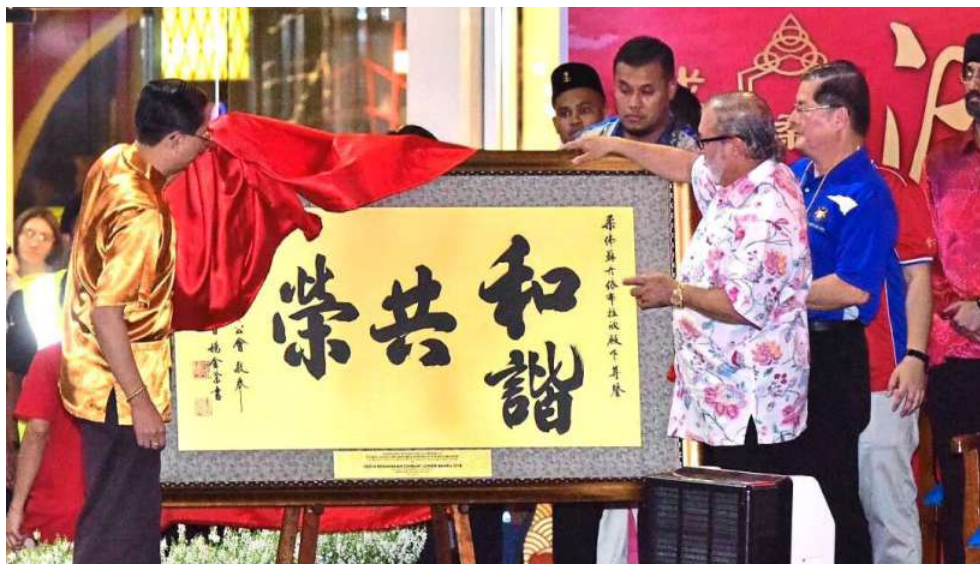
Sultan Ibrahim unveiling a Chinese calligraphy artwork that was presented to him as a gift during the Johor Chingay procession in 2018.