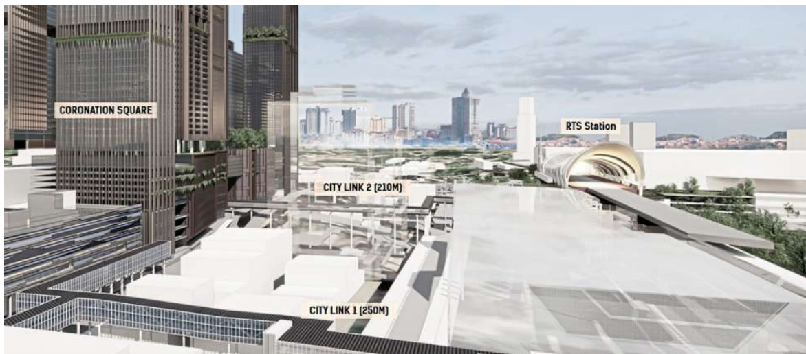
The Coronade Residences, which was launched in February last year, is 95% taken up.

"All these connections will form a loop and it makes us an ideal location for those wanting to commute between Johor Baru and Singapore," she said, adding that there has been a lot of interest in their projects especially with the recent announcement