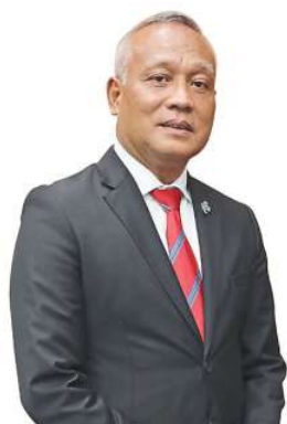
Pasir Gudang City Council (MBPG) mayor Datuk Asman Shah Abd Rahman.

"After three months, JBIOCC has provided 108 AI-equipped