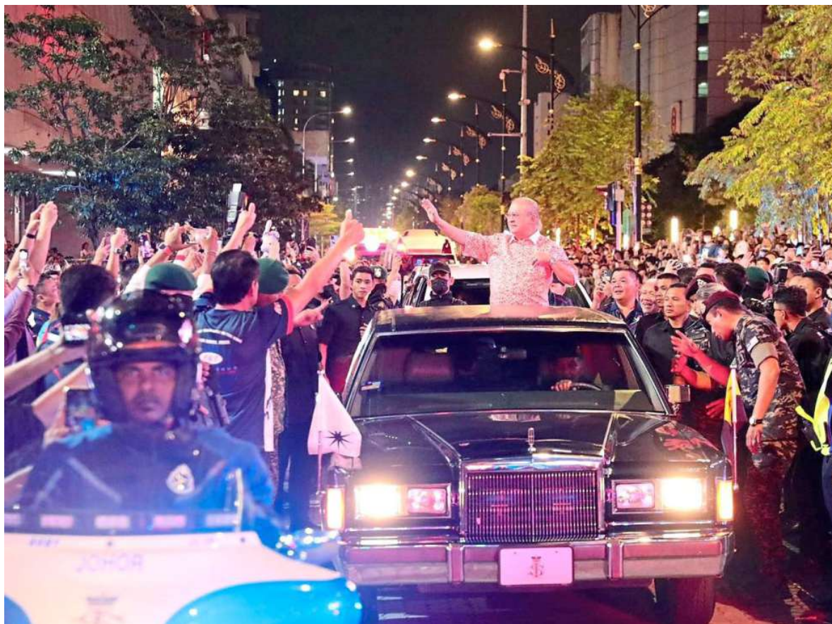
Sultan Ibrahim waving to the crowd during the Johor Chingay procession in Johor Baru held on Feb 11, 2023.

Sultan Ibrahim places emphasis on racial unity and wants representation from Malay, Chinese and Indian NGOs in the committee to provide feedback and input on the annual Kembara Mahkota Johor expedition.