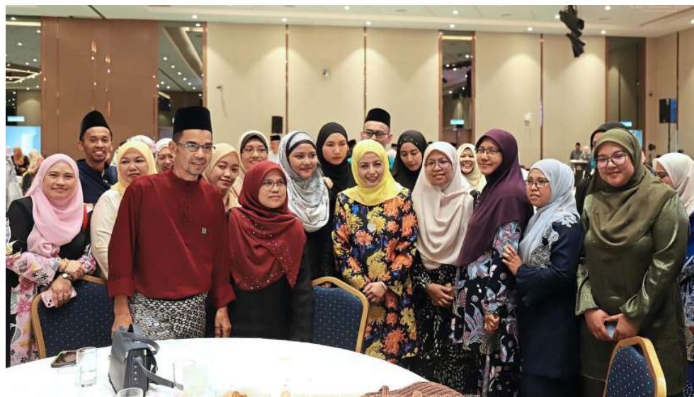
Permaisuri Johor Raja Zarith Sofiah (centre) taking photo with cancer survivors during the Hari Raya Aidilfitri celebration last year at Menara MBBJ, Johor Baru.