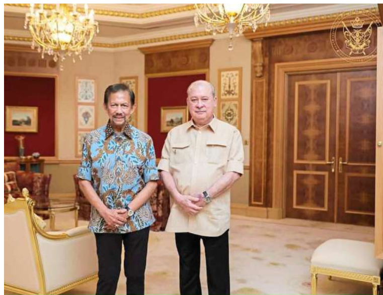
Sultan Ibrahim with Sultan of Brunei Sultan Hassanal Bolkiah during His Majesty's visit to Brunei Darussalam in late 2023.