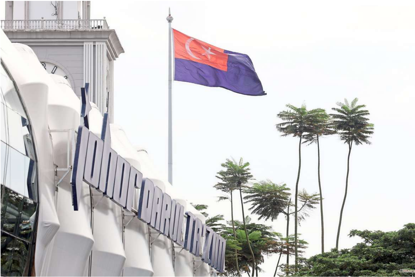
Johor’s state anthem ‘Lagu Bangsa Johor’ is memorised by heart by all Johoreans regardless of race.