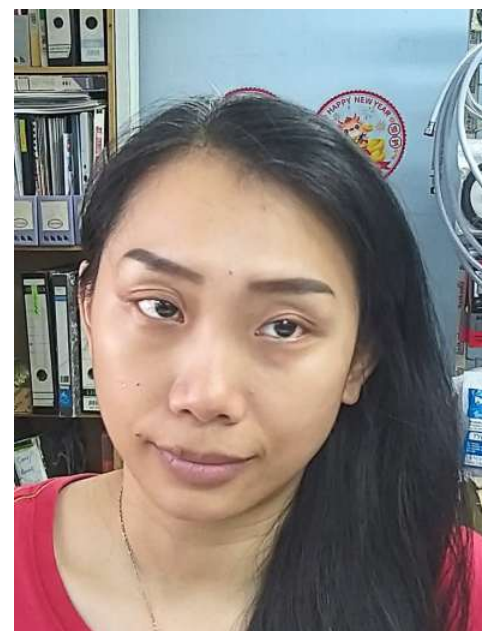
Chin wants to see Malaysia record a positive economic growth within the next five years and beyond.