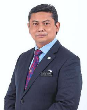
Iskandar Puteri City Council (MBIP) mayor Datuk Mohd Haffiz Ahmad.