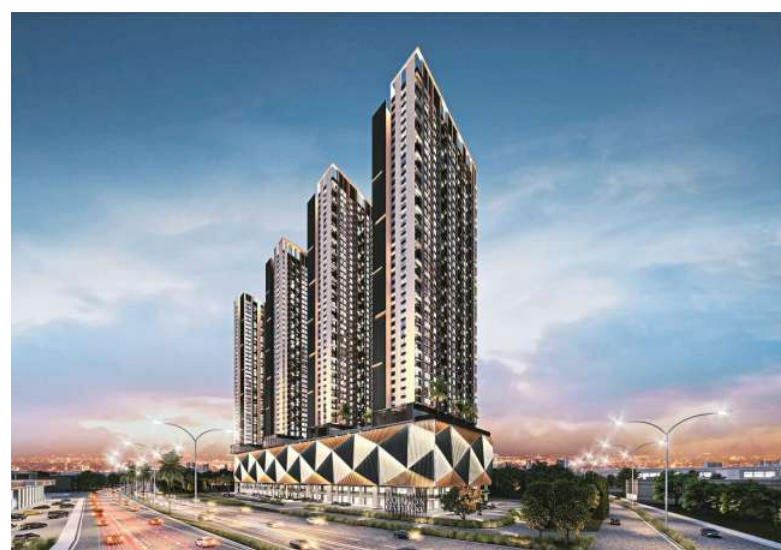
Paragon Gateway, a mixed development, is strategically located next to Tebrau Highway with an estimated gross development value of RM1.2bil.

As Joland Group and PGB expand their respective business portfolios and launch new projects, they remain committed to uphold its business principles and deliver homes and spaces with premier quality and livea-