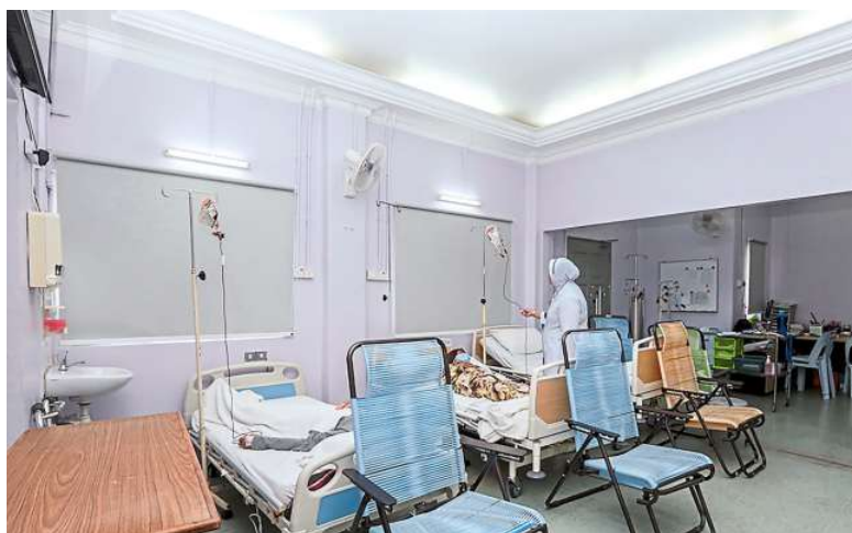
A nurse checking up on a patient at the Tunku Laksamana Johor Haematology Ward at Sultanah Aminah Hospital, Johor Baru.

"By comparison, we believed that the local awareness of cancer is still not up to par; other