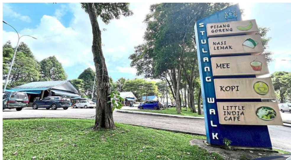
Located next to Istana Pasir Pelangi, Stulang Walk, has five concrete stalls, each with space for tables and chairs for customers to enjoy their food and drinks. Parking bays are also available. The stalls, managed and maintained by the Johor Baru City Council (MBJB), are operated by a mix of Malay, Chinese and Indian businesses.

"My dream is to serve Tuanku some of my dishes one day, it would be a big honour for me."