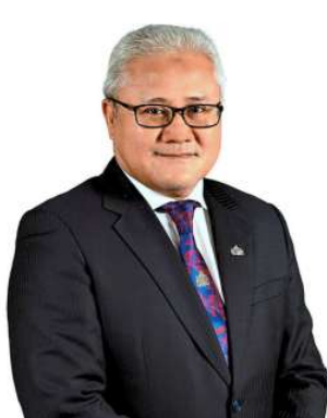
Johor Baru City Council (MBJB) mayor Datuk Mohd Noorazam Osman.