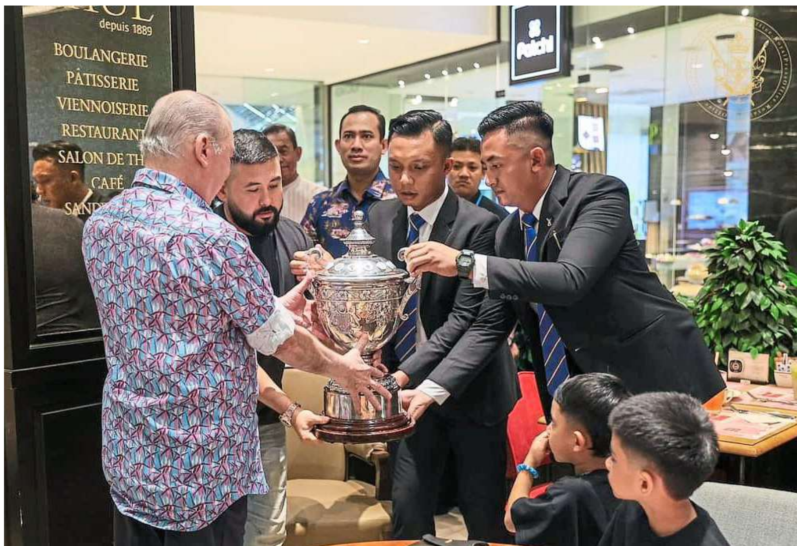
Johor Crown Prince Tunku Ismail Ibni Sultan Ibrahim (second from left) surprising Sultan Ibrahim with the Piala Malaysia trophy that was won by Johor Darul Ta'zim (JDT) football club, while His Majesty was having tea at a shopping mall in Kuala Lumpur in December 2023.

the fifth Ruler of modern Johor in March 2015, marking a historical moment as the last coronation in the state was held for his late grandfather, Almarhum Sultan Ismail Ibni Almarhum Sultan Sultan Ibrahim, in February 1960.