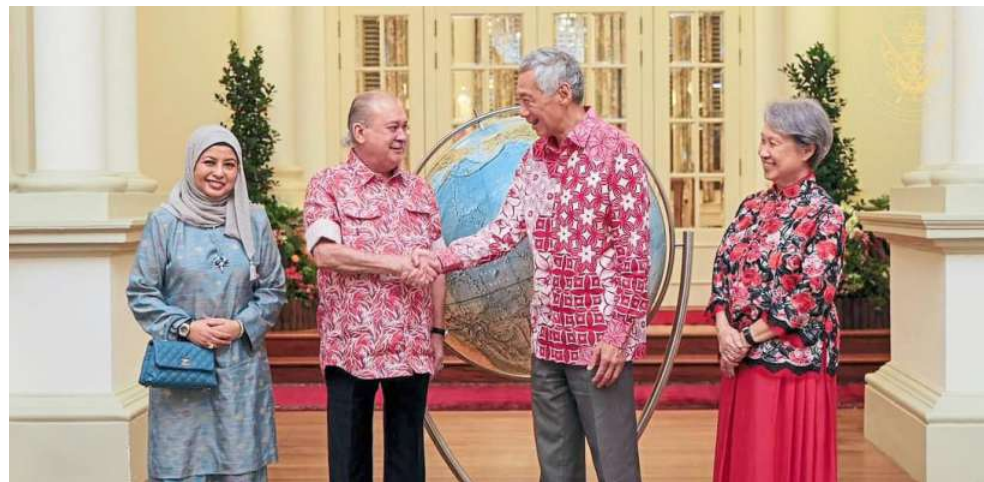
Sultan Ibrahim with Singapore Prime Minister Lee Hsien Loong at Istana Singapore during His Majesty's official visit in October 2023. With them are Permaisuri Johor Raja Zarith Sofiah Almarhum Sultan Idris Shah and Lee's wife Ho Ching.