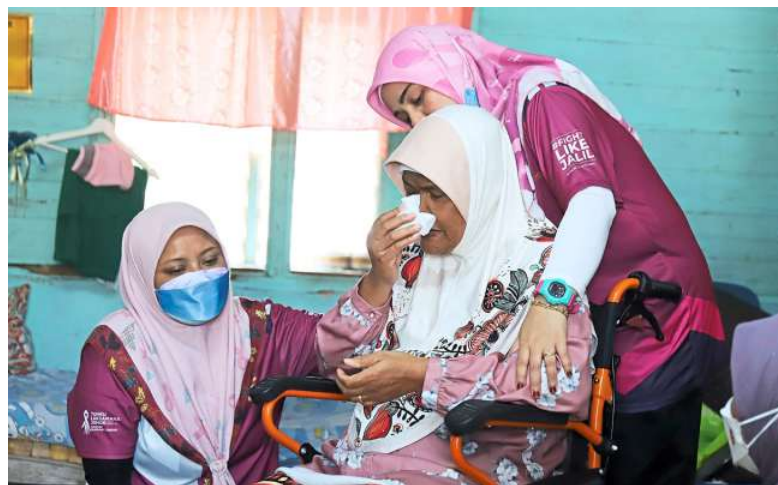
A Cancer Support Group under TLJCF giving moral support to a patient during one of their Home Visit programmes in Tangkak, Muar.