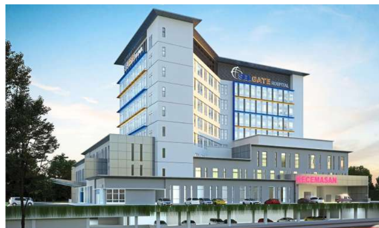
The 121-bed Selgate Sepang Hospital which started construction in 2021 is slated for completion by the end of 2024.

bility to its customers, investors and business partners.