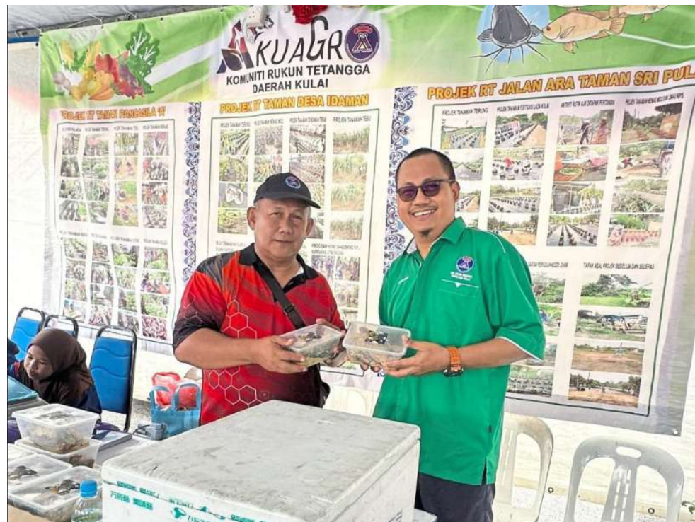
Jalan Meranti, Taman Sri Pulai Rukun Tetangga members proudly showing the fresh produce such as mushrooms and fish from their aquaponic project.