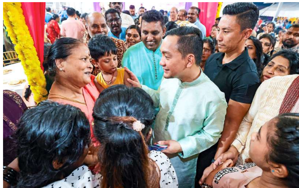
Datuk Onn Hafiz Ghazi mingling with the people at a Deepavali event in Johor.