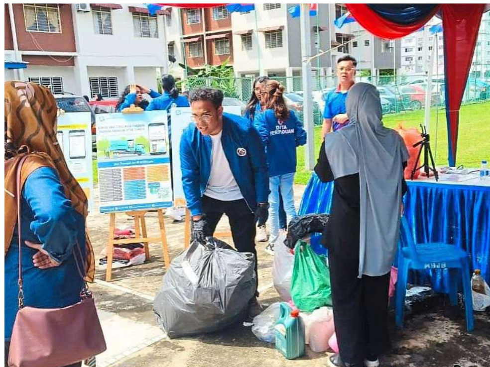
Johor unity ambassadors helping out during a recycling drive as part of their community engagement efforts to foster stronger ties among the people.

"Let's not break it by spreading hate or stirring sensitive issues, which will not only threaten our racial harmony but also the country and state's development and growth."