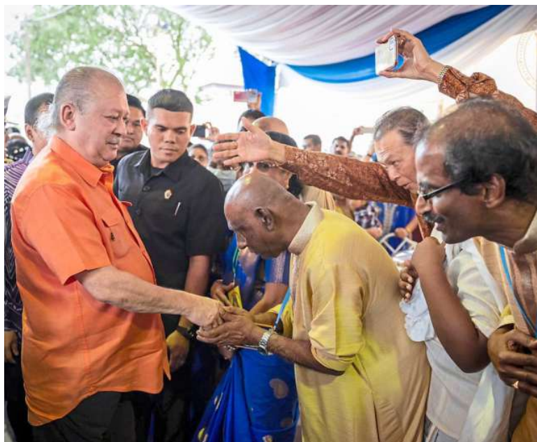
Sultan Ibrahim being welcomed by devotees at the state-level Thaipusam celebration at the Arulmigu Sri Balasubramaniar Temple in Skudai, Johor Baru on Feb 5, 2023.

On Sultan Ibrahim's interaction with his subjects, the Ruler is clearly happy with the Kembara Mahkota Johor pro-