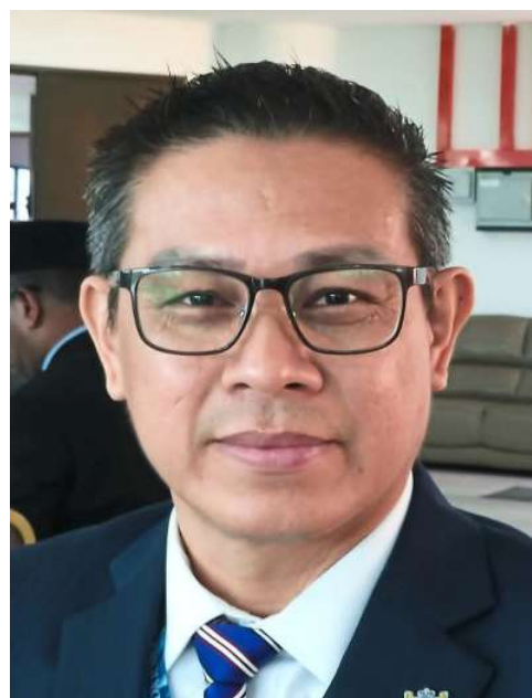
Chan said political stability would send strong signals especially to foreign investors and tourists to continue investing and visiting the country.