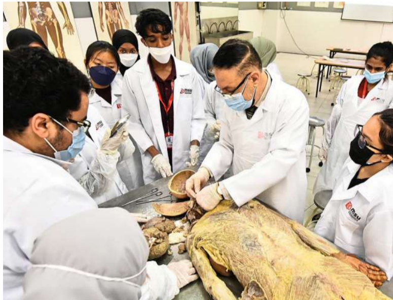
MSU students learn clinical skills to solidify their degree-level medical education in their final year.

Studying MBBS is exciting, but it also requires complete dedication and focus for a prolonged period as the Bachelor of Medicine and Bachelor of Surgery (MBBS) is a five-year programme. It's offered at MSU's main campus in Shah Alam and its offshore campus in Bangalore, India, which is Malaysia's first medical school to receive a five-year accreditation from the Malaysian Medical Council (MMC).