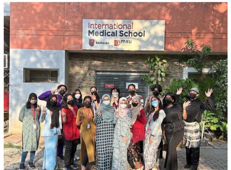
MSU's offshore medical school campus in Bangalore, India, provides MBBS students with the chance to experience an international setting.

Upon completing their MBBS degrees, the new doctors must register with the Public Services Department and undergo a two-year housemanship at selected