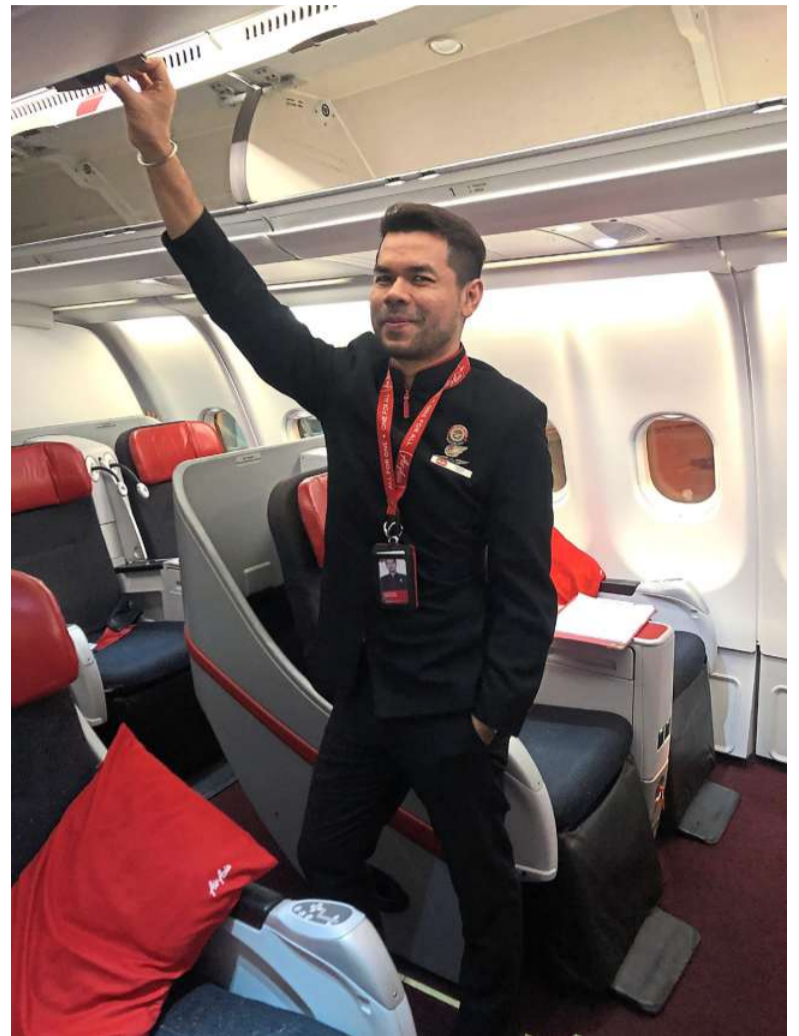
Azwan now has the unique status of being a purser at AirAsia X Bhd as well as a licensed counsellor.

■ For details on OUM’s programmes, call the speedline at 03-7801 2000, e-mail enquiries@oum.edu.my or visit www.oum.edu.my