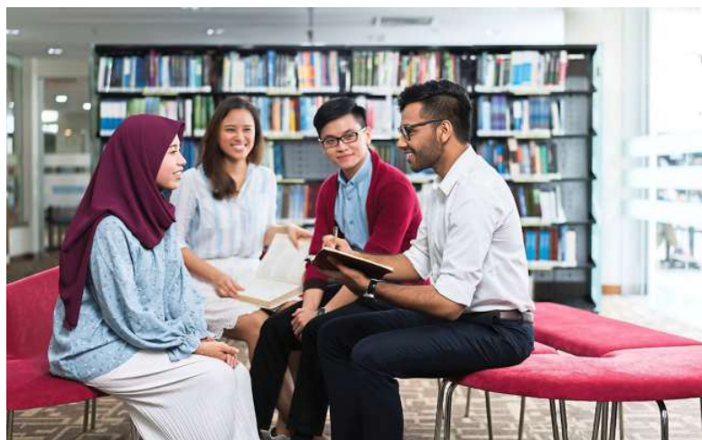
The Bachelor of Science (Hons) Psychology has been developed to meet high international standards.

Second was an exciting competition. In response to the coronavirus outbreak and global shutdown, IMU's Institute for Research, Development and Innovation (IRDI) invited creative problem-