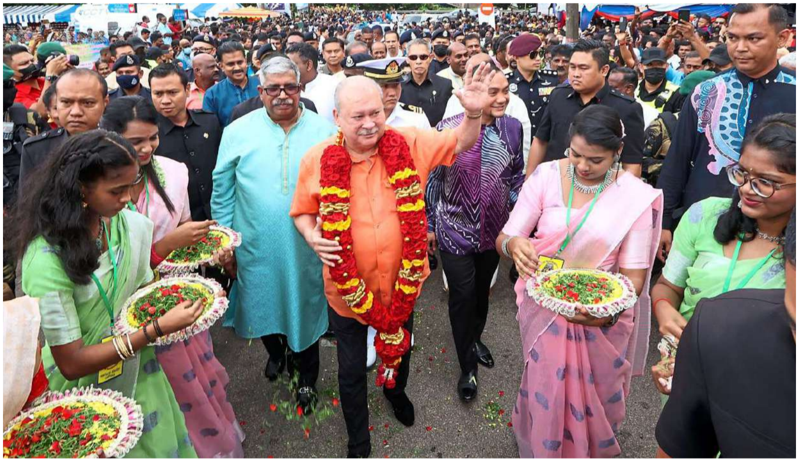
Sultan Ibrahim greeting people during the state-level Thaipusam celebration at the Arulmigu Sri Balasubramaniam temple in Skudai in February. Also present was Johor Menteri Besar Datuk Onn Hafiz Ghazi.

Those who meet Sultan Ibrahim for the first time might see the Ruler as a strict or stern person. However, the Ruler is actually warm-hearted with an amiable