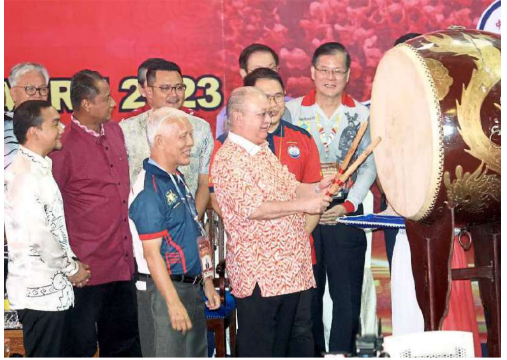
Sultan Ibrahim officiating the 2023 Chingay Festival in Johor Baru in February.