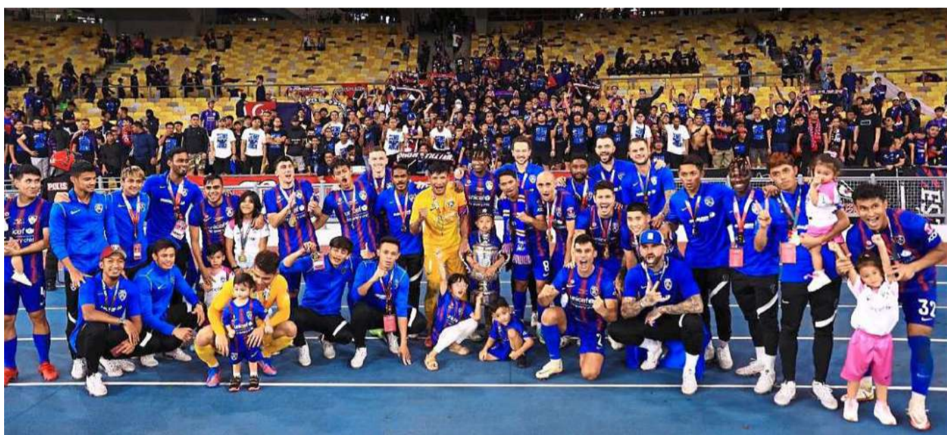
JDT football players celebrating their FA Cup victory at the Bukit Jalil National Stadium last year. The Southern Tigers clinched every major honour during the Malaysian football season in 2022.