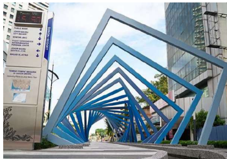
The rejuvenated Sungai Segget in downtown Johor Baru city.

as the Johor Baru-Singapore Rapid Transit System Link (RTS Link), Gemas-Johor Baru Electrified Double-Tracking Project, Iskandar Rapid Transit and EDL-Tebrau Highway upgrading project.