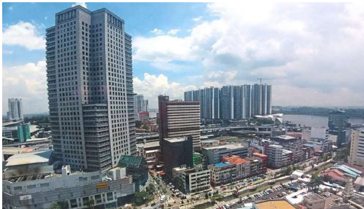
Johor Baru's close proximity with Singapore is an added advantage to attract foreign direct investments to Johor due to the republic's position as an international trade and financial centre.