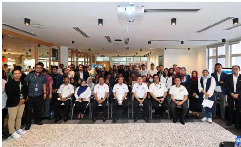
IIB organises initiatives to facilitate the growth of digital start-up players in Medini with the state government.

"Thus, it is vital to focus on building the ecosystem to ensure the companies situated in Medini are well-taken care of and facilitate their expansion so they will keep growing and flourishing," he said.