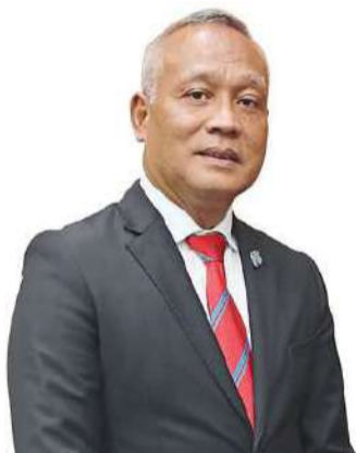
Pasir Gudang City Council (MBPG) mayor Datuk Asman Shah Abd Rahman