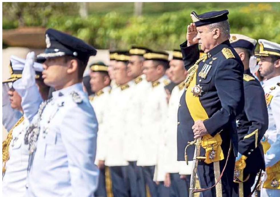
The Johor Ruler decreed during the opening of the second term of the 15th Johor state assembly sitting that all mosques and surau that want to hold any religious talks must first obtain permission from the Johor Islamic Religious Council.