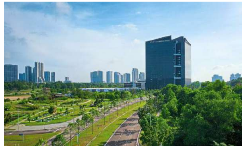
IIB making Medini a home for the innovation and technology community to thrive.

"Medini is a good place for start-ups to come, collaborate and reposition due to the support and sur-