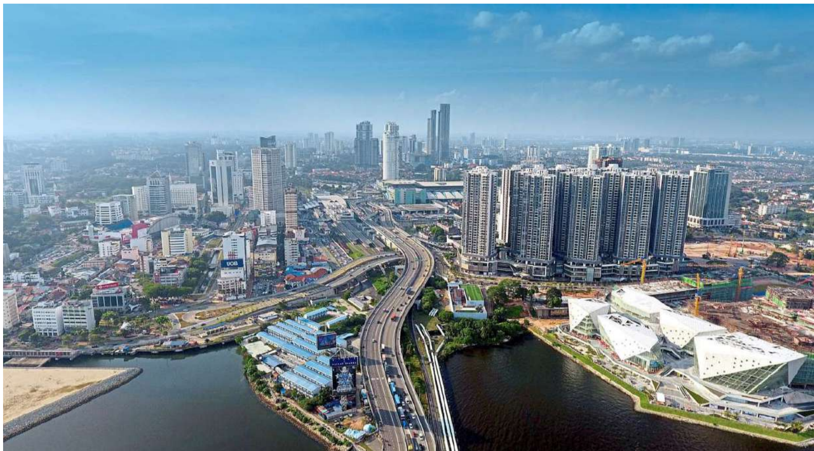
The Greater JB agenda is also in line with the Maju Johor 2030 agenda, which aims to turn Johor into a developed state by 2030.

The end goal is to create a Johor Baru that is investor-friendly and a