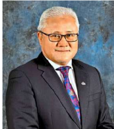
Johor Baru City Council (MBJB) mayor Datuk Mohd Noorazam Osman