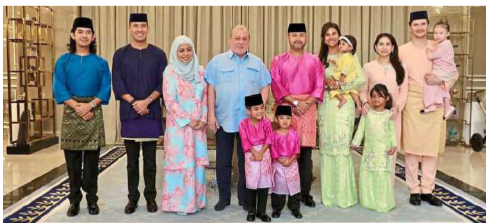
Sultan Ibrahim and Raja Zarith Sofiah with the rest of the Johor royal family during a Hari Raya Aidiladha celebration in July last year.

His Majesty received his formal education at Sekolah Temenggong Abdul Rahman (1) before leaving for Trinity Grammar School in Australia. Later on, His Majesty travelled to the United States to pursue his studies in law and diplomacy.