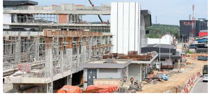
The construction of the Gemas-Johor Baru Electrified Double-Tracking Project in Kulai, Johor, which is expected to be completed by mid-2023.

or construction of new infrastructures and utilities to meet the impending needs, he added.