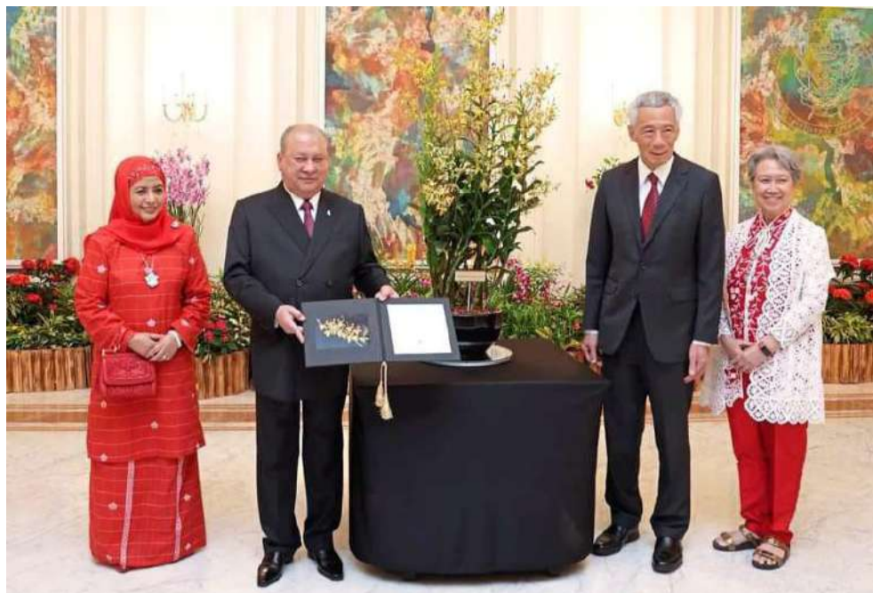
Sultan Ibrahim and Raja Zarith Sofiah with Singapore Prime Minister Lee Hsien Loong and his wife Ho Ching during their majesties' visit to the island republic in July last year. The Singapore Botanic Gardens presented a special orchid species named after the royal couple – Ibrahim Zarith – in honour of the visit.