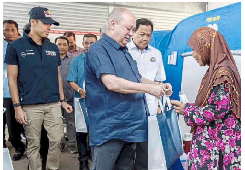
The Johor Ruler distributing aid to flood victims at a temporary relief centre with Tunku Panglima Johor Tunku Abdul Rahman (left).

The concept was initiated by his great-grandfather, Almarhum Sultan Sir Ibrahim Ibni Almarhum Sultan Abu Bakar, in 1920 to unite the various races in Johor as one cohesive and united people with a strong sense of solidarity, harmony and peace.