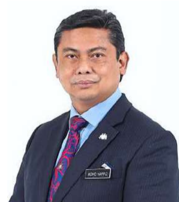
Iskandar Puteri City Council (MBIP) mayor Datuk Mohd Haffiz Ahmad

liveable city that has uniformity on all levels of management, he said.