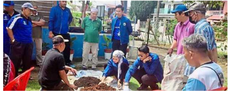
Johor Unity Ambassadors are given the freedom and allocation to hold community programmes of their choice such as this agricultural programme conducted with the Taman Kota Jaya A Kawasan Rukun Tetangga in Kota Tinggi.

"Sultan Ibrahim also set a good example when he attended the state-level Thaipusam luncheon and Chingay procession to show that Muslims can attend such functions, they just cannot participate