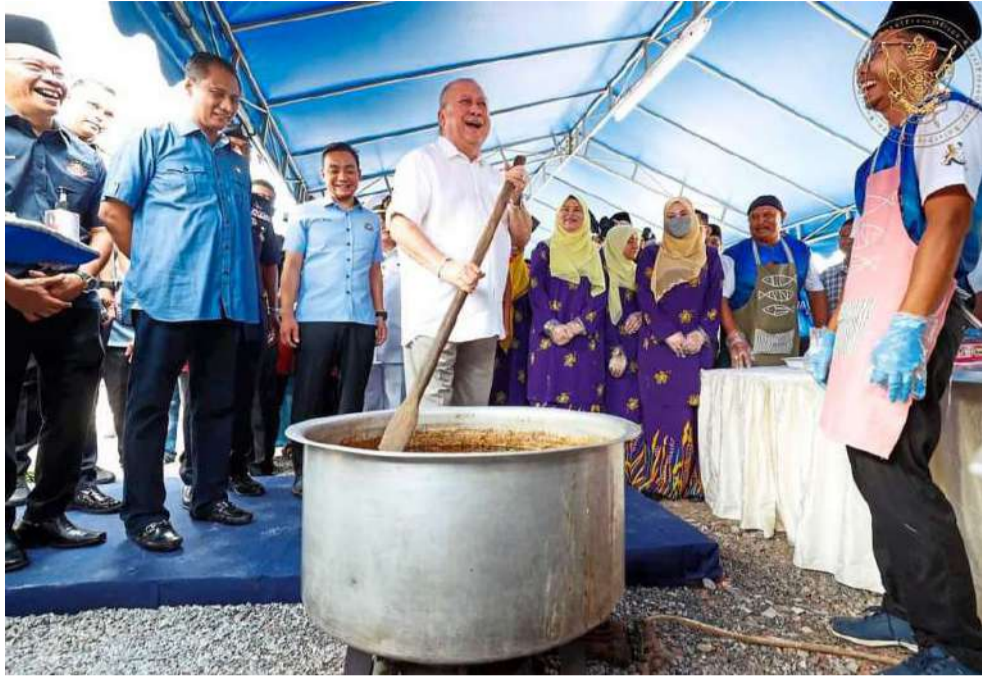
Sultan Ibrahim cooking mutton briyani for the local community during his visit to Sungai Balang in Muar, in August last year, where he was briefed on the use of new technology for padi planting.