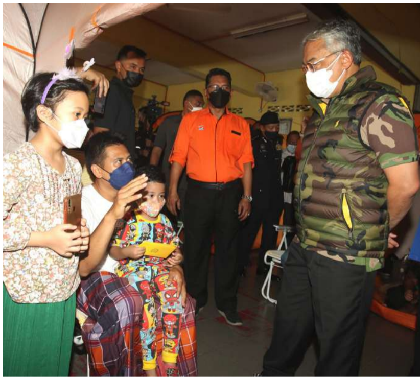
The King visiting landslide victims at a temporary evacuation centre in Palimbayan Indah, Kampung Sungai Penchala, in December 2021.