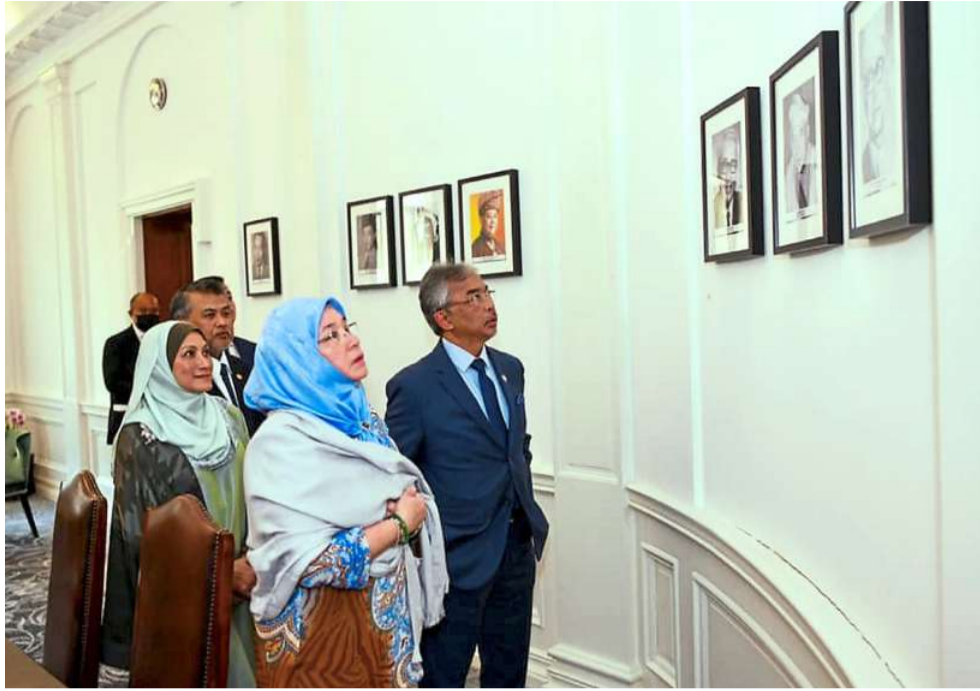
Their Majesties visiting the Malaysian High Commission in London.