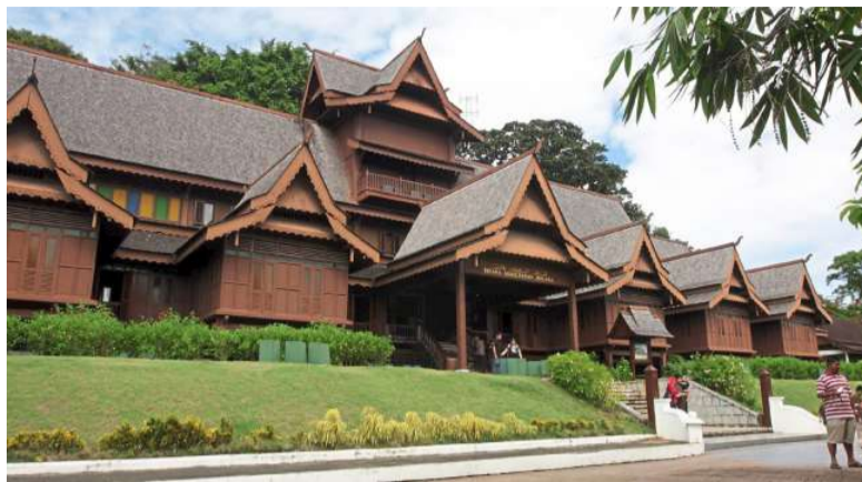
A view of the Istana Raja Melaka. The Melaka Sultanate played a role in establishing and strengthening many of the present sultanates.

They had filled the void left by the Melaka Sultanate after it fell to the Portuguese and continued the Melaka Sultanate's legacy.