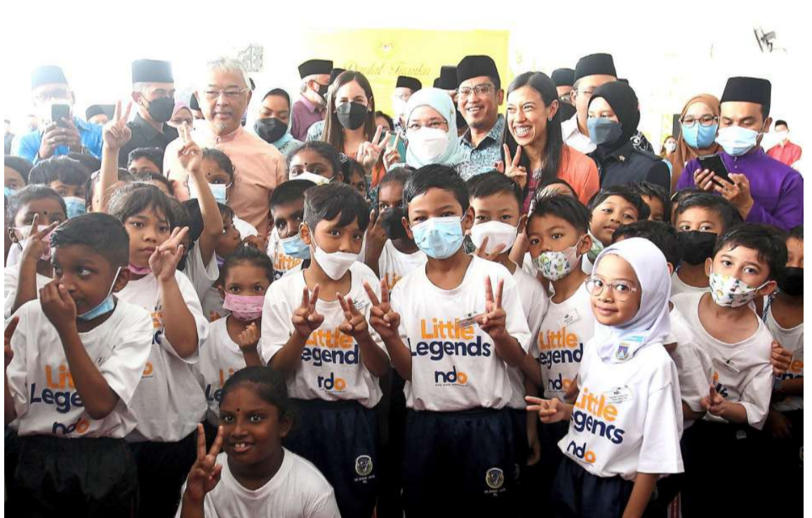
Sultan Abdullah and Tunku Azizah gracing the launch of the Nicol David Organisation in Bukit Jalil recently. Present were national athlete Nicol David and Youth and Sports Minister Datuk Seri Ahmad Faizal Azumu.