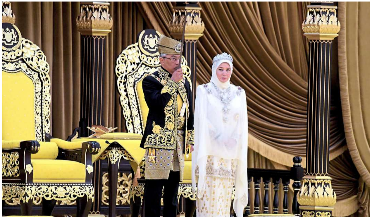
Sultan Abdullah with the Keris Panjang Diraja, which symbolises the power source and centralisation of power entrusted to the Yang di-Pertuan Agong, during his installation ceremony at Istana Negara in July 2019. By His Majesty’s side is Raja Permaisuri Agong Tunku Hajah Azizah Aminah Maimunah Iskandariah.