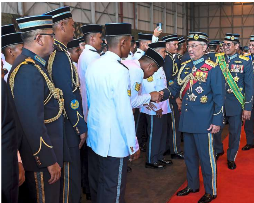
The King greeting Royal Malaysian Air Force officers during RMAF's 64th anniversary celebration at the Subang Air Base recently.