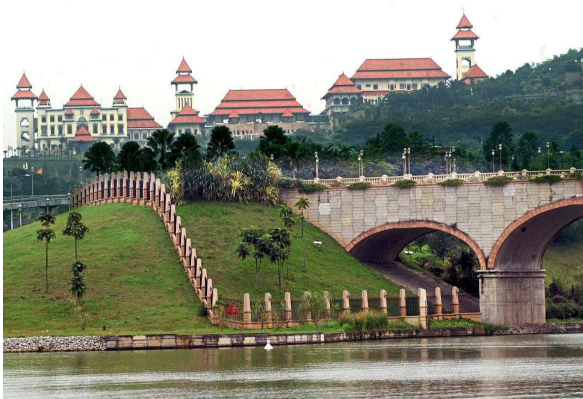
If this view seems like something out of a postcard, it exists in reality in the form of the King’s retreat palace, Istana Melawati in Putrajaya.

It is also equipped with a royal swimming pool, a royal kitchen as well as a royal guest house.