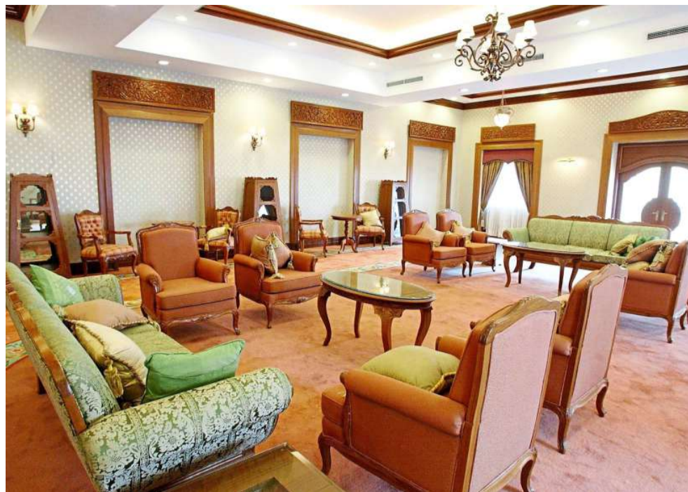
One of the stately audience rooms within the palace.