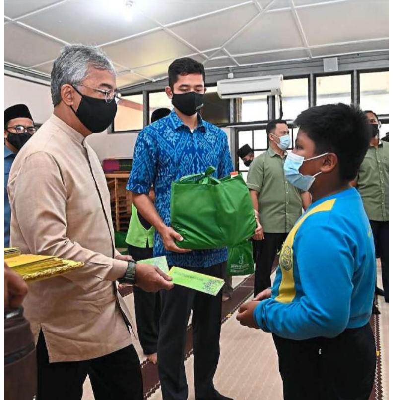
The King presenting a donation to an underprivileged child during a programme at Masjid Kampung Kuala Penor in Kuantan in June last year.

Muar MP Syed Saddiq Syed Abdul Rahman said he was grateful to be able to serve under the King, who has steered Malaysia out of many crisis zones.