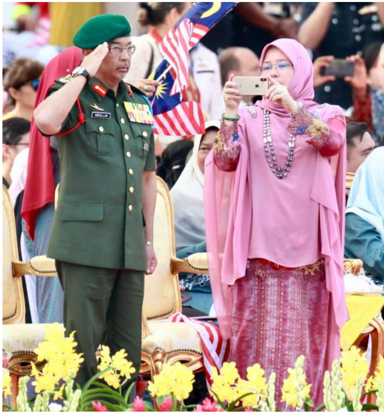
Sultan Abdullah and Tunku Azizah attending the 62nd National Day parade in Putrajaya in 2019.