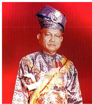
Tuanku Abdul Rahman ibni Almarhum Tuanku Muhammad from Negeri Sembilan, who ascended to the throne in 1933, was appointed as the first Yang di-Pertuan Agong.

sion was Sultan Sir Abu Bakar Ri'ayatuddin Al-Muadzam Shah Almarhum Sultan Abdullah Al-Mutassim Billah Shah of Pahang who ruled in 1932, but he failed to get a sufficient number of votes from fellow Rulers to be appointed as the Yang di-Pertuan Agong.