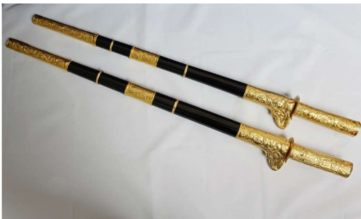
The Pedang Diraja (Royal Sword) and Sundang Diraja (Royal Sword – Keris) also form part of the royal regalia.

The blade is forged from steel taken from 11 keris from all 11 states and the hilt is shaped like a horse's hoof.