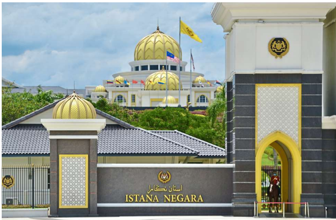
The Istana Negara in Jalan Duta, Kuala Lumpur, is the centrepiece of the country's constitutional monarchy.

Distinctively standing out with two large gold domes, the palace has a total of 22 domes which resemble an arrangement of sireh