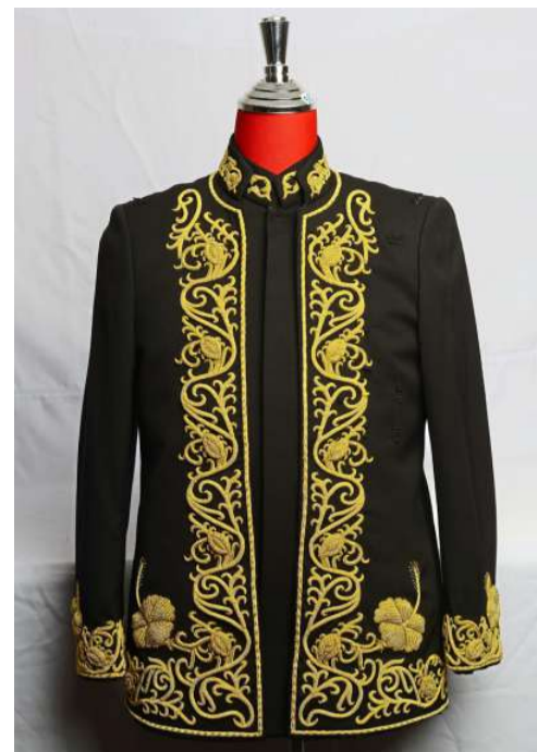
(From left) The Tengkolok Diraja (Royal Headdress), the Gendik Diraja (Royal Tiara) and the Muskat worn by the Yang di-Pertuan Agong on special occasions.