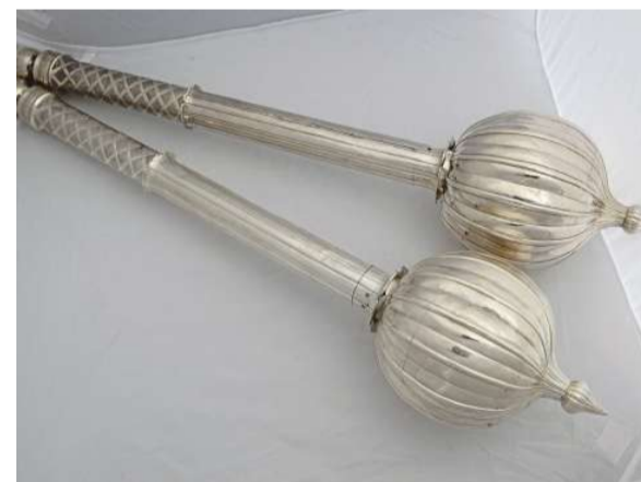
The Cokmar comprises two maces, each with a circular-fluted orb made of silver.

It features decorations similar to the jering fruit.