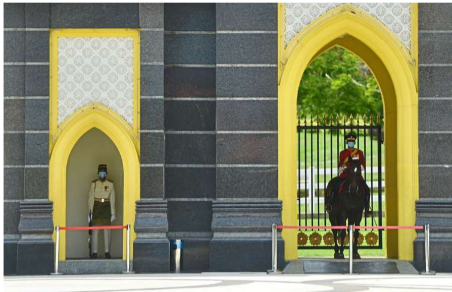
(Top) Police officers stationed at the front gate of Istana Negara. (Left) Guards on duty outside the palace.