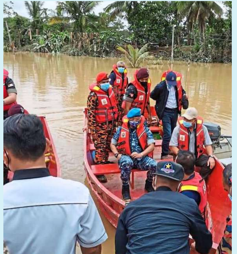
Sultan Abdullah visited flood victims in the flood-affected district of Lipis.