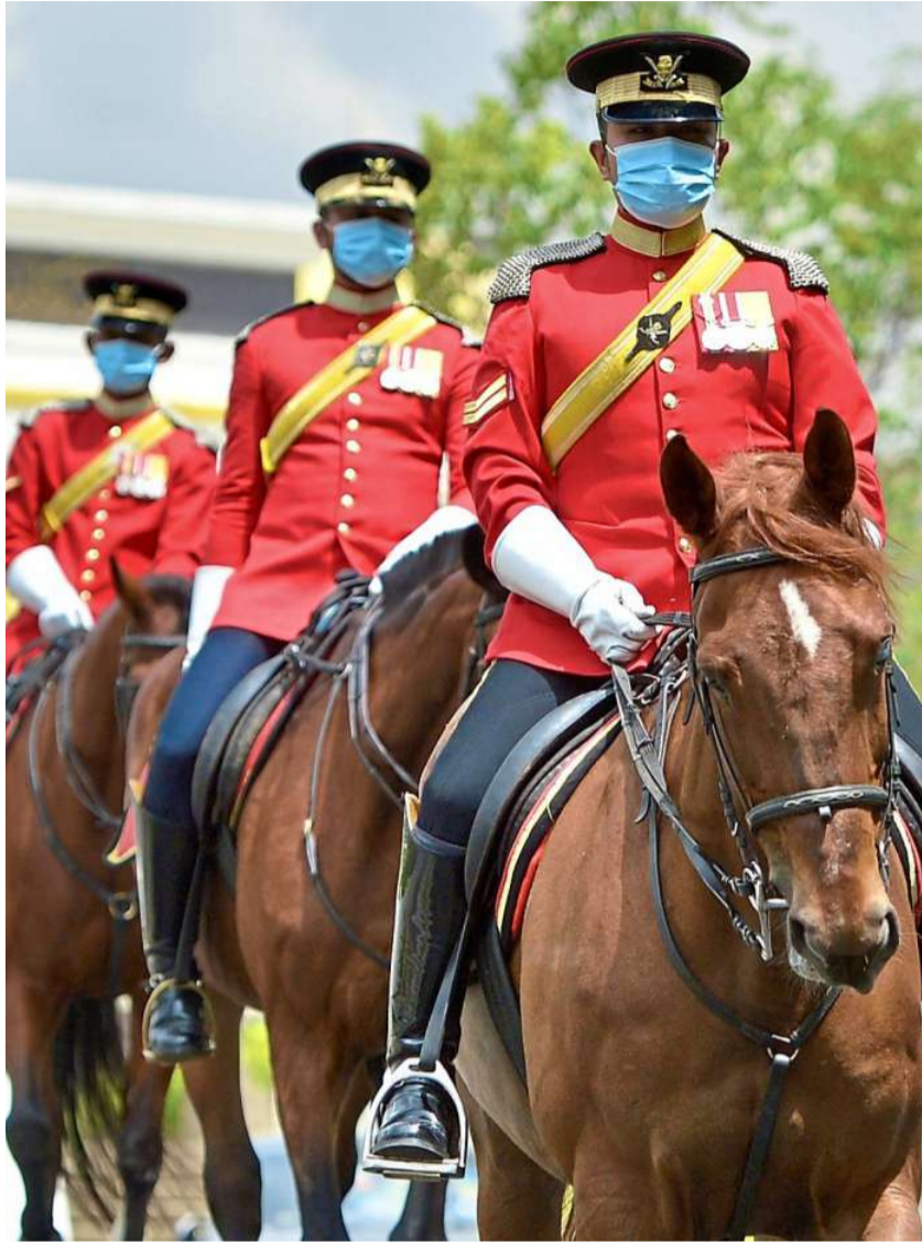
Mounted royal guards returning to base at the end of their shift at the palace grounds.