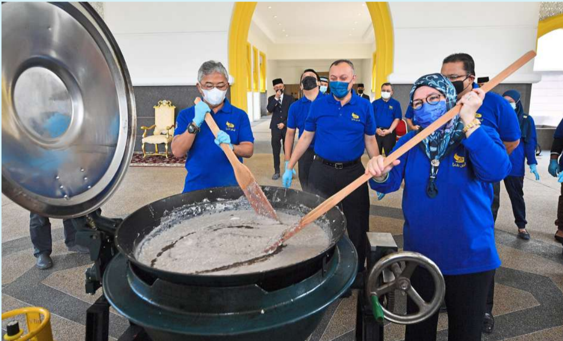
Sultan Abdullah and Tunku Azizah helping to cook bubur lambuk during a programme organised by the Istana Negara Sports and Welfare Club at Istana Negara, Kuala Lumpur.