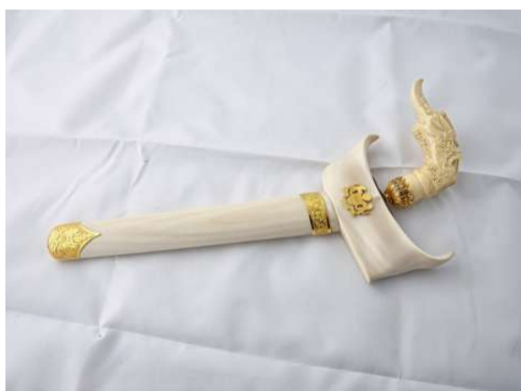
The Keris Pendek Diraja is made of steel from old daggers, with a hilt shaped like the garuda bird's head.