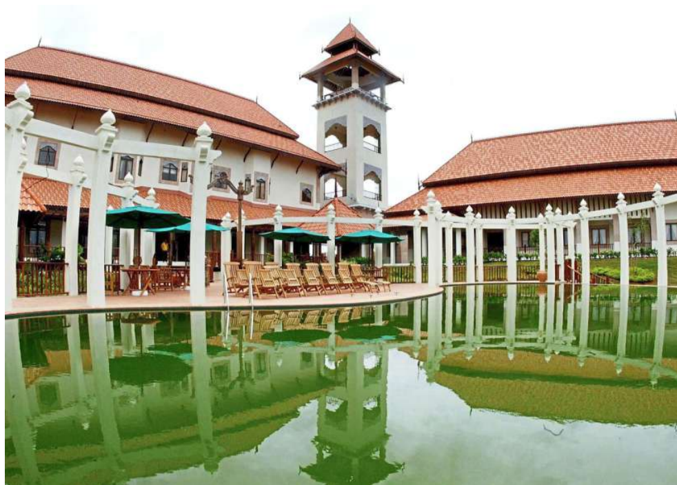
A turret at the palace casting its shadow over the pool area.