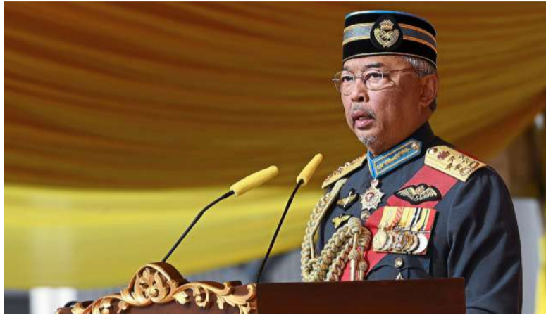
As the Yang di-Pertuan Agong, Sultan Abdullah is the ceremonial supreme commander of the armed forces.

In relation to the judiciary, though institutionally separate from