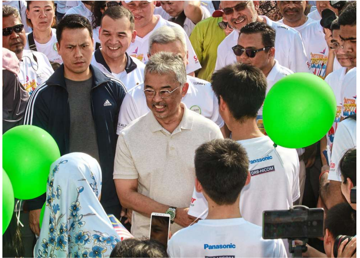
People greeting Sultan Abdullah at the Anak-Anak Malaysia Walk to celebrate National and Malaysia Day organised by Star Media Group and EcoWorld in 2019.

Sultan Abdullah was installed as the 16th Yang di-Pertuan Agong in a ceremony at Istana Negara on July 30, 2019.