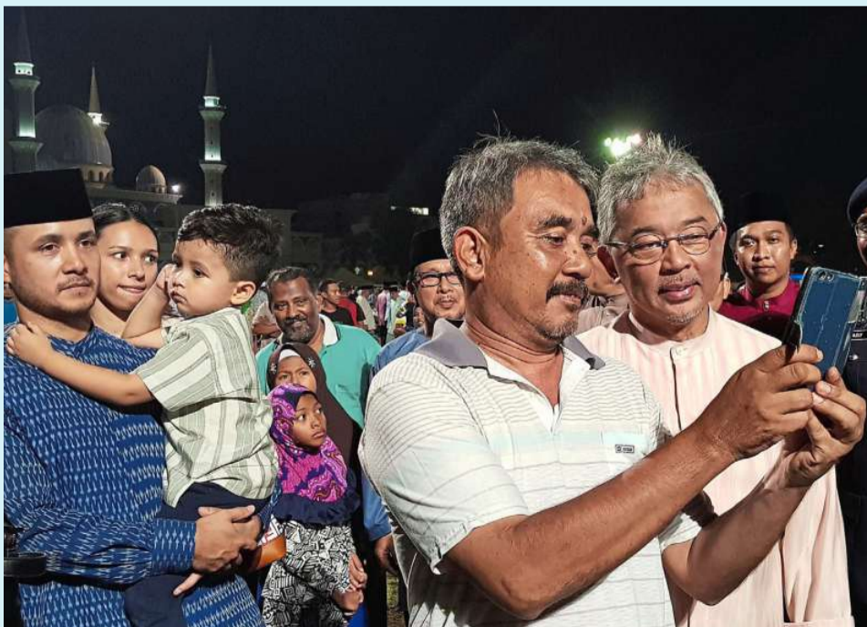
The King with an old friend after a breaking of fast event in Kuantan, in May 2019.