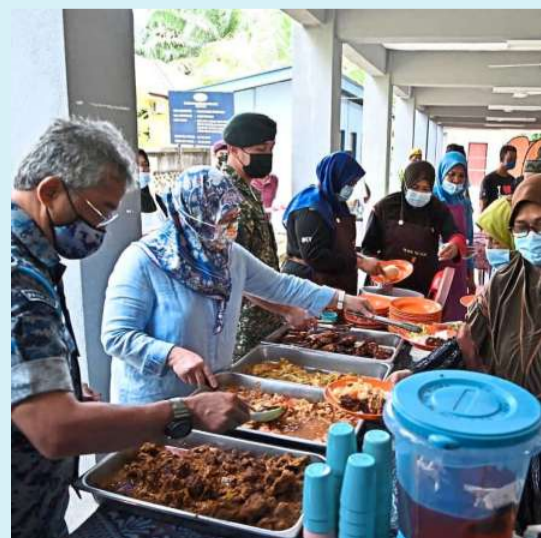
Sultan Abdullah and Tunku Azizah serving food to flood victims at a relief centre in Pekan.