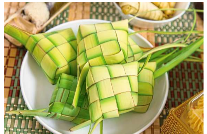
Expect a good mix of classic culinary favourites and new dishes that capture the essence of Malaysian cuisine.

Priced at RM99 nett for two, this traditional set invites guests to share a meal in a style that reflects the true spirit of togetherness, while relishing the flavours that have defined Malaysian cuisine for generations.