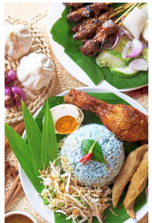
Nasi Kerabu is among the 150 dishes featured in the Sheraton Imperial buffet.

■ For more information and to make a reservation, contact Sheraton Imperial Kuala Lumpur Hotel at 03-2717 9977.