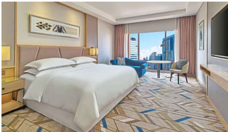
The Sheraton Ramadan Bliss package offers a cosy stay, a delightful breakfast or sahur for two, and an indulgent feast at the Citarasa Orang Kita Ramadan Buffet for two adults.

Ramadan is a time for reflection, gratitude and connection. At Sheraton Imperial Kuala