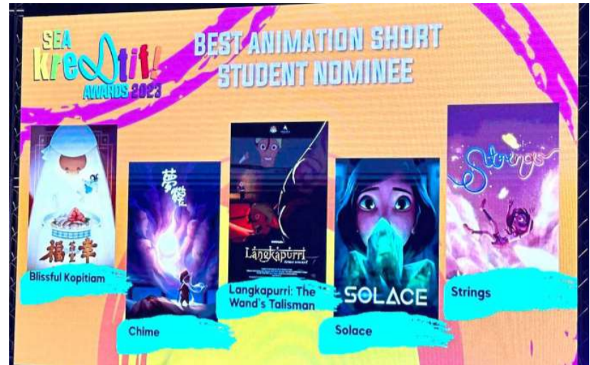
The top five winners of the 'Best Animation Shorts - Student' category at the SEA Kre8tif! Awards.

ANIMATION is a portal that transports an audience into a different realm where unique characters, storytelling and environments come to life. What people witness on the big screen takes an entire village of creative professionals to create. These multi-talented individuals are the reason behind impactful character personalities, expressions, costumes as well as environment design, lighting and colour grading. Animated movies have resonated and touched the hearts of people around the world in a way that writing and live-action films cannot.