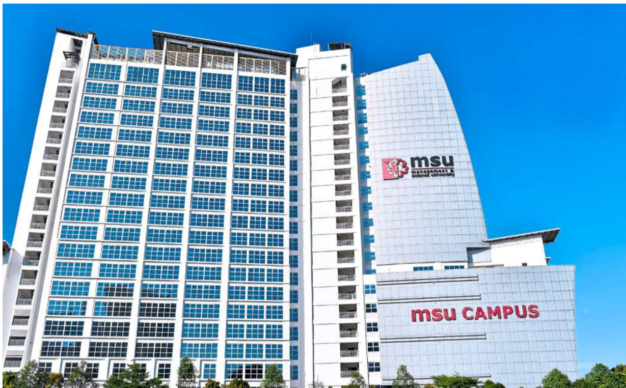
The QS World University Rankings by Subject 2025 features five subjects offered at MSU, highlighting strong prospects for students across its faculties.

In all, as an applied, enterprise, holistic and international university, MSU offers foundation, undergraduate, postgraduate and flexible programmes through an entry system that facilitates the admission of students from all walks of life, sticking to its tagline, “Transforming Lives, Enriching Futures”.