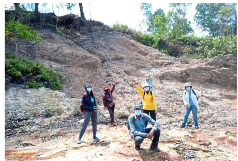
Curtin Malaysia geology students on a field trip to Bakam.