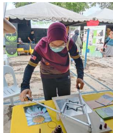
Minda Sihat marked a fun and fulfilling community engagement project for the students.

The programme is also accepted internationally for further specialisation at the graduate level. To