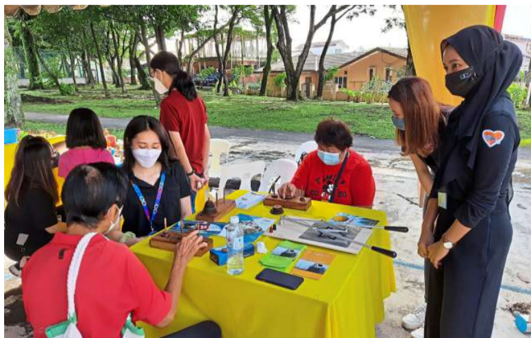
IMU Psychology students taking part in the Minda Sihat programme.