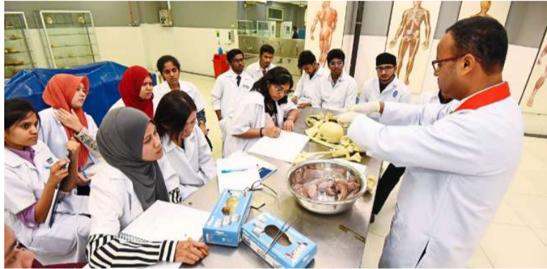
In the first two years, MSU MBBS students learn basic medical sciences.

Its involvement in the medical and health sciences areas has led to the initiative towards complementing the nation's need for