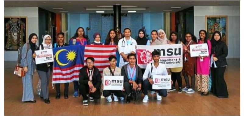
MSU MBBS students at MS Ramaiah Memorial Hospital in Bangalore.

A key feature of the programme is its emphasis on clinical communication skills. Clinical contact is established early on through