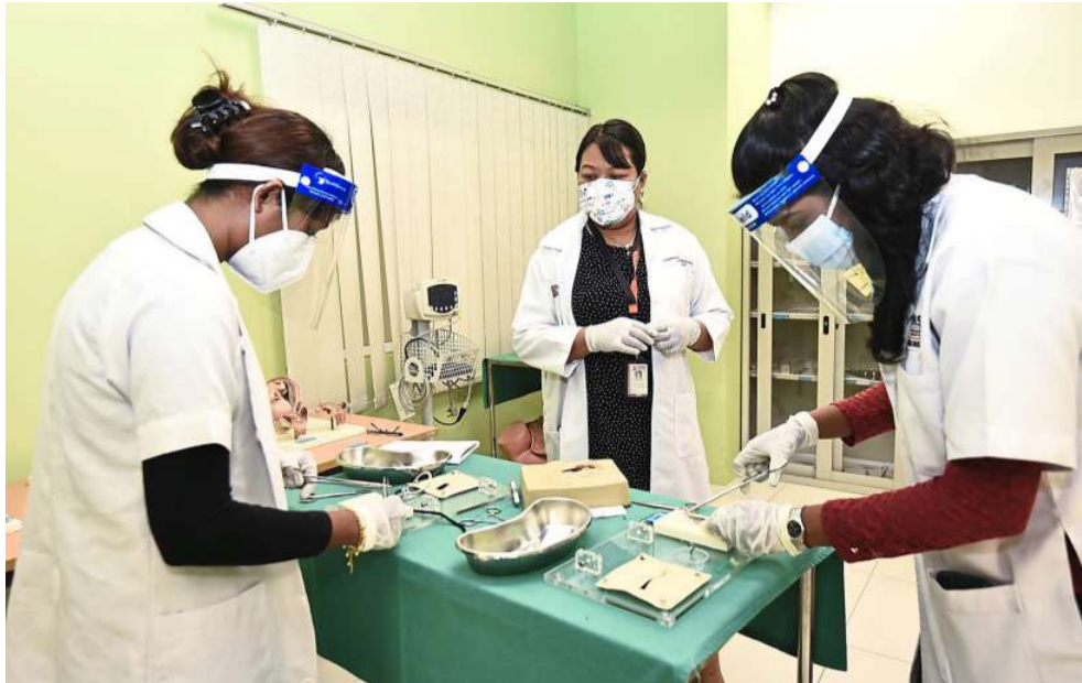
MSU focuses on producing a qualified medical doctor who not only excels academically but portrays commendable soft skills.