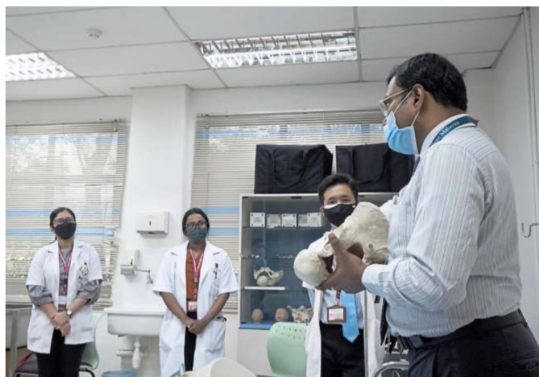
A professor demonstrating a procedure to students during an Obstetrics and Gynaecology class.

This is for the doctors who are constantly intrigued by how things start and how things can be