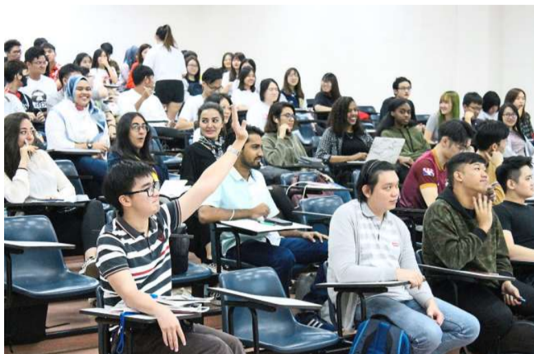
First City UC Students learn in well-equipped lecture theatres during their classes.

Upon completion, students can look forward to a smooth transition to any one of the degree programmes offered by the faculty in the areas of Business Management, Marketing, Accounting and Finance, Hospitality Management, Mass Communication and even Business Information Systems.