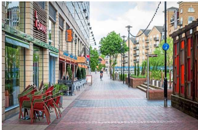
Reading is a bustling town that has plenty of amenities and is only 30 minutes by train from London.

STUDYING overseas is a dream for many Malaysian students, but the financial costs of doing so are considerable.