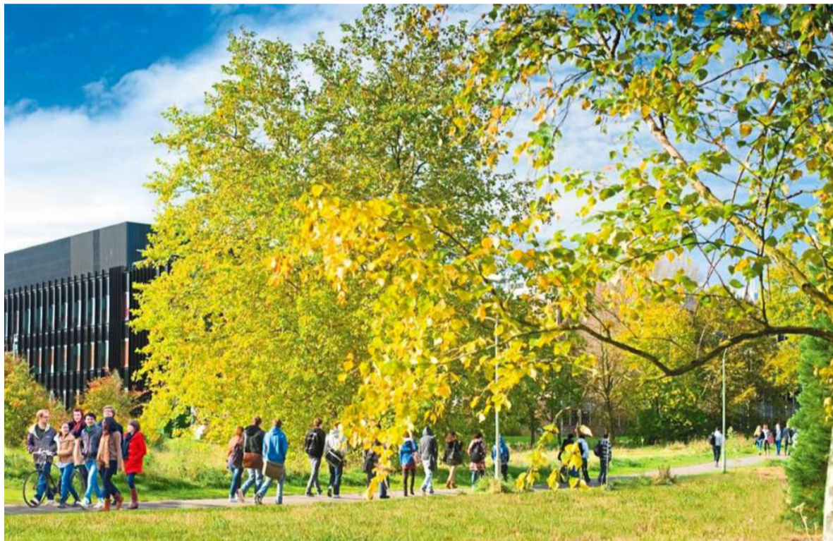
The sprawling 130ha (321-acre) campus looks fabulous every season of the year.

It is generally recommended that students complete Year One at the Malaysia campus and, if they so