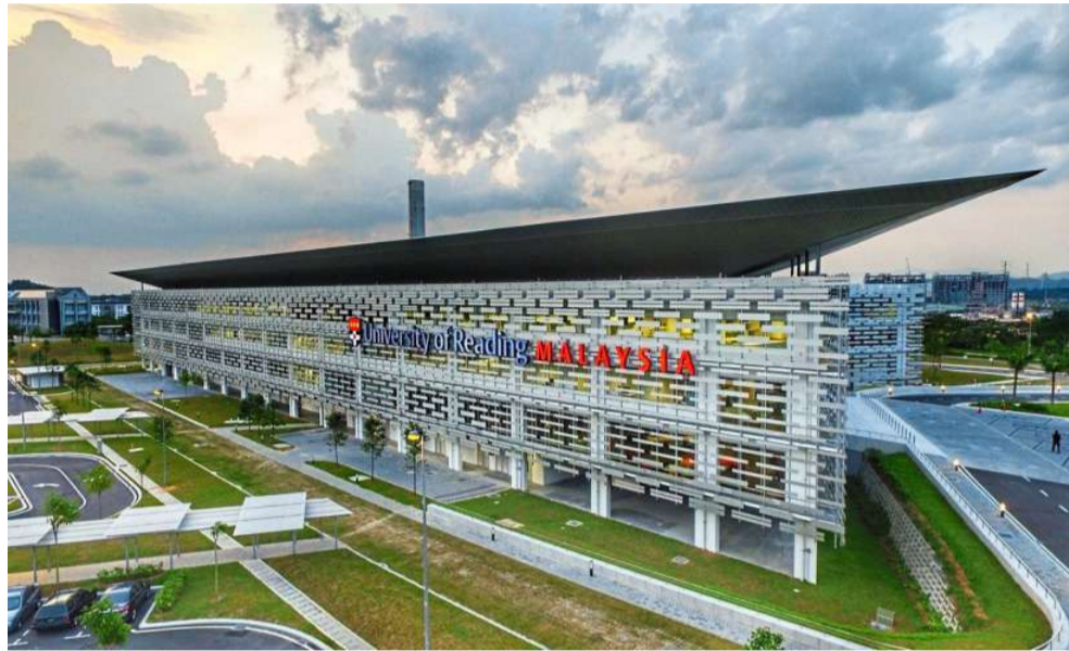
University of Reading Malaysia's state-of-the-art campus in EduCity Iskandar Johor.