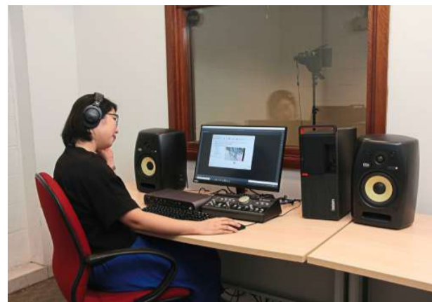
Students get the opportunity to utilise state-of-the-art learning facilities such as the recording studio.

Diploma in Mass Communication As society is reliant on the