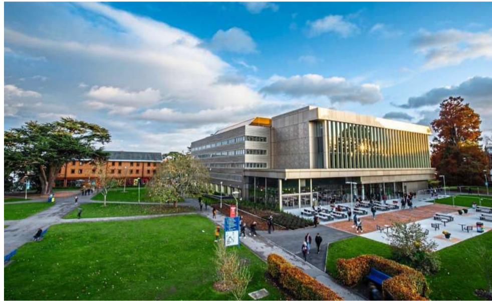
The main library building on the Whiteknights campus in Reading UK.