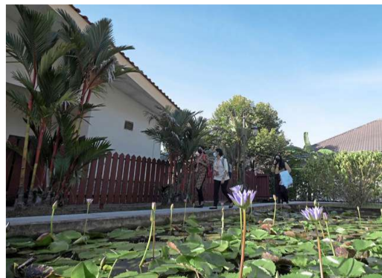
MUCM's resort-style campus provides students with an environment that is conducive for learning.

With over three dozen medical schools in Malaysia to choose from, MUCM which was formerly known as Melaka-Manipal Medical College,