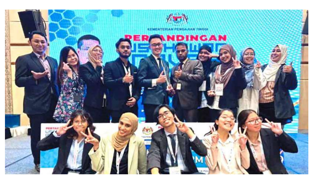
The bright young minds from MSU who represented the university in the MoHE Innovation Entrepreneur Competition 2022.

Education Guide THE STAR, THURSDAY 5 JANUARY 2023