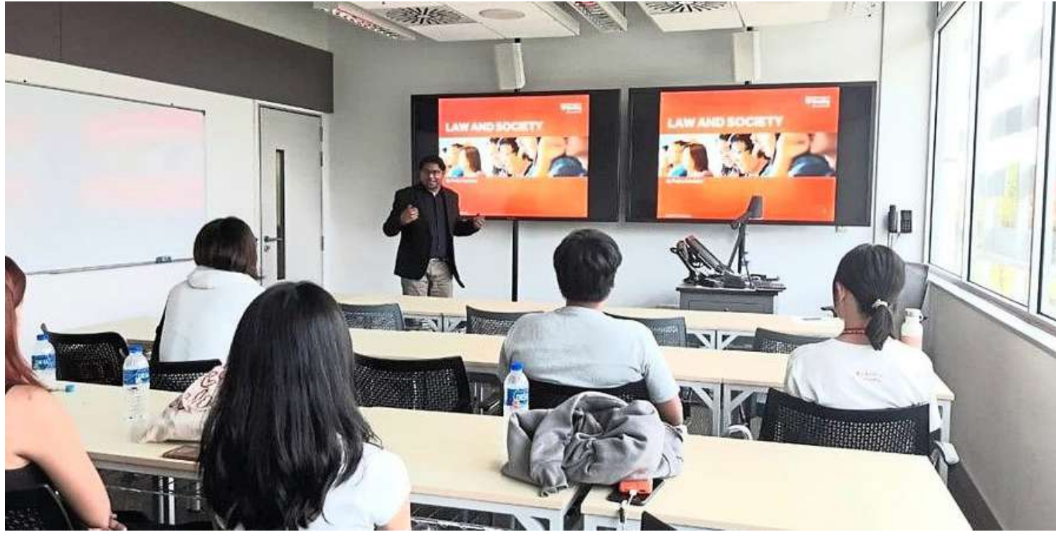
Students benefit from small class sizes as they receive more personalised attention.

As a branch campus, the university emphasis on the development of English