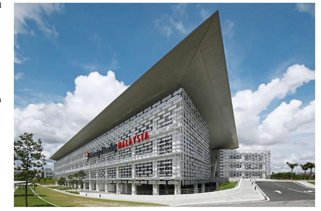
The University of Reading Malaysia's state-of-the-art campus in EduCity Iskandar, Johor.

students can aiso make use of the additional term to take on a lighter study