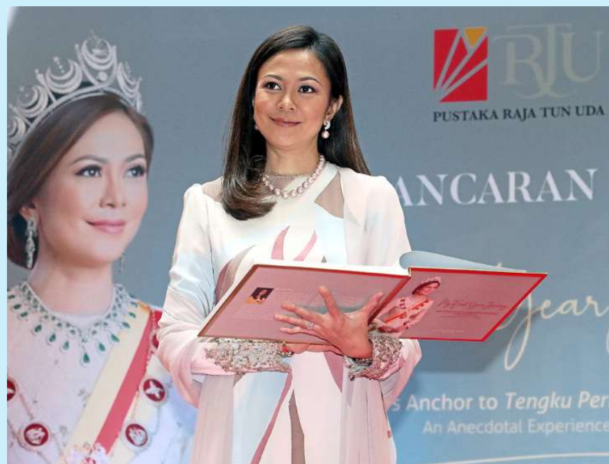
Tengku Permaisuri Norashikin at the launch of a book about her journey in the palace in December 2019.