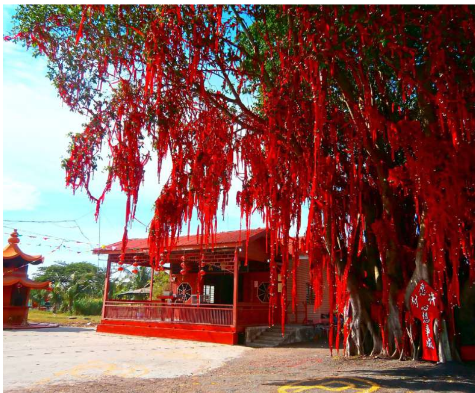
The Sekinchan Wishing Tree at Pantai Redang Datuk Kong Temple is adorned with wishes written on red ribbons.