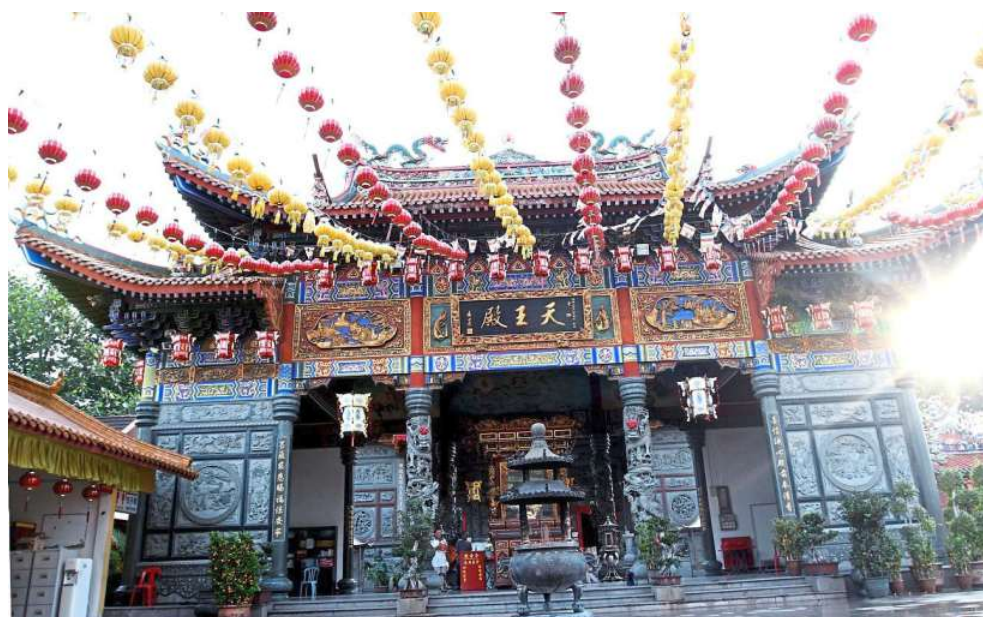
Kuan Yin Temple (Goddess of Mercy Temple) is over 100 years old and the worship point for Klang’s Hokkien community.