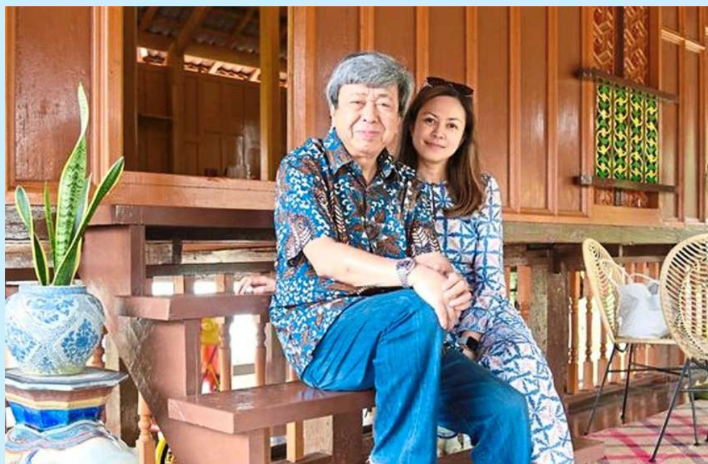
Sultan Sharafuddin and Tengku Permaisuri Norashikin were married at Istana Alam Shah in Klang on Aug 30, 2016.