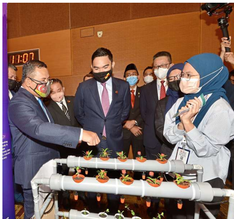
Tengku Amir and Selangor Menteri Besar Datuk Seri Amirudin Shari (left) inspecting a water quality device to detect pollution after the launch of the Selangor International Business Summit 2021 on Nov 19.

In October 2016, Tengku Amir underwent the age-old rites of the state's royal institution endorsing his accession as the Selangor throne's heir apparent.