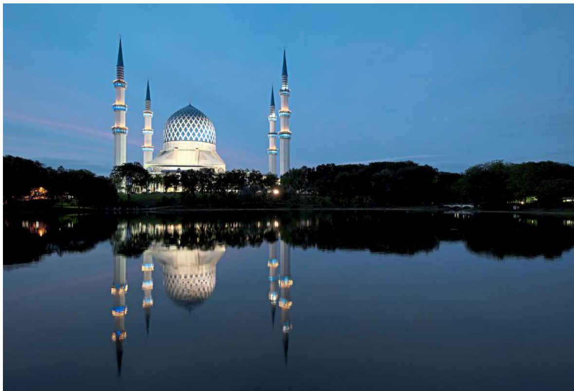
The Sultan Salahuddin Abdul Aziz Mosque, also known as the Blue Mosque, is the state mosque of Selangor, the country's largest mosque and the second largest mosque in South-East Asia.

Indeed, Selangor is a tourist destination which has many things to offer, from cosmopolitan treats to the beautiful sounds and sights of nature.