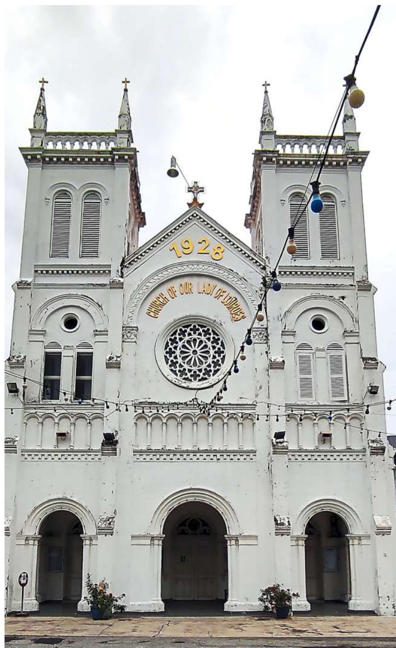
The beautiful Church of Our Lady of Lourdes Church in Jalan Tengku Kelana features glass panels from Sime Darby Medical Centre that show alleged apparitions of Mother Mary and Jesus Christ.