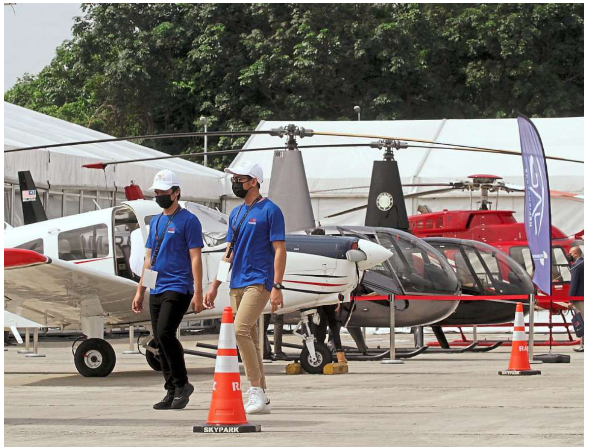
The Selangor Aviation Show 2021 reflects Selangor's pursuit of becoming a regional centre for aerospace and aviation activities.

To realise this intent, Selangor was seeking investors with expertise in automation, industrial Internet of Things and advanced robotics, he added.