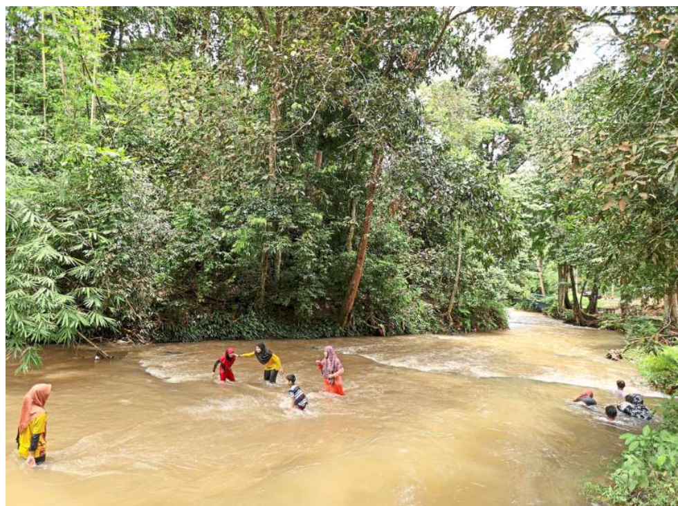
Families can have a splashing good time at the Kanching Eco Rimba Park in Templer Park, Rawang.