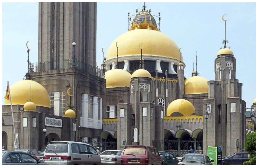
The Sultan Sulaiman Mosque, also known as Selangor’s royal mosque, was opened in 1933.

As Port Klang was the arrival point for several migrant communities from other parts of Asia some 200 years ago, the town’s