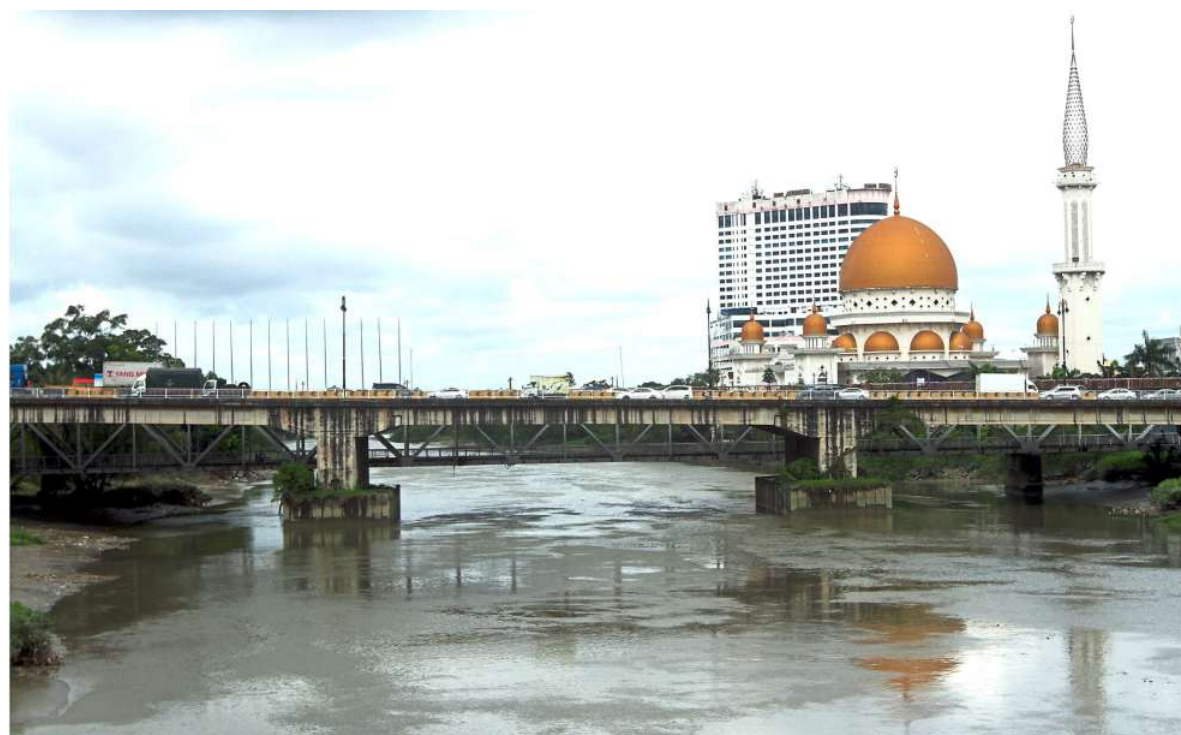
The iconic Kota Bridge is the first double-decked bridge in the country.