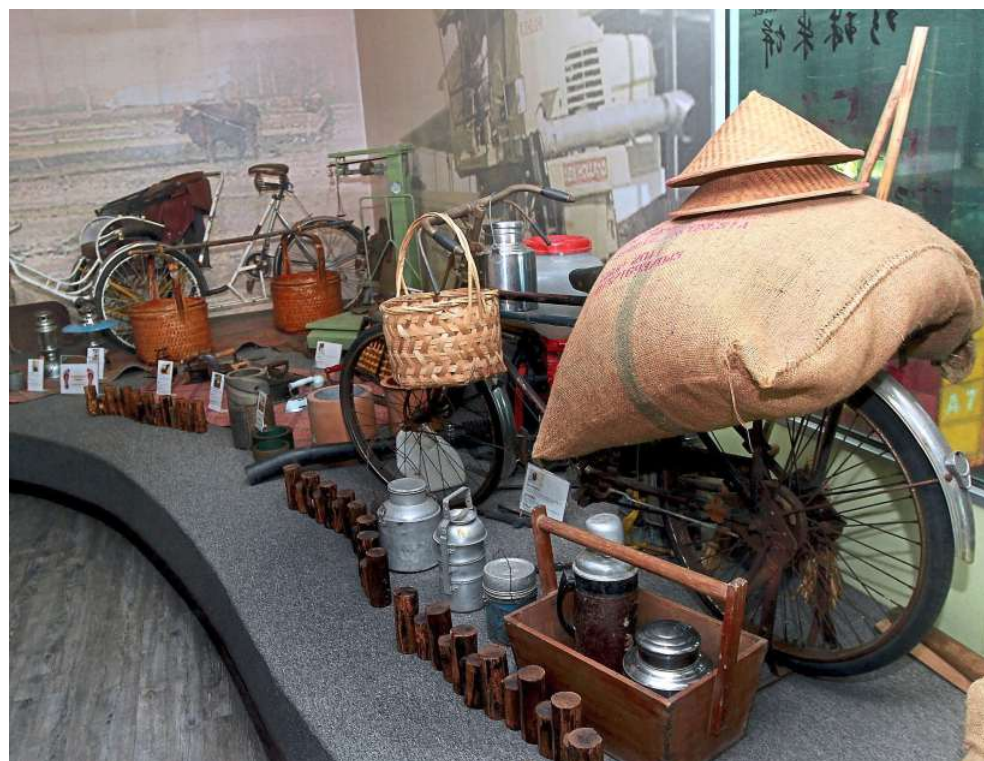
Learn more about the rice we eat at the padi museum in Sekinchan.