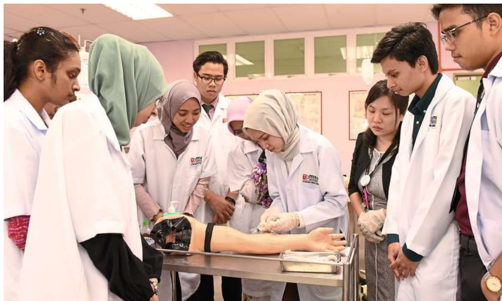
MSU's medical students have the privilege of completing their clinical training at two major referral hospitals in Selangor, Malaysia, namely Hospital Tengku Ampuan Rahimah in Klang and Hospital Sungai Buloh.