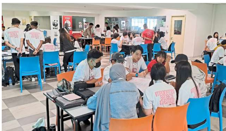
The One Academy students' preparation during the Design Issue challenge.

These students collectively won a total of two gold, three silver and four bronze awards, whereas both lecturers who participated each received a gold award in the Art Attack category.