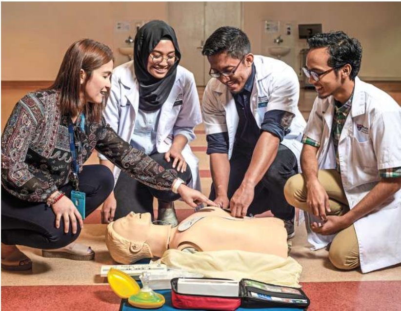
Clinical practice bridges the gap between theory and practice, providing medical students with invaluable hands-on clinical experiences.

real patients, they develop essential skills in diagnosis, treatment, and patient communication. This not only instils clinical proficiency but also fosters qualities such as empathy and adaptability. NUMed's emphasis on clinical practice extends beyond the confines of traditional medical education. The varsity actively encourages students to engage in community outreach programmes, reinforcing the connection between medical knowledge and its application in real-world scenarios. In essence, NUMed's commitment to the imperative role of clinical practice ensures that graduates emerge not only as academically accomplished individuals but also as compassionate, skilled, and socially responsible healthcare professionals ready to make a positive impact in the ever-evolving field of medicine. ■ To know more, visit https://www.ncl.ac.uk/numed/