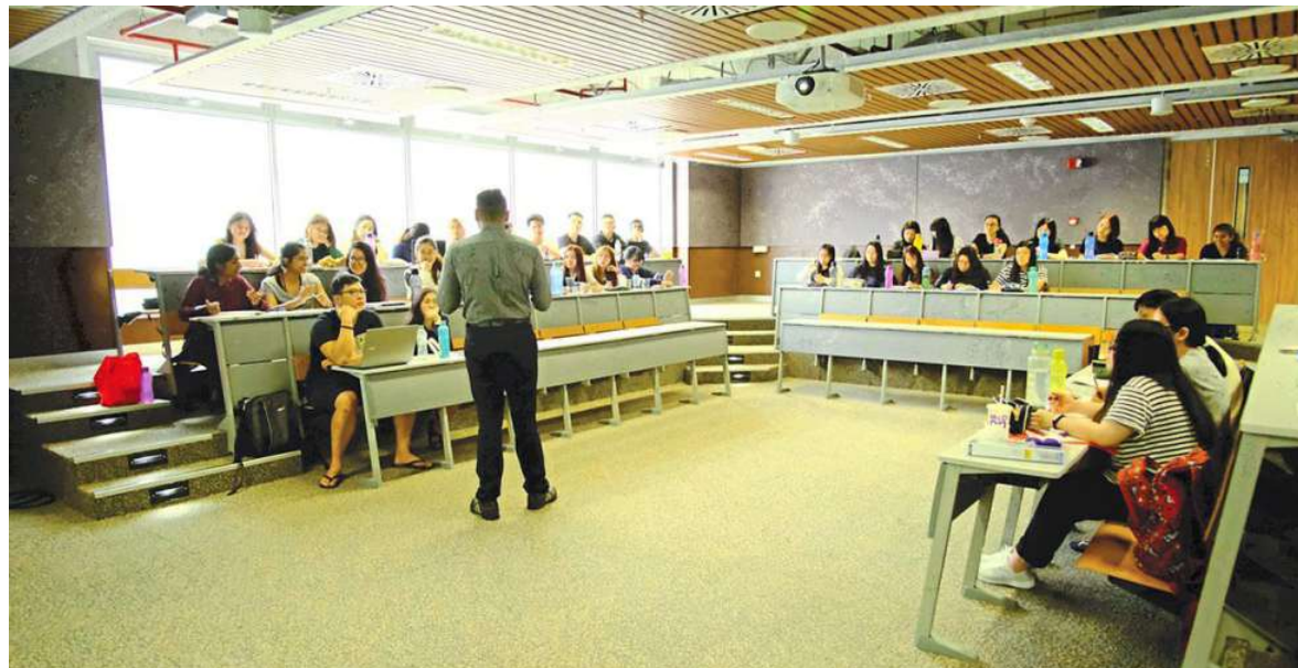
UoRM's moot court is an ideal setting for applied learning.