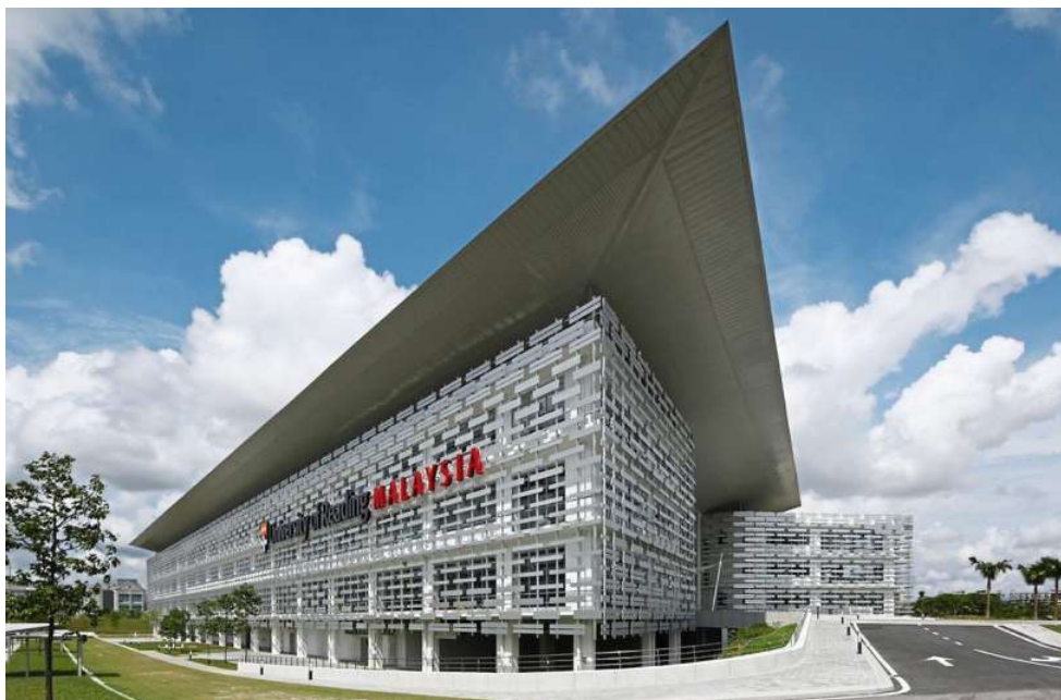
The iconic, state-of-the-art University of Reading Malaysia campus in EduCity Iskandar.

Further details of the programmes offered at the Malaysia campus can be found at https://www.reading.edu.my/programmes .