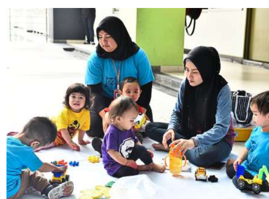
The Diploma in Early Childhood Education offered by MSU College is specifically designed for those passionate about teaching children.