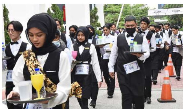
Waiter Race was among the competitions organised during the two-day HeARTS Carnival.

Among others, there were short courses on content marketing strategy, social media business and the Companies Commission of