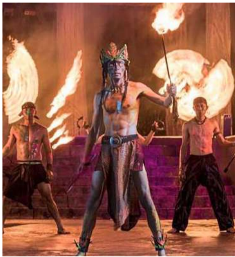
Flaming Percussion Show.

Sunway Lost World Of Tambun, in contrast to Sunway Lagoon, is a family-oriented theme park set away in a lush green forest. Families come here in droves to unwind