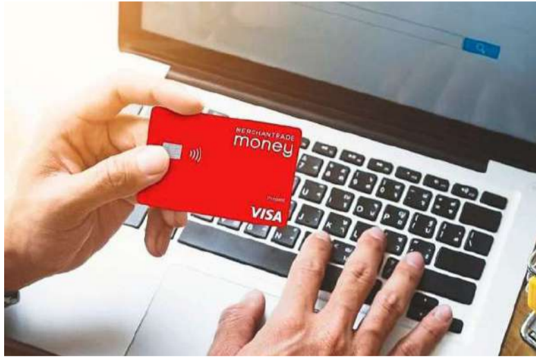
Merchtrade Money Card offers a host of travel benefits and added peace of mind.

For one, you can buy, keep and sell up to 20 currencies in the app at zero charge, which means you need not run around looking for money changers when your local currency runs low. It also locks in exchange rates at the time you purchase foreign currencies, without being affected by the fluctuation of