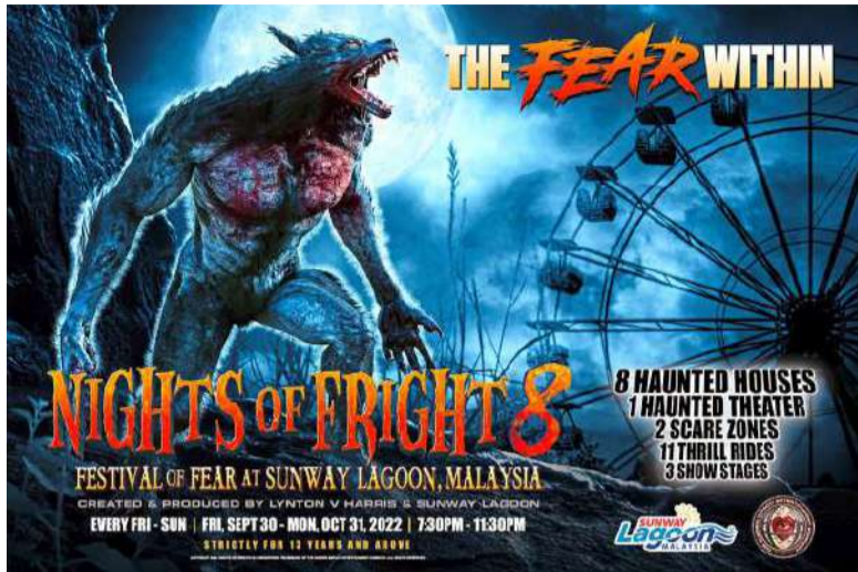
Nights of Fright is touted to be Malaysia's most notorious and highly anticipated horror fest.

last batch was completely destroyed and only the scarecrows remain. What will happen now? Come find out!