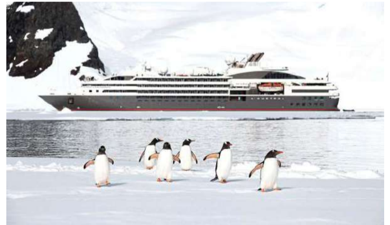
Ponant offers unique cruise itineraries to some of the most untouched destinations in the world.