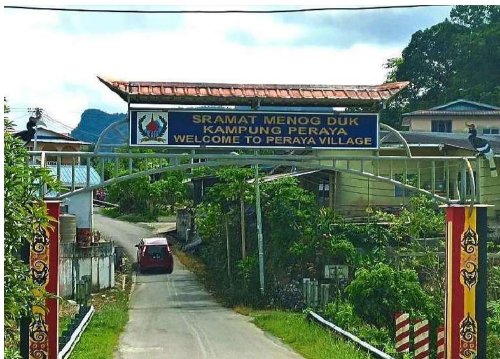
The main gateway to Kampung Peraya.

The headhunting ritual in Sarawak came to a stop when Sir James Brooke, the first