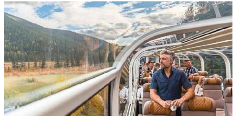
Experience the most scenic train ride in the world.

Free 1' offer, valid for the remaining 2022 and cash savings up to RM1,800 per couple for 2023 cruises.