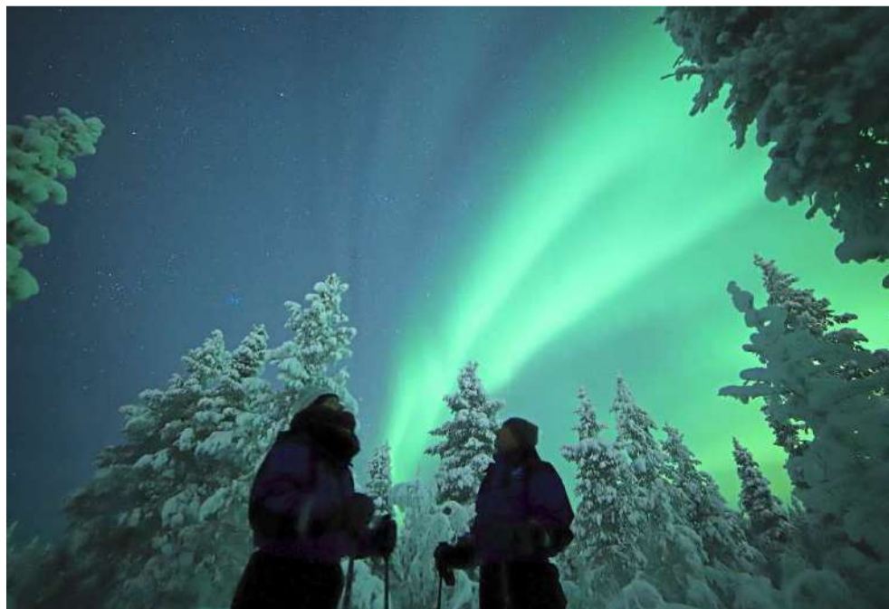
Go aurora hunting in the Arctic Circle.