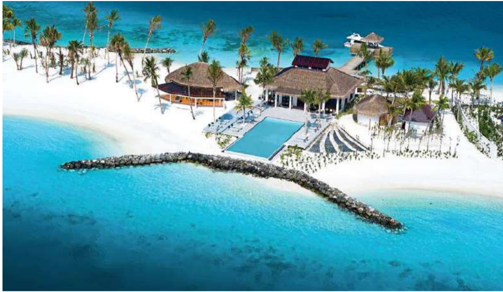
Enjoy Oblu Select Lobigili under Colours of Oblu by Atmosphere Hotels and Resort.