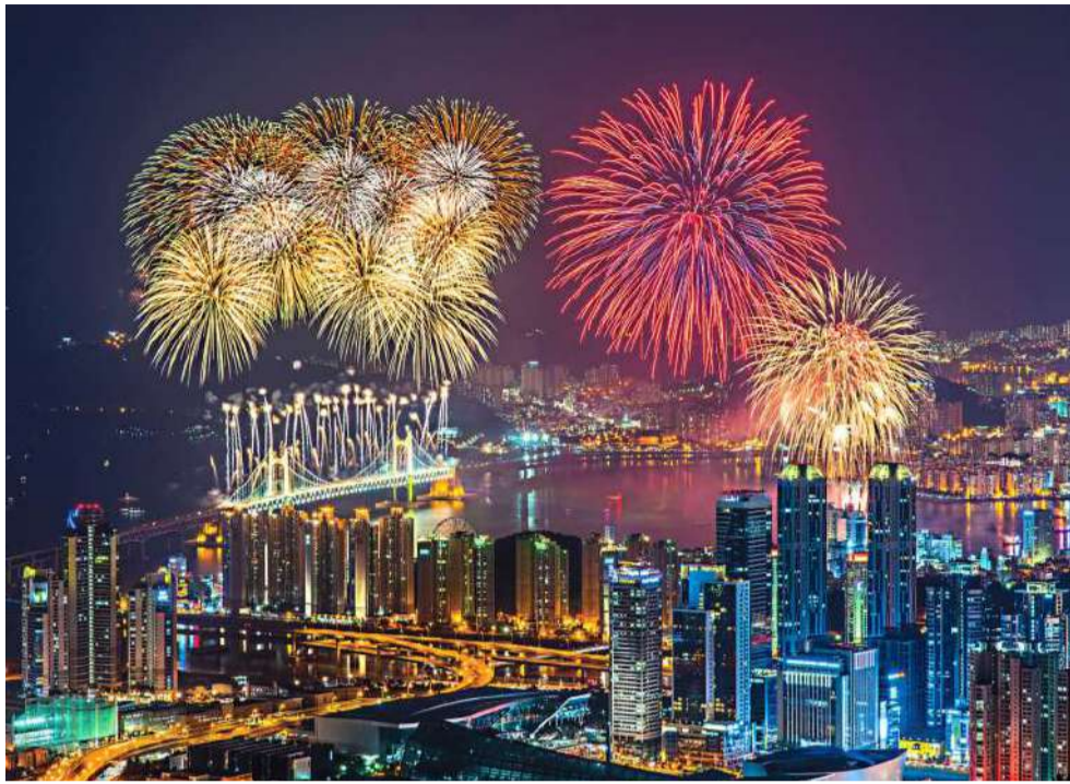
Busan night view of the Fireworks Festival.