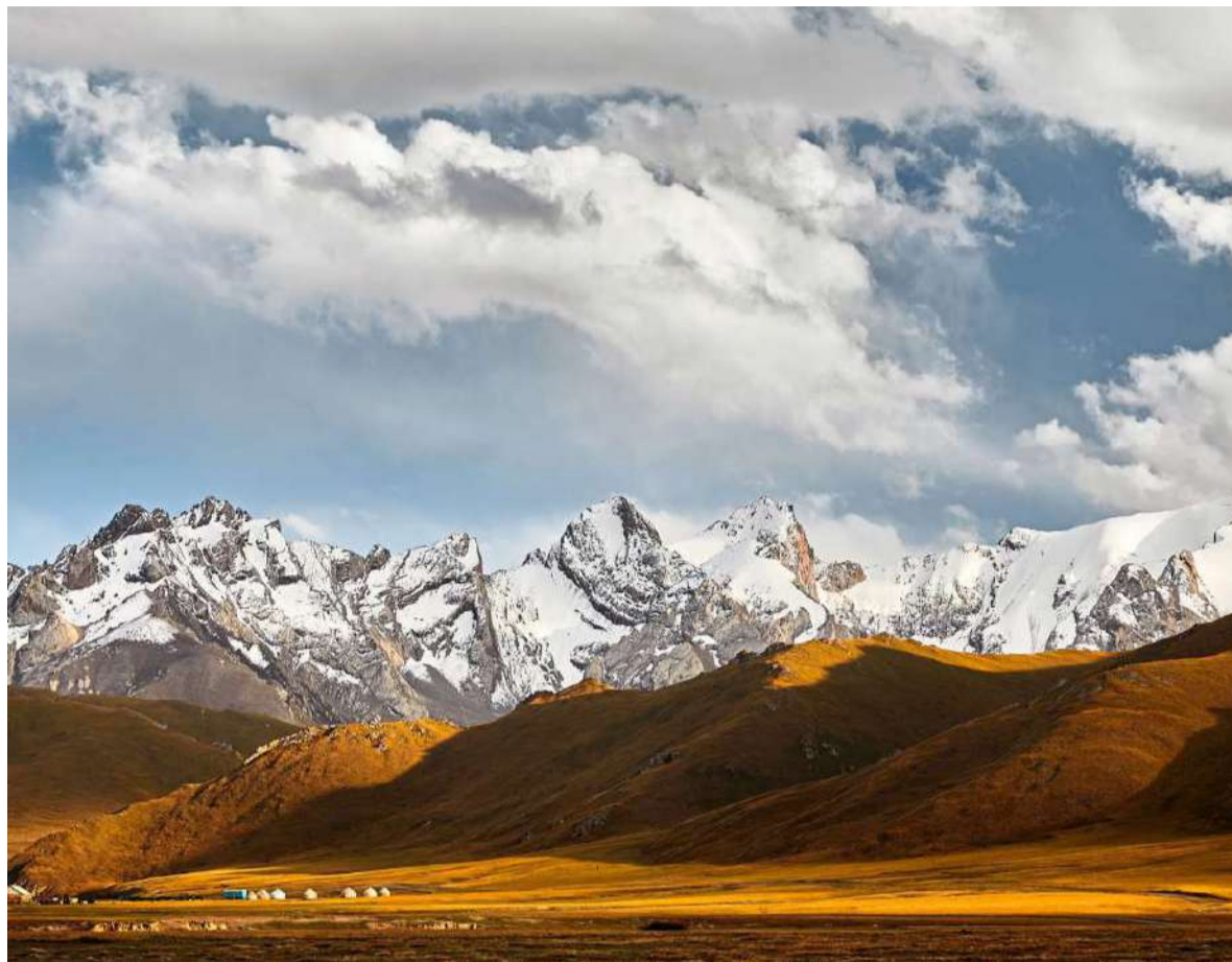
Marvel at the breathtaking view in Kyrgyzstan.