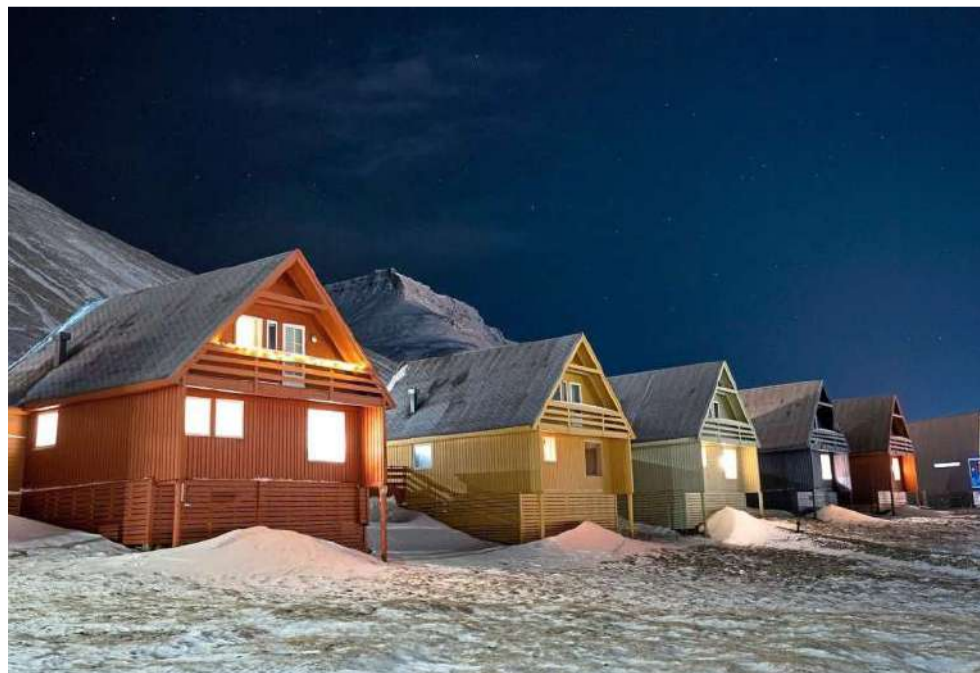
Experience a Polar Night in Longyearbyen, Svalbard.