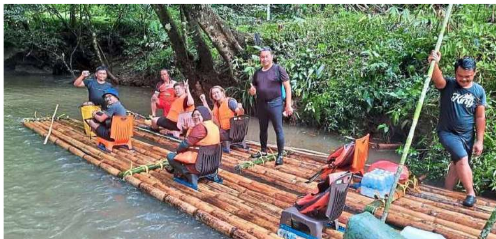
A group posing to mark the end of their bamboo rafting journey.

White Rajah, put a ban on the practice in the 1800s.