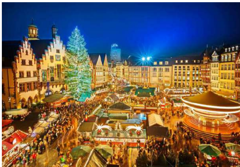
Explore a traditional Christmas Market in the historic centre of Frankfurt.

A magical time of the year, a Christmas holiday can be a downright extraordinary experience. Imagine a family getaway filled with carols, fir trees, old-world traditions, festive food and mesmerising Christmas markets set against the backdrop of stunning medieval cities and snowy Alps.