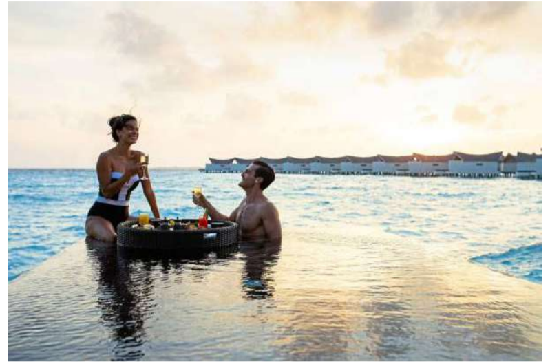
Enjoy idyllic tropical vistas and floating breakfast experience at Movenpick Resort Kuredhivaru Maldives.

WHEN it comes to honeymoon destinations, Maldives is definitely at the top for most couples. Just one glance at any image of this paradise on earth will transport you away to its pristine beaches, clear blue waters and a private villa escape all to yourself.