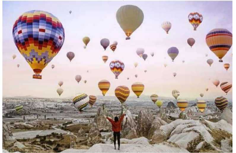
Turkey Göreme, Cappadocia.

discounts between RM600 and RM1,000 (terms and conditions apply).