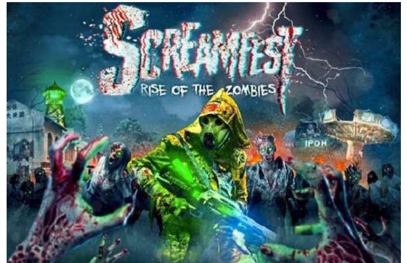
Sunway Lost World of Tambun Screamfest is also returning for the first time since the two-year pandemic.

Fragments of the moonlight slashes across her face to reveal a sinister smile as she offers you a