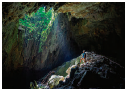
Experience caving in one of the 100 world class caves found in Sarawak!