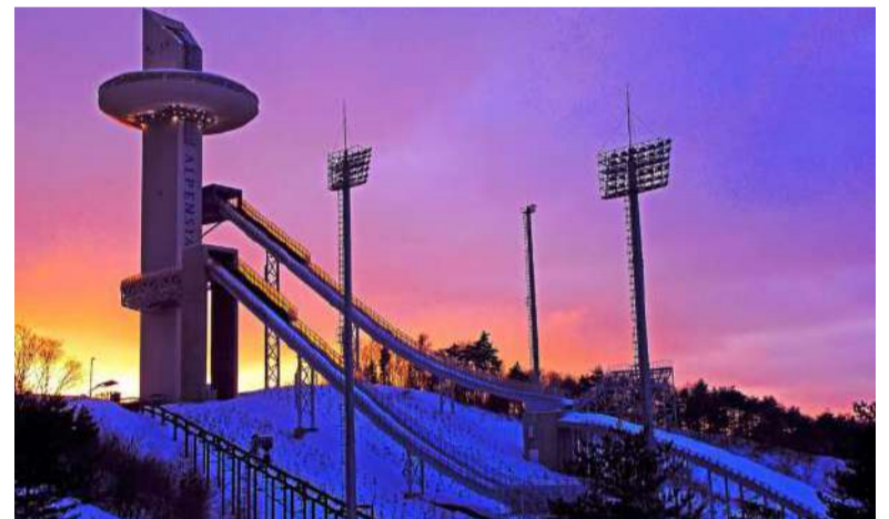
Alpensia Resort was the main venue for the PyeongChang 2018 Winter Olympic Games.

Held at the Garden of Morning Calm, the Lighting Festival was the