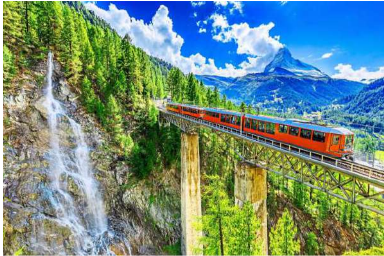
Switzerland rail in Europe.

In addition, Apple Vacations' highlights include the ever-popular and exclusive "Apple Charter Flight to Hokkaido" tour, with early-bird