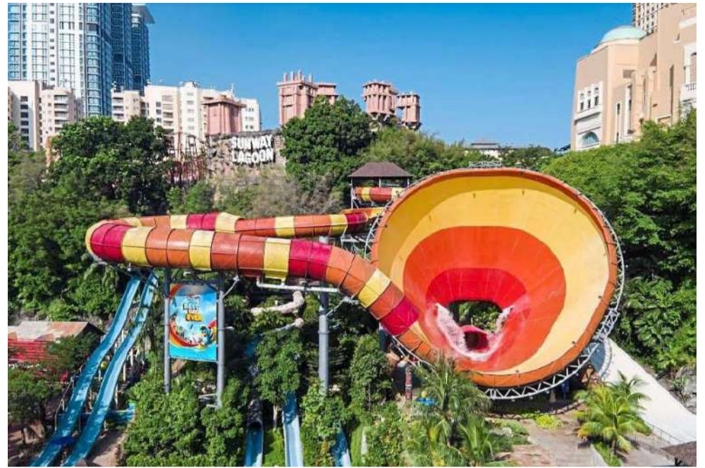
The Vuvuzuela is the world's largest vortex ride.