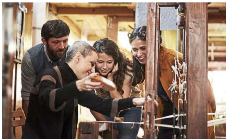
Discover Italy's weaving tradition with Trafalgar's 'Make Travel Matter' experience in Perugia.

Join Trafalgar's local specialist in Cordoba, Spain and learn about centuries of Moorish rule and its influence on the culture and architecture of the region.