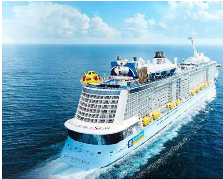
Holidaymakers will have no shortage of options to choose from with a sensational line-up of itineraries on Spectrum of the Sea.

"Recovery of the cruise industry is in full swing, and we're thrilled