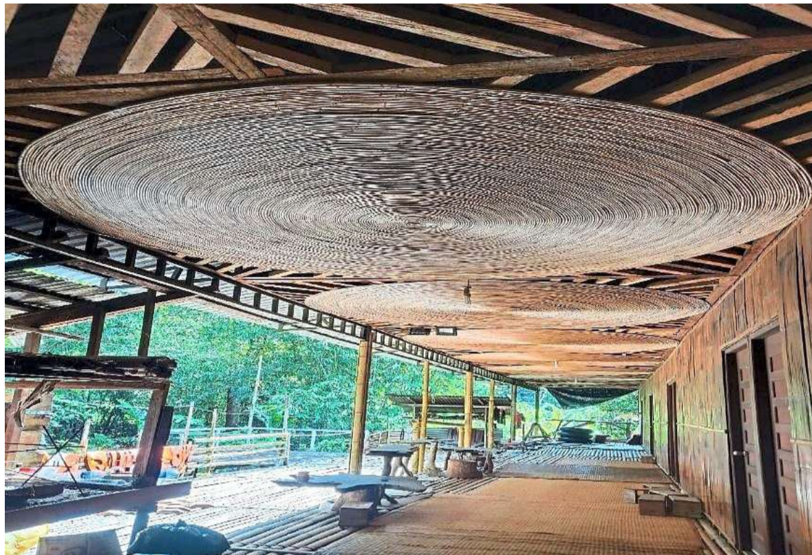
The circular-designed rattans on the ceiling of Peraya Homestay.