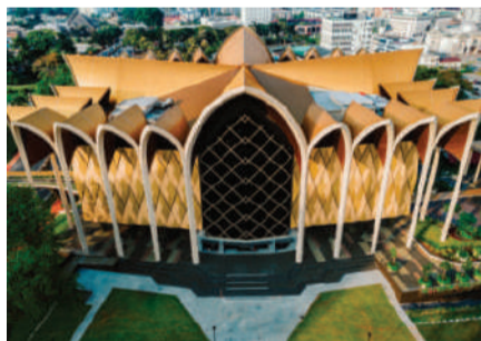
Visit Malaysia's largest & newest museum, The Borneo Cultures Museum

Revealing a side of Asia unlike anywhere else, Sarawak offers an alternative for those seeking humble authenticity far from the tourist-trap clichés. Whether it is sharing in the lifestyle of one of the many indigenous communities' longhouses, exploring gigantic caves in the UNESCO World Heritage of Gunung Mulu National Park, you will find Sarawak offers a host of memorable experiences to bring home to.