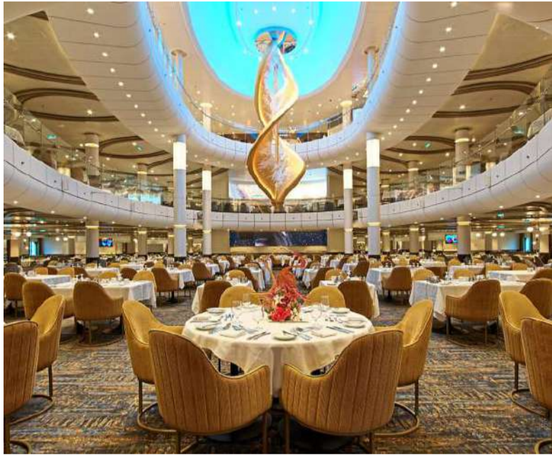
Cruises offer great value for money with incredible dining options.

VACATIONERS can set their sights on more ways to explore Asia and make life-long holiday memories on this year's favourite cruise line, the Royal Caribbean International.