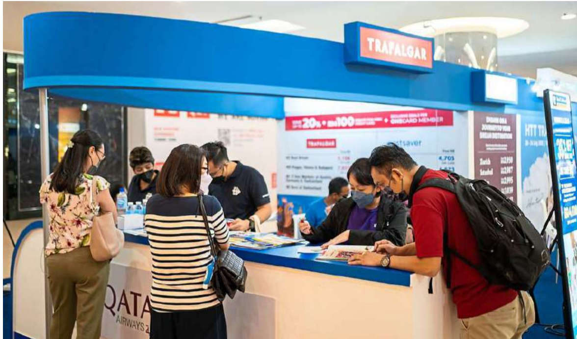
Holiday Tours and Trafalgar will be joining hands to provide travel experiences with the best value for Malaysian travellers.

Travellers looking forward to exploring Europe after the pan-