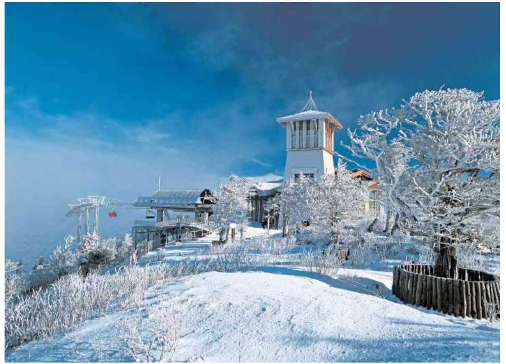
Yongpyong Ski Resort.