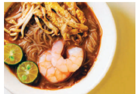
Try our renown Sarawak Laksa!