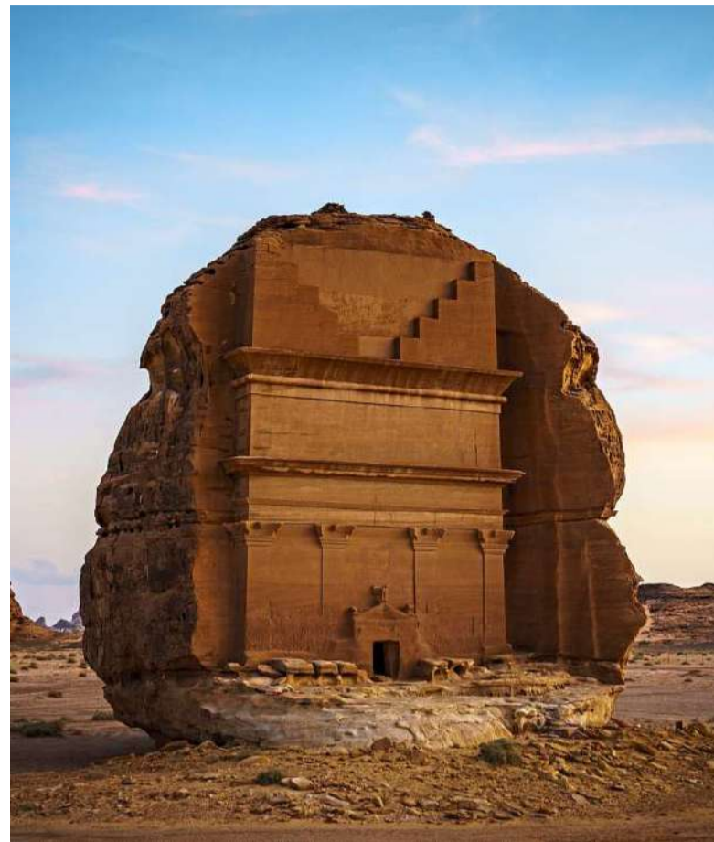
Discover beautiful heritage sites in Saudi Arabia such as in Al-Ula.

DISCOVER exciting deals for your long-awaited holidays! Visit Parlo Tours's booth at the MATTA Fair KL from Sept 2-4 at the World Trade Centre, KL and stand a chance to win yourself a free trip.