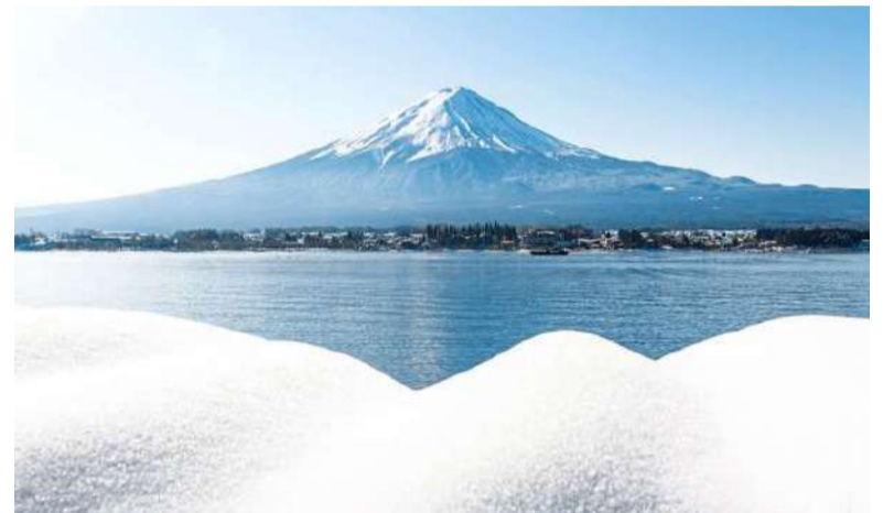
Mount Fuji in Japan.