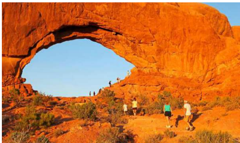
Rocky Mountaineer offers access to a world of unparalleled beauty and exclusivity.

Trains in the world, this is more than just an ordinary train ride. Rocky Mountaineer offers access to a world of unparalleled beauty and exclusivity into the Canadian Rockies.