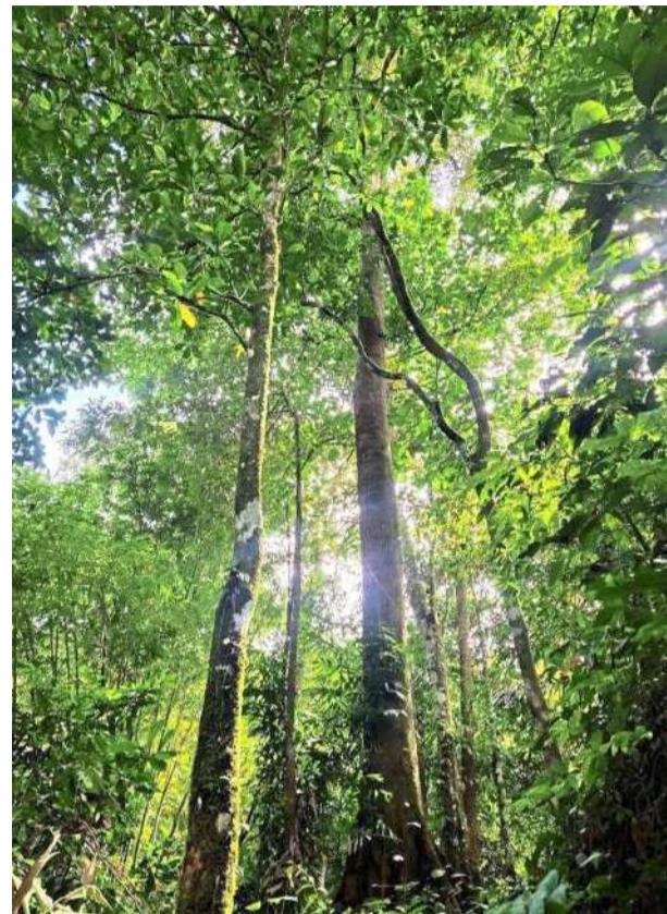
One of the magnificent views one can witness along the Kampung Peraya jungle trail.