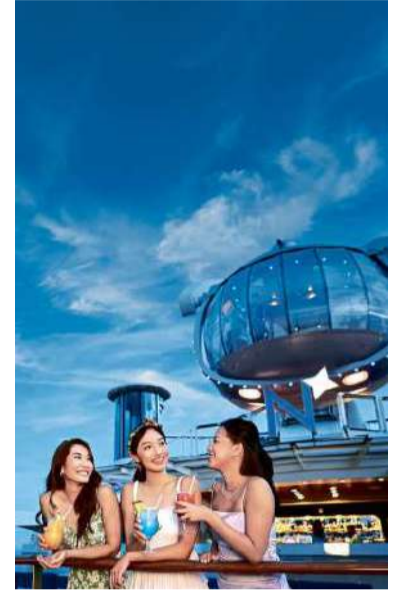
Vacationers have the option to choose between short, fuss-free getaways and longer-haul cruises.

This can also be done back-to-back, which would cover 10 unique destinations across 24 spectacular