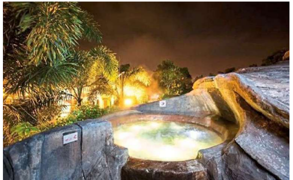
Lost World Hot Springs.

■ So quickly snag MATTA Fair exclusive packages to experience Awesome Moments and your Best Day Ever now.