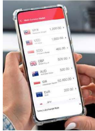
Lock in exchange rates at time of purchase with the multi-currency feature.

With a reputable track record, Merchtrade is back as the official money changer partner for the seventh time since 2017 at the upcoming MATTA Fair at the World