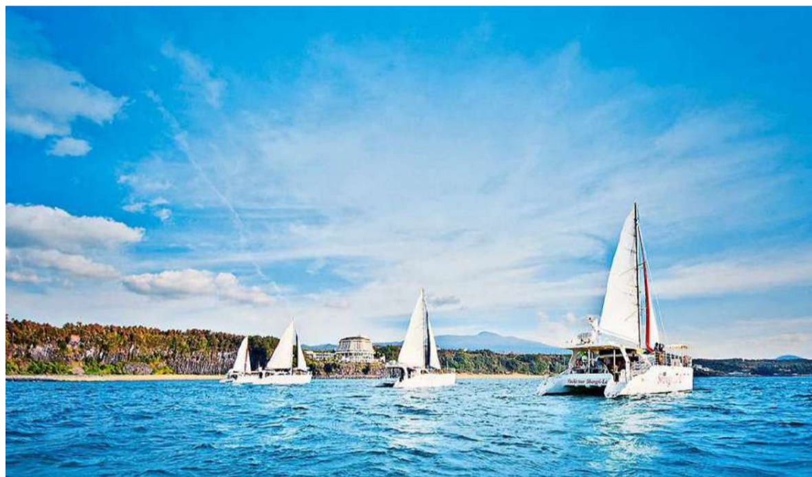
Have a luxurious experience in Jeju Island with the Shangri La Yacht Tour.

■ Experiences Matter to Parlo Tours. Visit its booth at the MATTA Fair for more details.