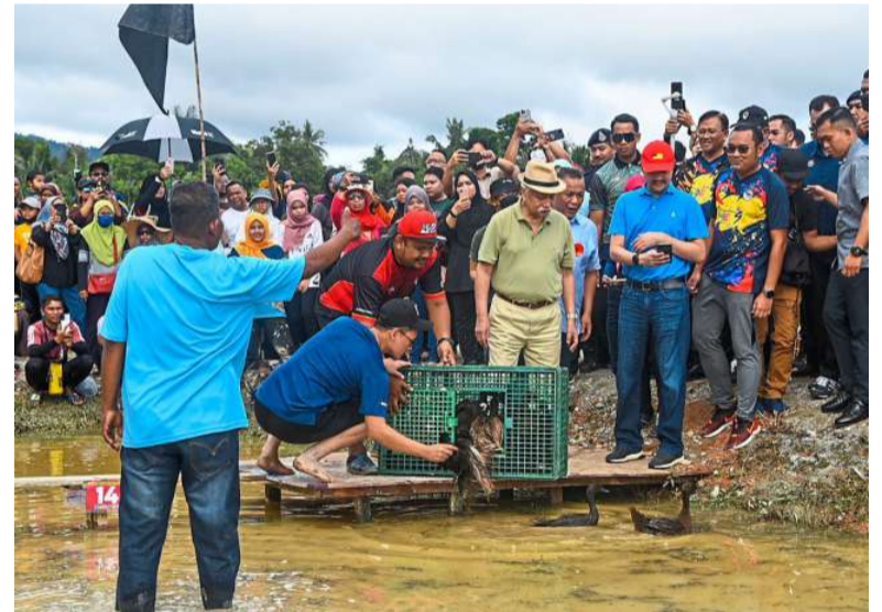
Tuanku Muhriz (wearing fedora) looking on at participants of the Pesta Bola Ngoca held at the Terachi Cultural Village in Kuala Pilah. Among the activities held are duck catching, sawah padi football, climbing up slippery poles, and gusti bantal.

Tuanku Muhriz's call for action also helps lend a voice to