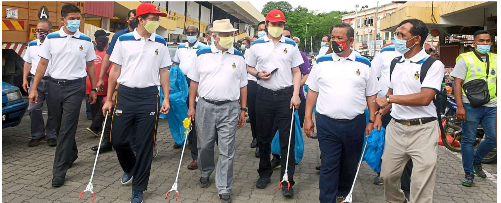
Armed with rubbish pickers, Tuanku Muhriz is accompanied by his sons Tunku Ali Redhaudin (red cap, right) and Tunku Zain Al-'Abidin (red cap, left) during a programme to clean up the main market in Seremban.