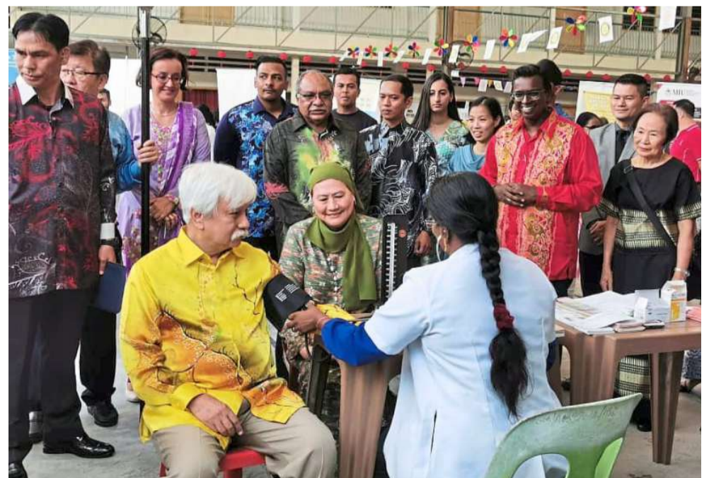
Tuanku Aishah Rohani and others looking on as Tuanku Muhriz receives a basic medical check-up after officiating an event organised by the Rotary Club at SJK(C) San Min in Seremban.