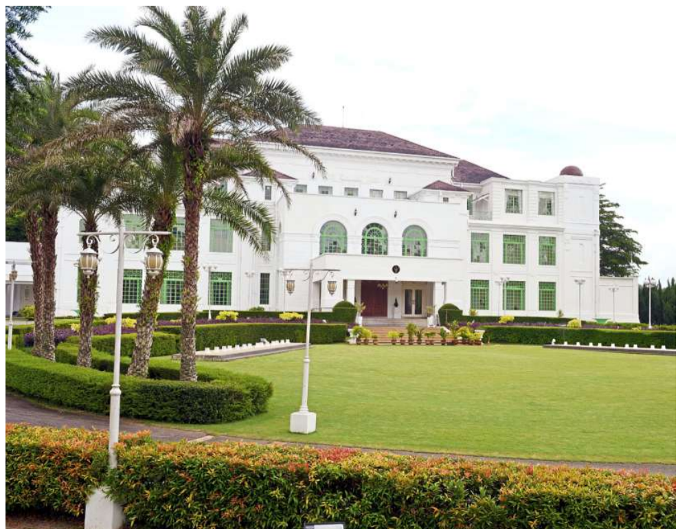
The Istana Besar Seri Menanti in Negri Sembilan is where Tuanku Muhriz bestows awards and honours to recipients in conjunction with his birthday celebration.