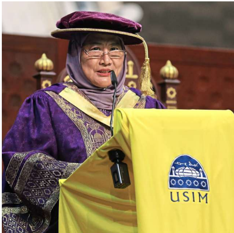
Tuanku Aishah Rohani delivering her address at USIM's 20th convocation ceremony.

yourself, your family and the university," she said.