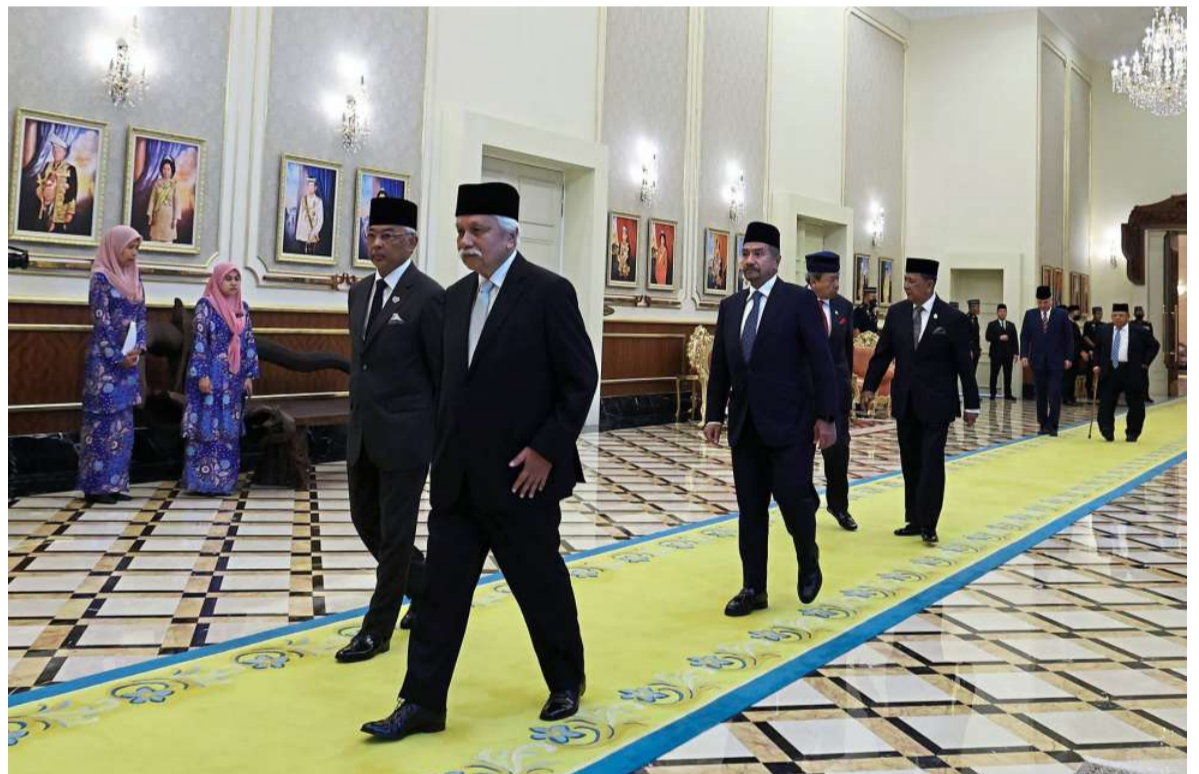
Yang di-Pertuan Agong Al-Sultan Abdullah Ri'ayatuddin Al-Mustafa Billah Shah (left) and Tuanku Muhriz leaving Istana Negara in Kuala Lumpur after the 260th Conference of Rulers meeting.

With a Ruler who champions causes that affect everyone regardless of colour and creed, the people of Negri Sembilan can always rely on Tuanku Muhriz to ensure fairness and equality for all.