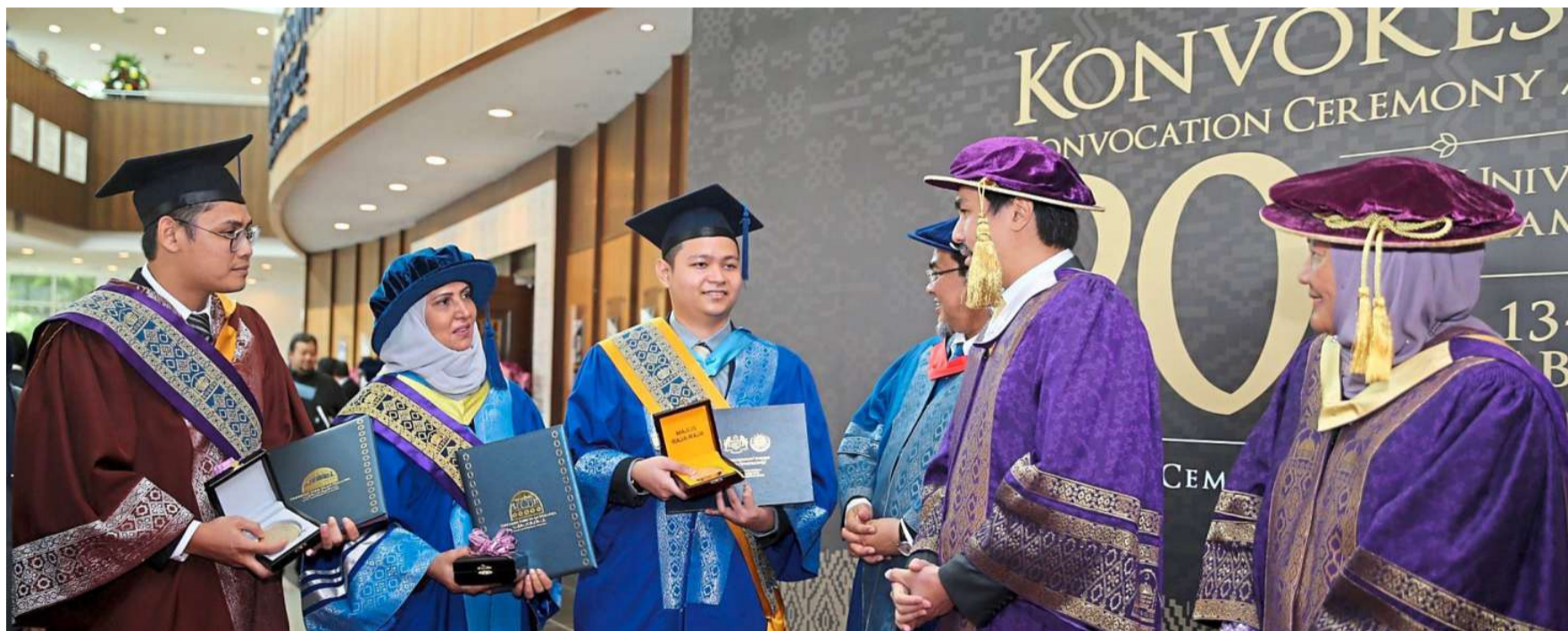
Tuanku Aishah Rohani, who is USIM chancellor, and university pro-chancellor Tunku Ali Redhaudin chatting with graduates who excelled academically during its recent convocation ceremony.