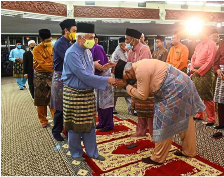
Tuanku Muhriz meeting his subjects after performing prayers at Masjid Negeri in Seremban.

Tuanku Muhriz's remarks may have come on the heels of GE15, but the Ruler has always been unwavering in his insistence on fairness and integrity – principles he imbibed as a young law student at the University of Wales, Aberystwyth (now Aberystwyth University).