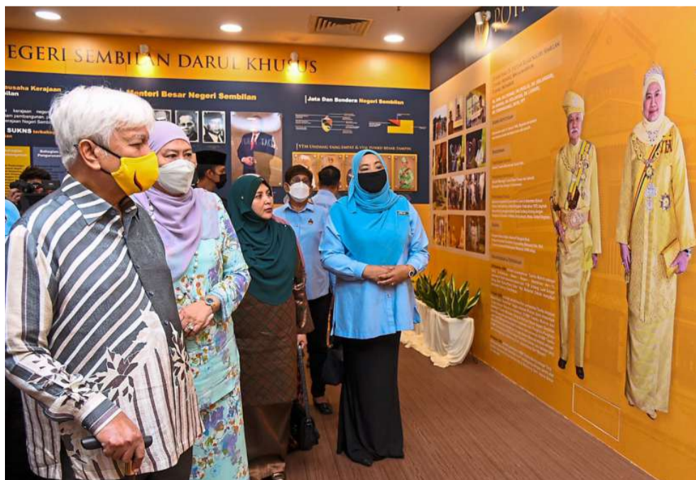
Tuanku Muhriz and Tuanku Aishah Rohani viewing a special section at the state library which, among others, has information on the history and traditions of the Negri Sembilan royal family.