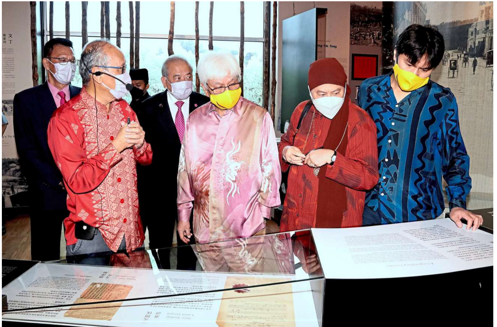
Yang di-Pertuan Besar Negri Sembilan Tuanku Muhriz Tuanku Munawir and Tuanku Aishah Rohani browsing materials on the history of the early Chinese settlers in the state while touring the Negri Sembilan Chinese Heritage museum.

"This will ensure that you can always protect the good name of