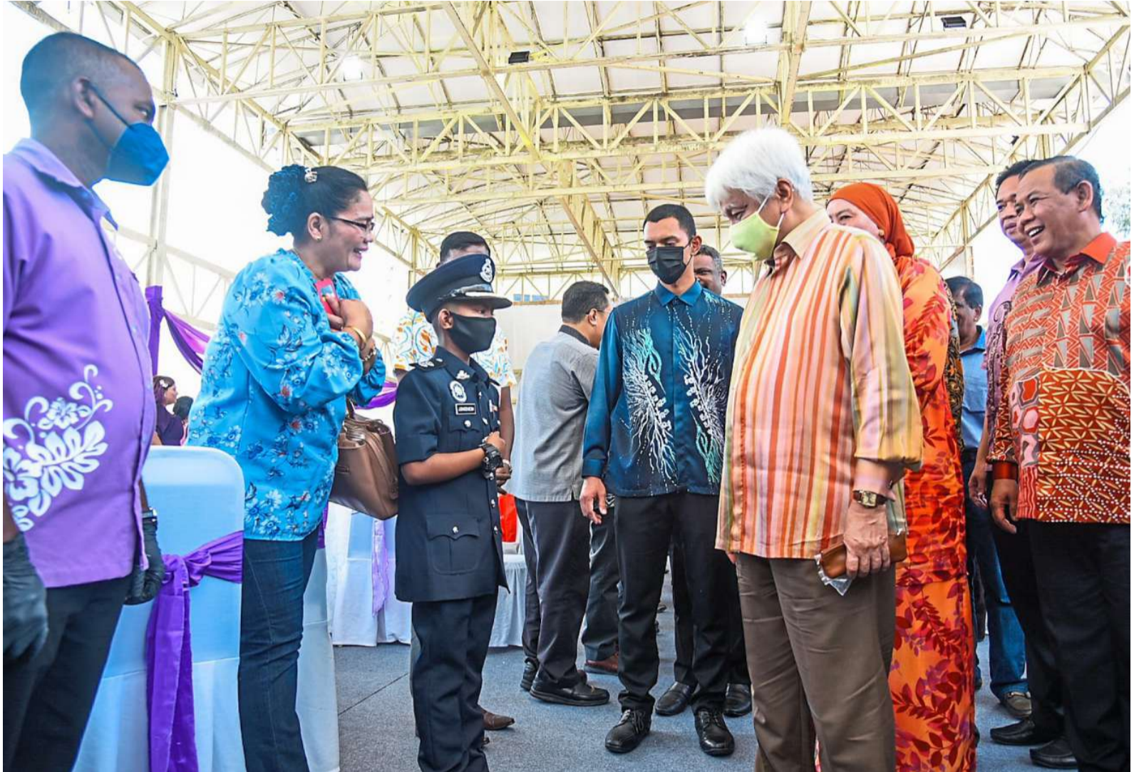
Tuanku Muhriz and his consort Tunku Ampuan Besar Negri Sembilan Tuanku Aishah Rohani Tengku Besar Mahmud look on in amusement at a boy dressed up as a policeman during a state-level Deepavali open house held in Port Dickson.

Tuanku Muhriz even touched on the appointments of five members of the Judicial Appointments Commission and why they should not be made by the prime minister.