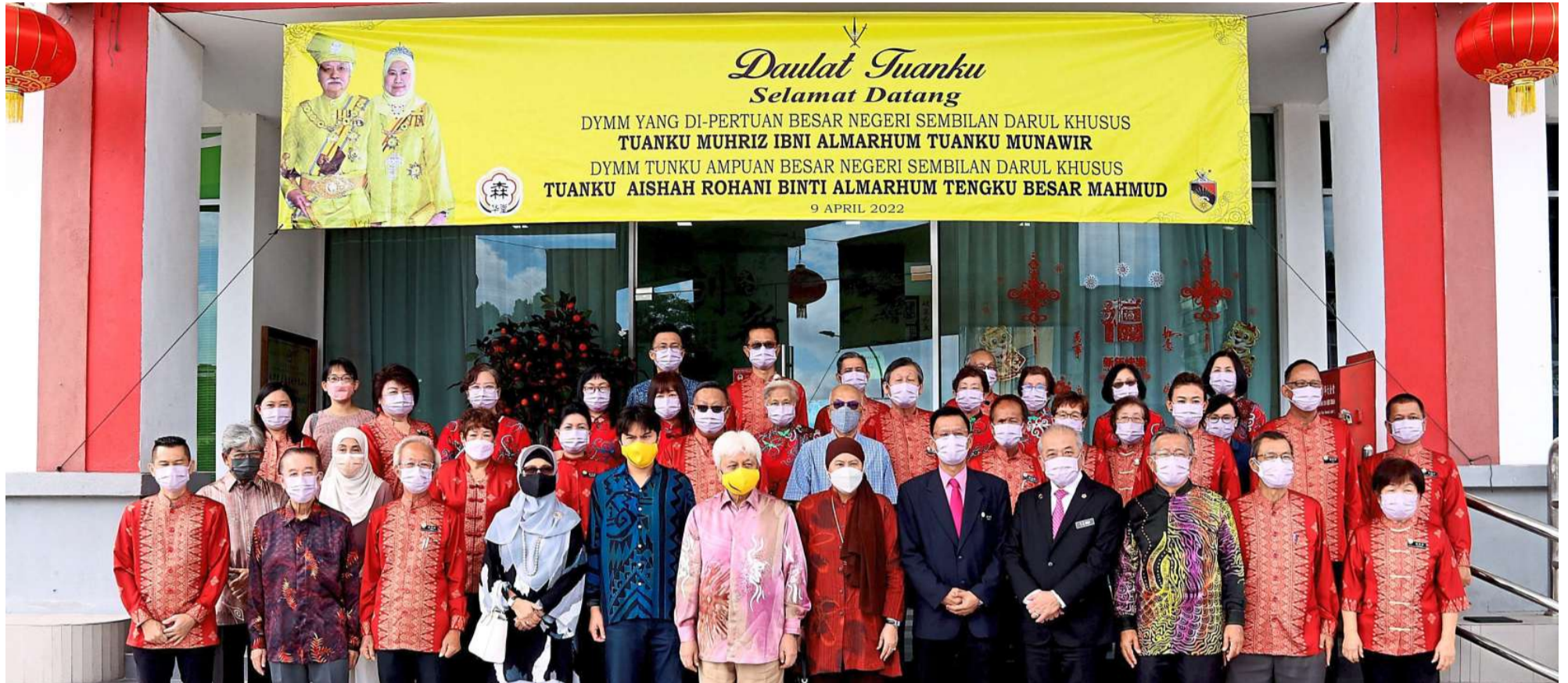
Tuanku Muhriz and Tuanku Aishah Rohani (front row, centre) posing for a group photo with some of the committee members of the Negri Sembilan Chinese Assembly Hall after visiting the Negri Sembilan Chinese Heritage Museum located inside the building.