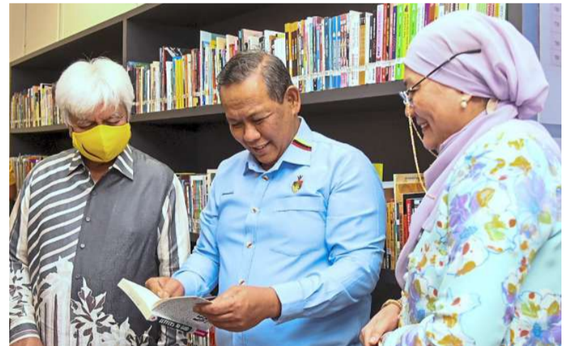
Tuanku Muhriz and Tuanku Aishah Rohani being briefed by Menteri Besar Datuk Seri Aminuddin Harun on the wide range of books available at the state library.