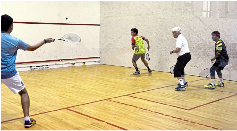
Tuanku Muhriz playing a game of squash with Tunku Zain Al-'Abidin (third from right) and two others.