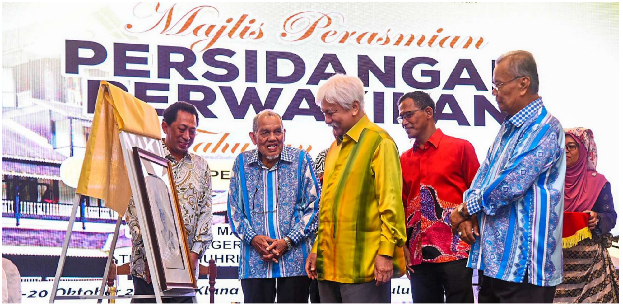
Tuanku Muhriz was presented with a portrait of himself after opening an event organised by the Negri Sembilan division of the Pensioners Association of Malaysia.