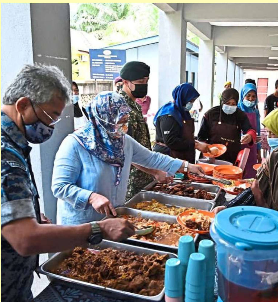
Sultan Abdullah and Tunku Azizah serving food to flood victims at a relief centre in Pekan, Pahang, in January.