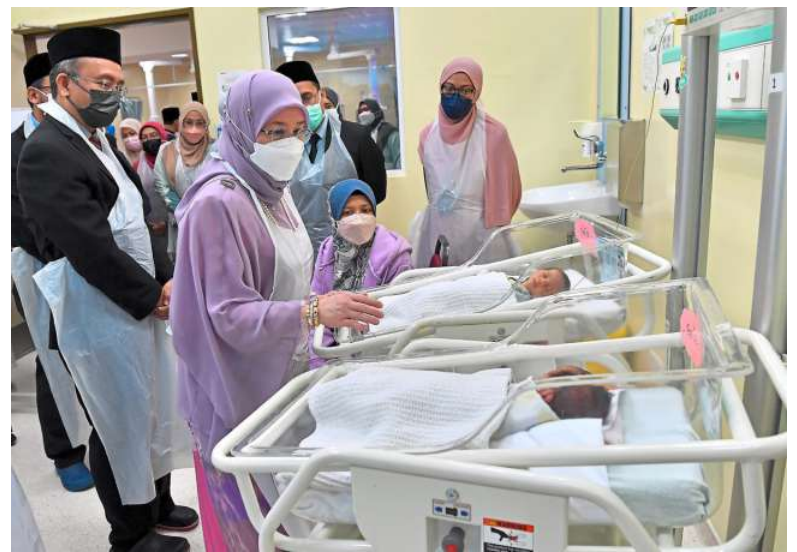
The Queen visiting newborns in the neonatal intensive care unit after launching the Halimatussaadia Mother's Milk Centre at the Sultan Ahmad Shah Medical Centre at International Islamic University Malaysia in Kuantan recently.

In May, Tunku Azizah personally headed a delegation to promote and exhibit the woven textiles in London as part of the prestigious London Craft Week. The Tenun Pahang Diraja exhibition showcased pieces made by inmates from the Penor and Bentong prisons.