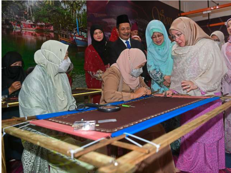
Tunku Azizah observing traditional weaving motifs during a visit to the Heritage Technology and Gastronomy Academy at the Centre of Technical Excellence in Kuching, Sarawak, in June.