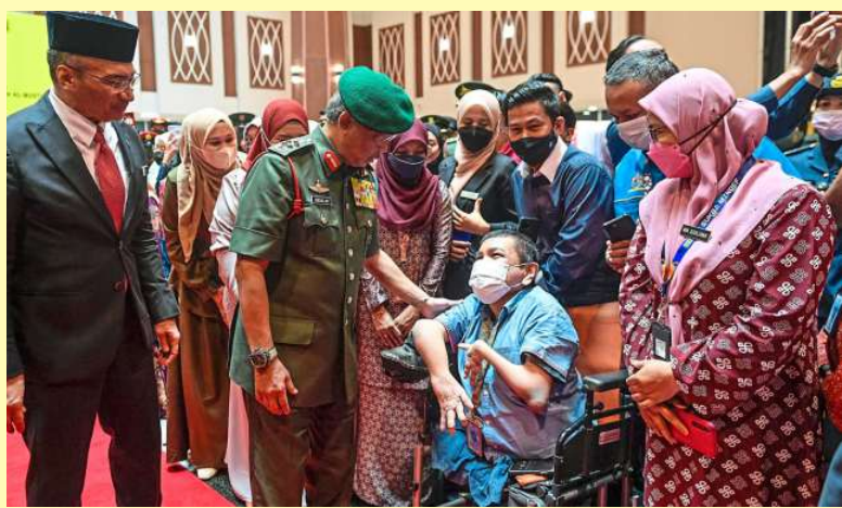
Sultan Abdullah meeting civil servants during a visit to the Defence Ministry at Wisma Pertahanan, Kuala Lumpur, earlier this month. Also present was Senior Minister (Defence) Datuk Seri Hishammuddin Hussein (left).