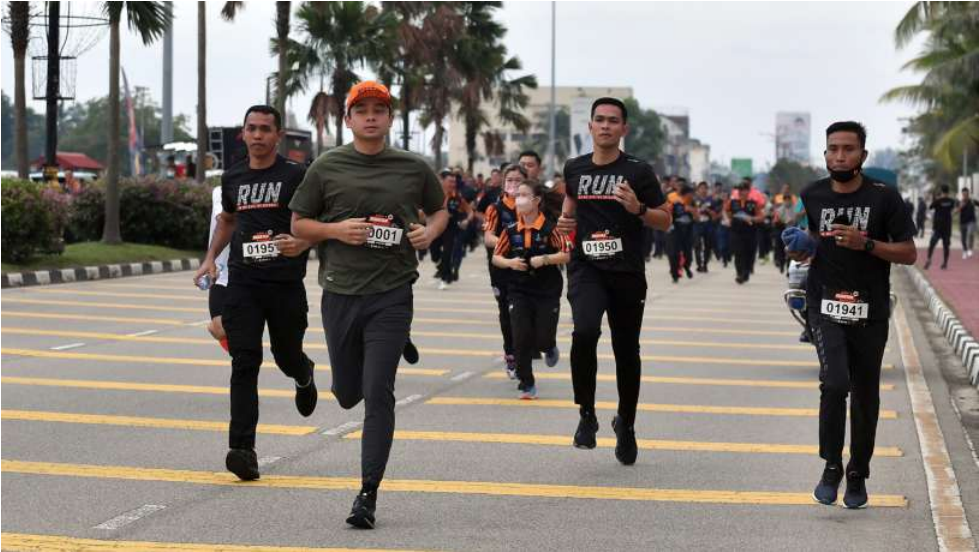
Tengku Hassanal taking part in a 5km Fun Run during the Pahang Youth and Sports Carnival 2022 at Padang Kemunting, Kuantan, earlier this month.

in the state with the establishment of the Pahang Forest Ranger or the Pahang Wildlife Patrol Unit under the patronage of the Regent. Wan Rosdy said the Pahang State Parks Corporation and the Pahang State Biodiversity Council had also been set up to protect biodiversity resources and conserve the environment in the state. Tengku Hassanal was appointed as the Pahang Regent by the Sultan of Pahang, Al-Sultan Abdullah Ri'ayatuddin Al-Mustafa Billah Shah, when the latter became the Yang di-Pertuan Agong in 2019. As the Regent, Tengku Hassanal is carrying out state duties in Al-Sultan Abdullah's stead while he is serving his term as King. This is provided under Article 18 of the Laws of the Constitution of Pahang, where