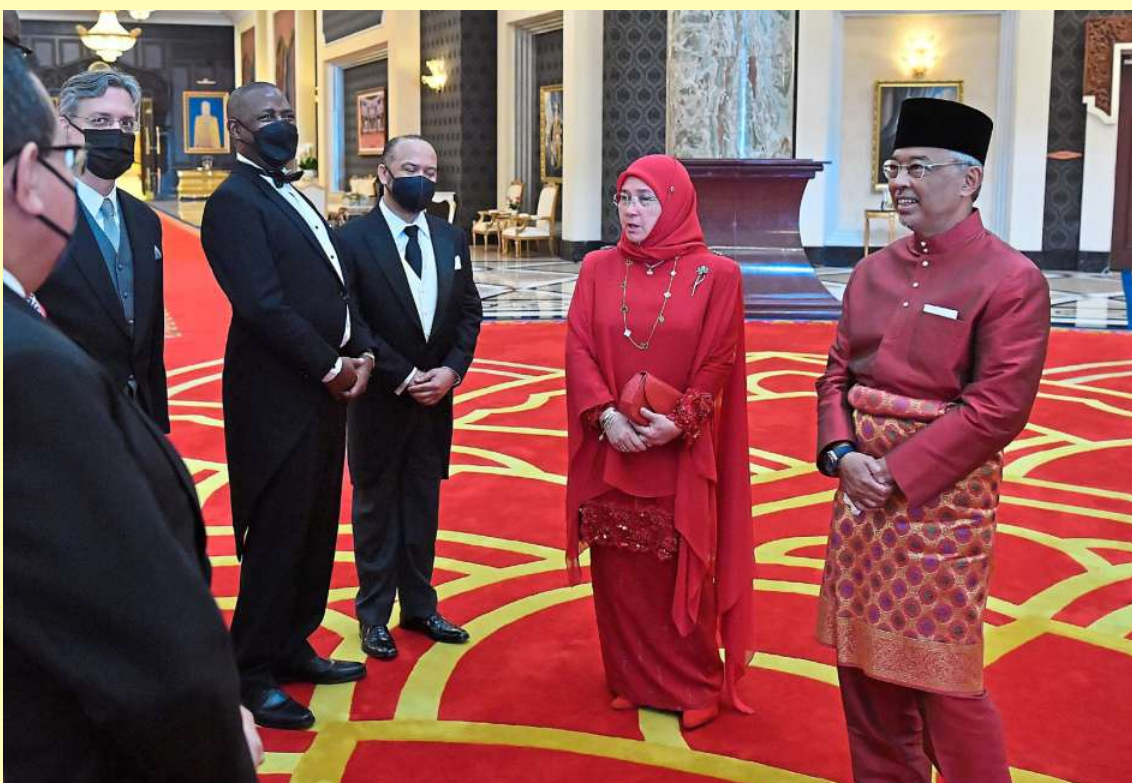
Sultan Abdullah and Tunku Azizah speaking with foreign envoys to Malaysia following an audience at Istana Negara, Kuala Lumpur, recently.

Shortly after becoming the Sultan of Pahang, Sultan Abdullah was chosen by the Conference of Rulers to become the 16th Yang di-Pertuan Agong.