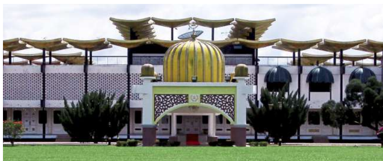
The front exterior of Istana Sultan Abu Bakar, Pekan, the official residence of the Pahang Ruler where royal ceremonies are held.

The Johor sultanate then took over Pahang but was attacked by Aceh. After Aceh's power subsided with the death of its sultan and absence of the descendants of the Sultan of Pahang, the region was