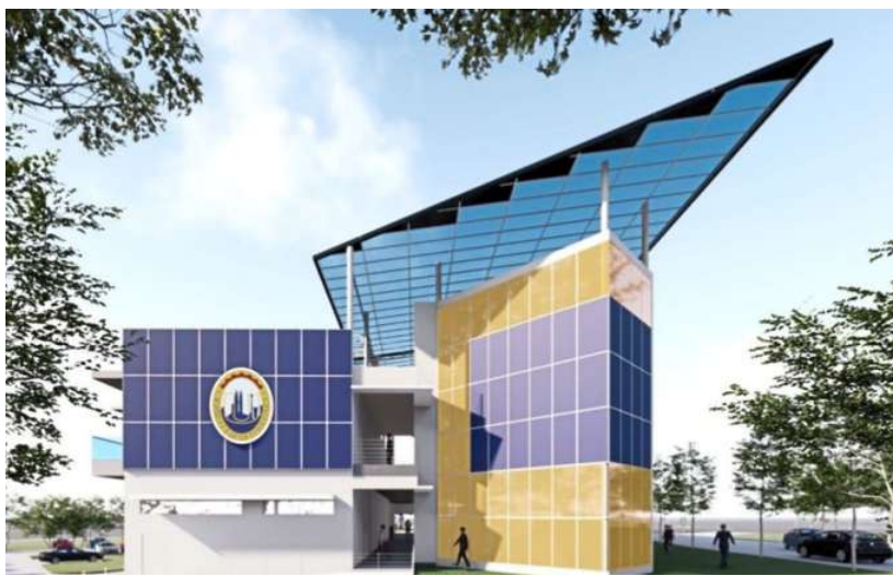
The UniKL-BMI programme aims to support the implementation of government programmes, improve capacity and knowledge, and address human capital needs in specific areas under EPP9.

The UniKL-BMI is offering an effective programme in sustainable energy called the Bachelor of Electrical Engineering Technology (Sustainable Energy) with Honours