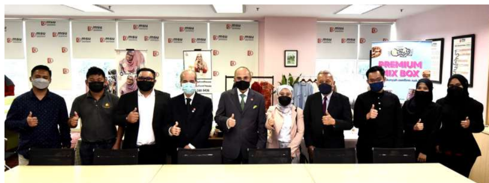
MINES ensures continuous valuable input for the start-up co-working space to thrive and its entrepreneur members to stay ahead.

■ For more information, contact the Engagement and Enrolment Department at 03-5521 6868 or go to www.msu.edu.my