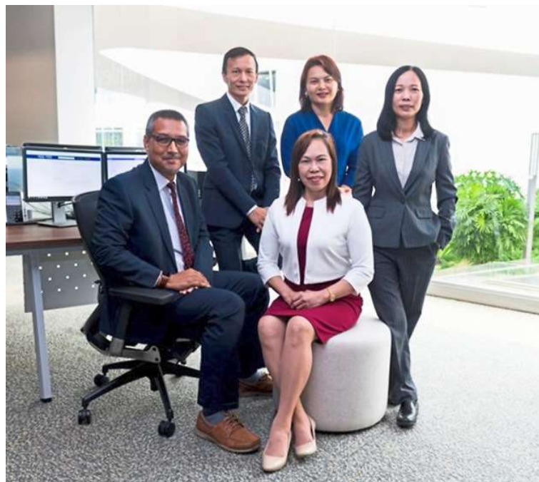
About 75% of Henley's dedicated and experienced academic staff have doctoral degrees.