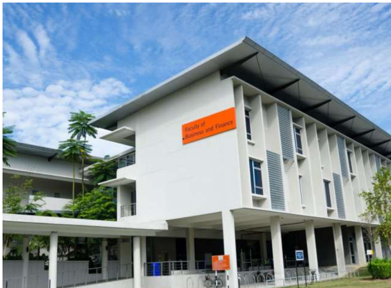
The exterior view of the Faculty of Business and Finance at UTAR's Kampar campus.

“Besides that, there are tremendous opportunities that can be exploited in other segments along the logistics value chain. The transformation of the logistics sector through the applications of technologies would create further competitive advantages for Malaysian players.