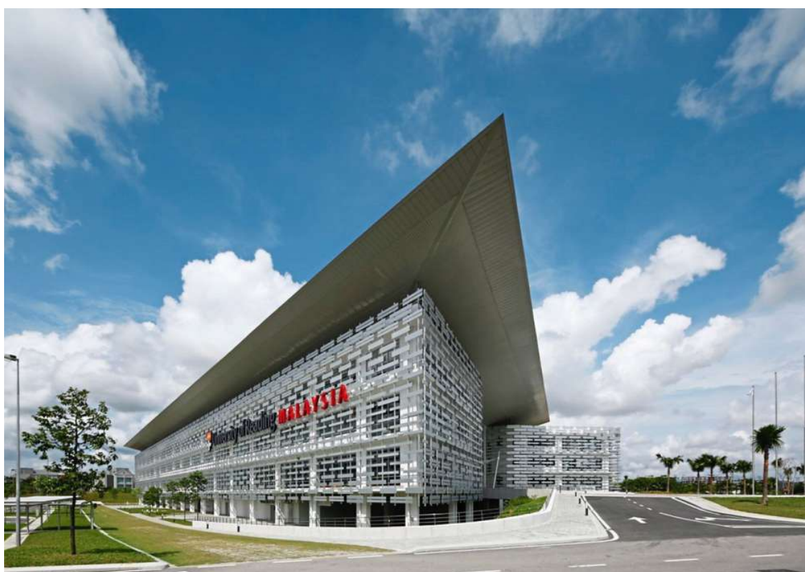
University of Reading Malaysia's state-of-the-art campus in EduCity, Iskandar Puteri.

AAA at A-level or STPM, 8As at UEC or the equivalent are awarded a discount of 30% off their first-year tuition fees.