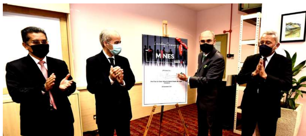
MINES is an incubation platform for MSUrian entrepreneurs from all walks of life.