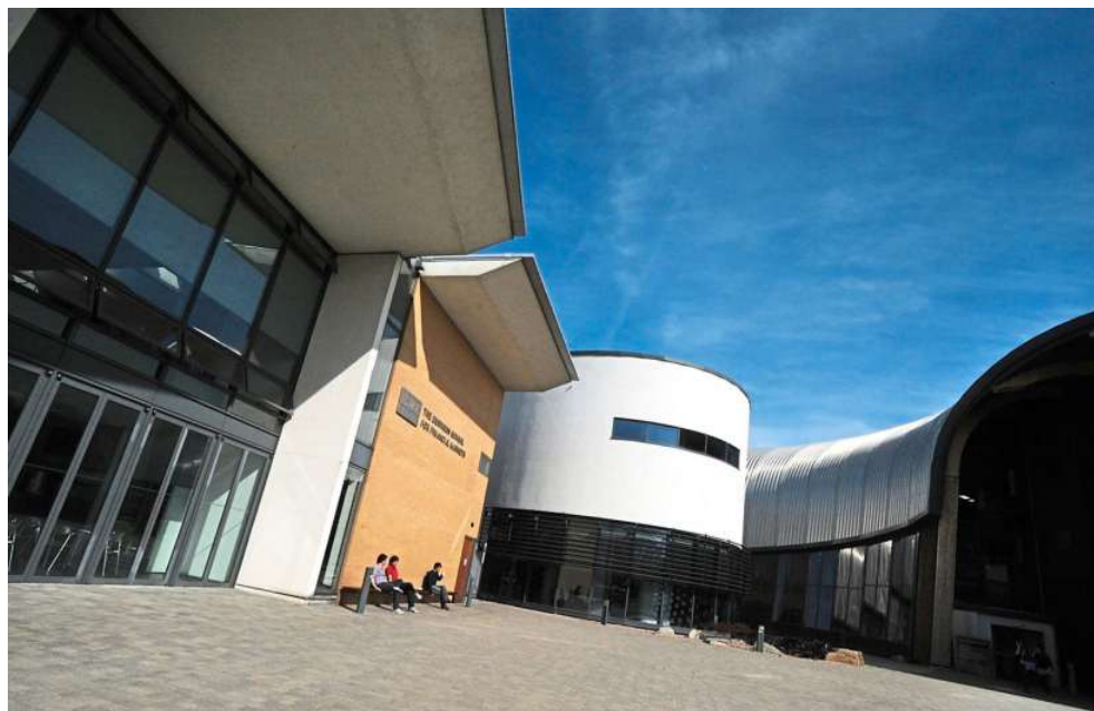
Henley Business School at the University's main campus in Reading, UK.