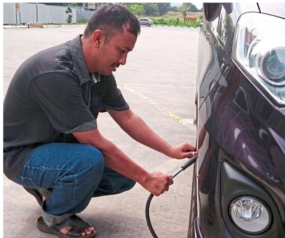
Ensure optimum tyre pressure.