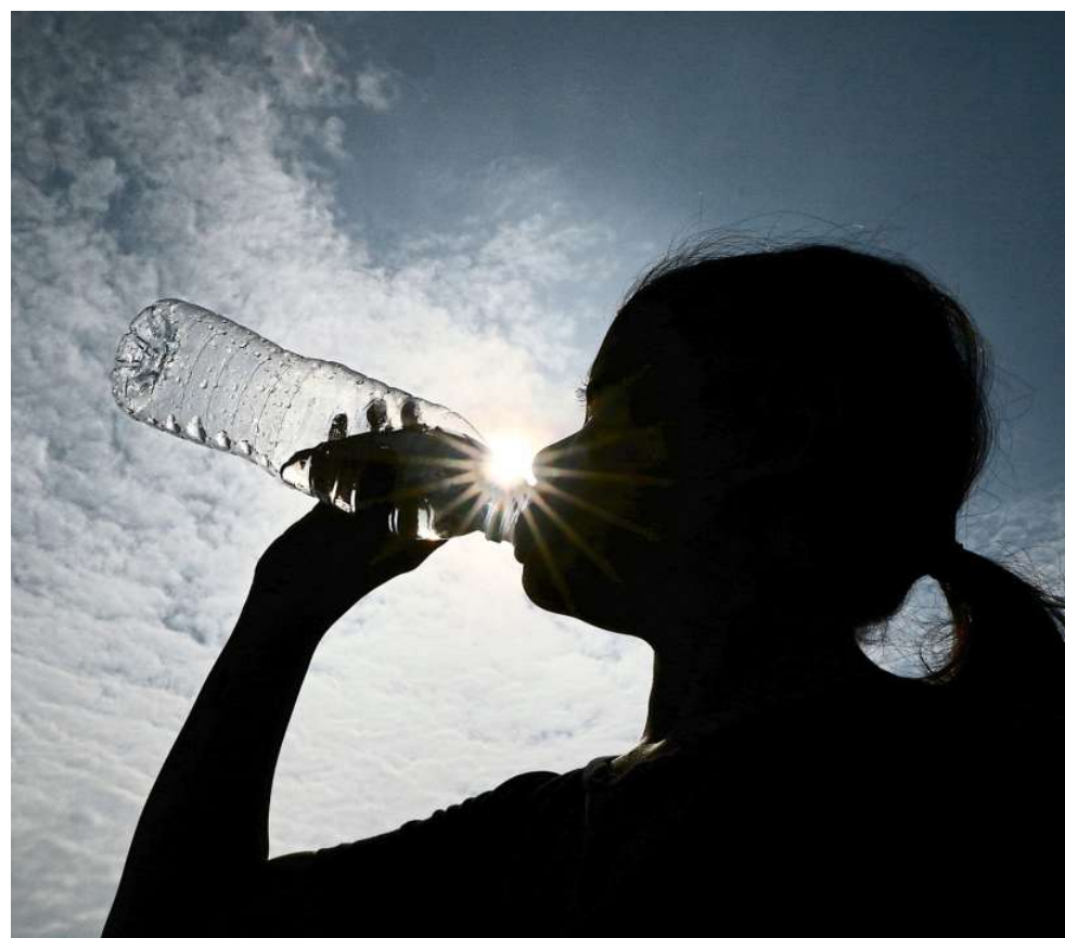
Quench your thirst to stay alert on the road.