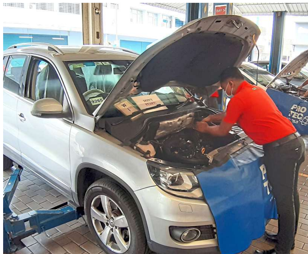
Check for correct coolant level by yourself or when servicing your car.