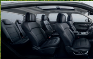
Spacious 3-Row Seating