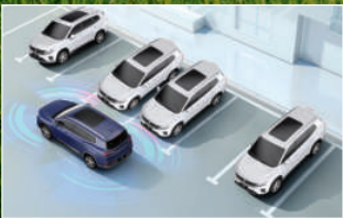
Auto Park Assist