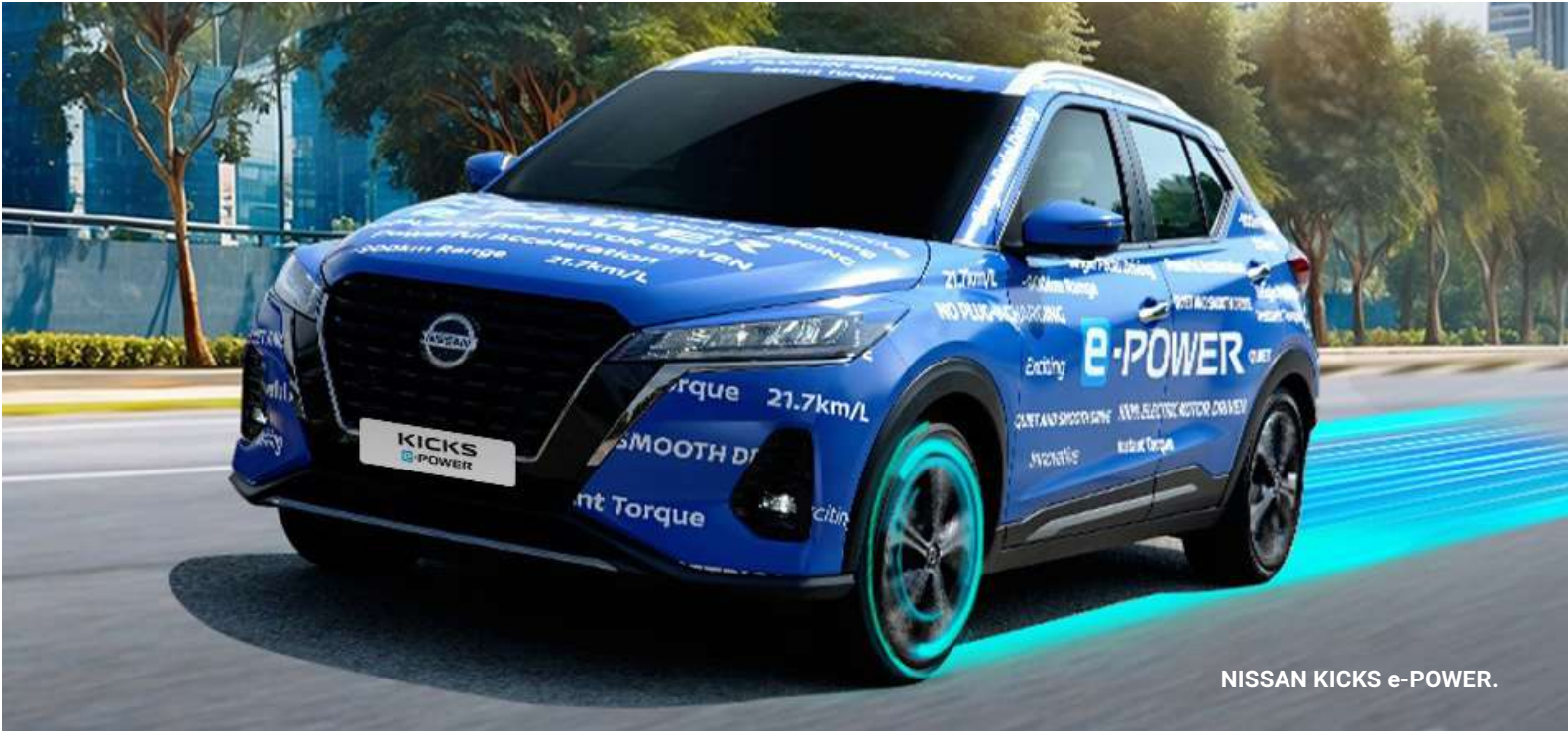
NISSAN KICKS e-POWER.