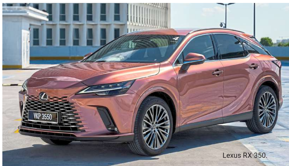
Lexus RX 350.