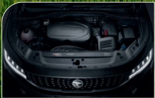
1.5L TGD i Engine with 48V Electric Motor Synergy System