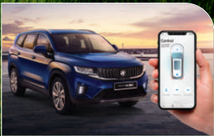
Remote Control via PROTON Link App