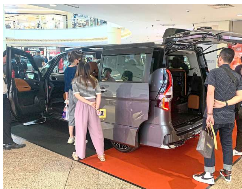
The crowd checking out some of the vehicles displayed at StarCarSifu Auto Show 2023 .

Stellantis dealer Allure Auto will showcase the recently launched all-electric Leapmotor C10 and provide test drives for the C10 and the Peugeot 408.