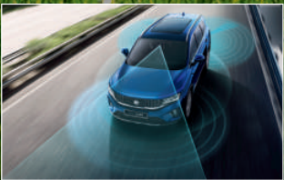
Advanced Driver Assistance System