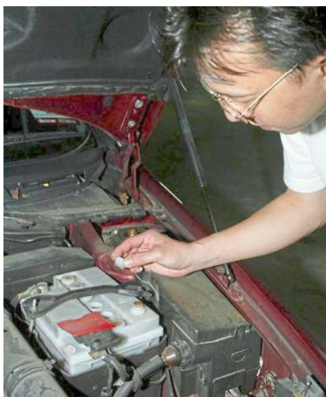
Inspect the battery to keep the electricals and air-cond humming.

If you notice that your car is struggling to get going, then your battery might be on the way out. If you have any concerns,