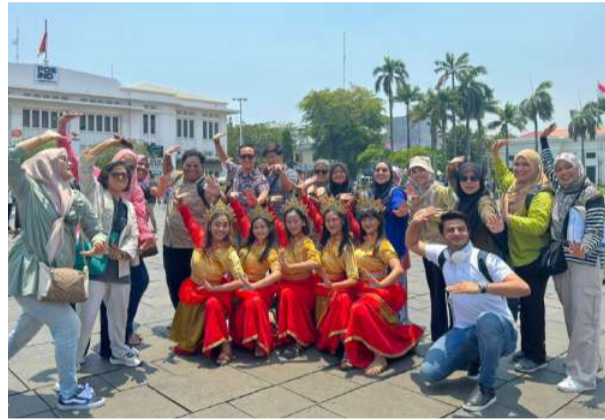
UUM students participating in experiential learning in Jakarta.

regions, serves as a testament to the programme's transformative impact. Graduates have consistently demonstrated exceptional leadership and entrepreneurial capabilities, contributing to the school's growing reputation as a hub for nurturing future business leaders. As OYAGSB continues to