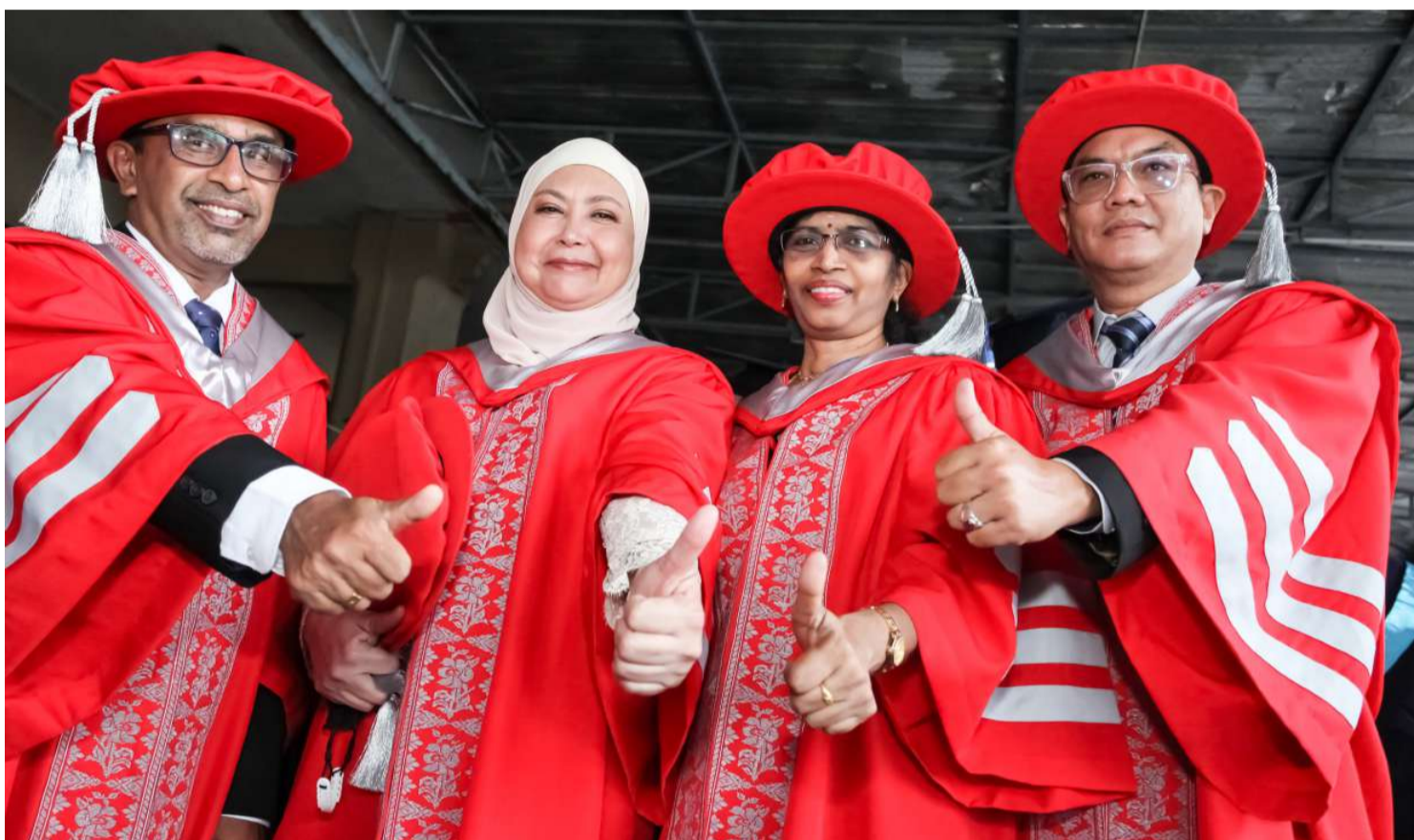
APEL enables working adults to leverage their prior work experience to fast-track their education.

Your career growth does not have to come at the expense of personal commitments.