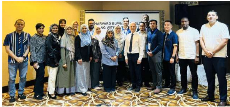
UUM offers students the opportunity to analyse and solve complex, real-world business problems through Harvard Business School case studies.

OYAGSB's MBA alumni network, which spans various sectors and