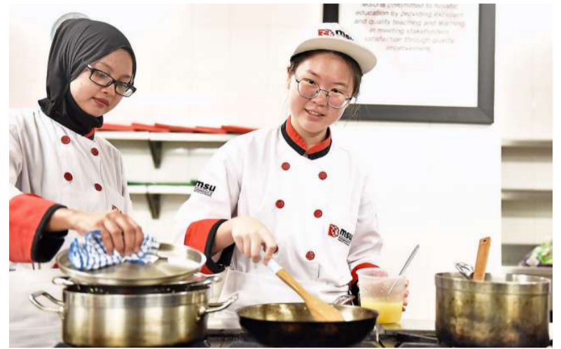
The Diploma in Culinary Arts provides students the opportunity to transform their passion for cooking into a professional skill.

■ For queries, call 03-5521 6868 or visit www.msucollege.edu.my