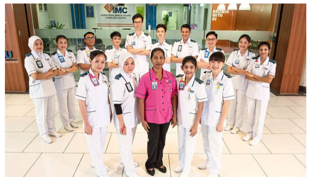
Start your career in nursing at IMC.

THE fast-growing healthcare industry in Malaysia despite the Covid-19 pandemic has caused a severe shortage of healthcare workers. Nurses, who are the backbone of any healthcare institution, have been severely affected.