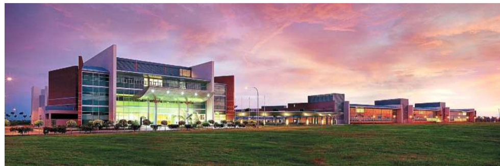
Curtin Malaysia is Curtin's largest global campus and hub in Asean.

Attractive scholarships are also available on the basis of academic merit and sibling discount for qualified students.