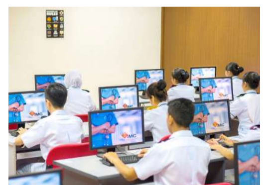
IMC supports hybrid learning, ensuring competent and quality graduates.

What differentiates IMC from other institutions is the clinical exposure students gain at both Pantai – Gleneagles Hospitals as well as government hospitals that contributes to