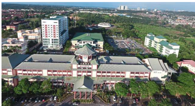
Southern UC's 13.2ha (32.5 acres) campus is located in Skudai, Johor Baru. It provides a well-equipped and supportive learning environment.

Similarly, distance learning has been successfully conducted with many educational institutions now offering online programmes to