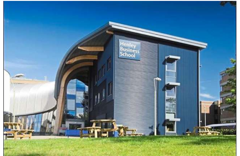
Henley Business School at the university's main Whiteknights campus in the UK.

Students also have access to the world-renowned Refinitiv financial database (formerly known as Thompson-Reuters Eikon).