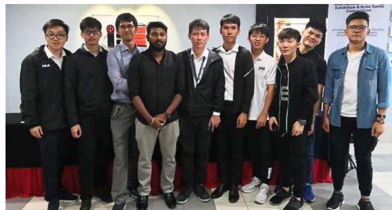
Southern UC students participating in the 22nd International Technology Exhibition and Robo Sumo Competition in August 2019.

These courses provide students not only with scientific theory and