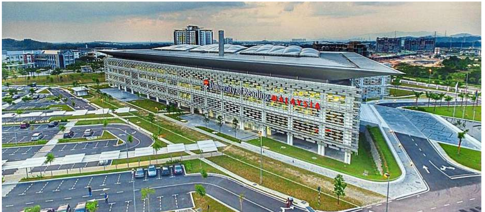
The University of Reading's international branch campus in Malaysia is located in EduCity Iskandar, Johor.

The BSc Finance and Business Management, hereafter referred to as FaBM (R/340/6/0485)(11/2024) (MQA/FA5216), is one of four degree programmes that are currently offered at Henley