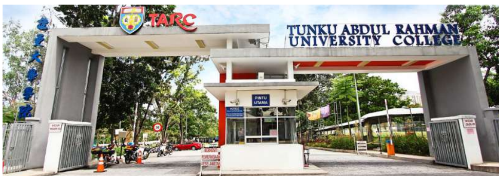
TAR UC's Foundation programmes are curated to prepare students effectively for transition to their respective bachelor's degree programmes and future challenges.

"I have always been fascinated with numbers. When I heard how strong TAR UC's Foundation programme was and its history of producing successful graduates annually, I