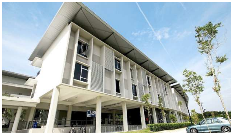
The exterior view of the Faculty of Business and Finance at UTAR's Kampar campus.

"Even after recovering from the pandemic,