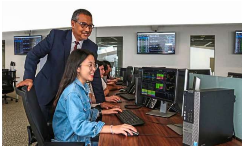
Henley's state-of-the-art Financial Dealing Room.

Business School Malaysia, with all of the modules developed in conjunction with subject matter experts at Henley's ICMA Centre.