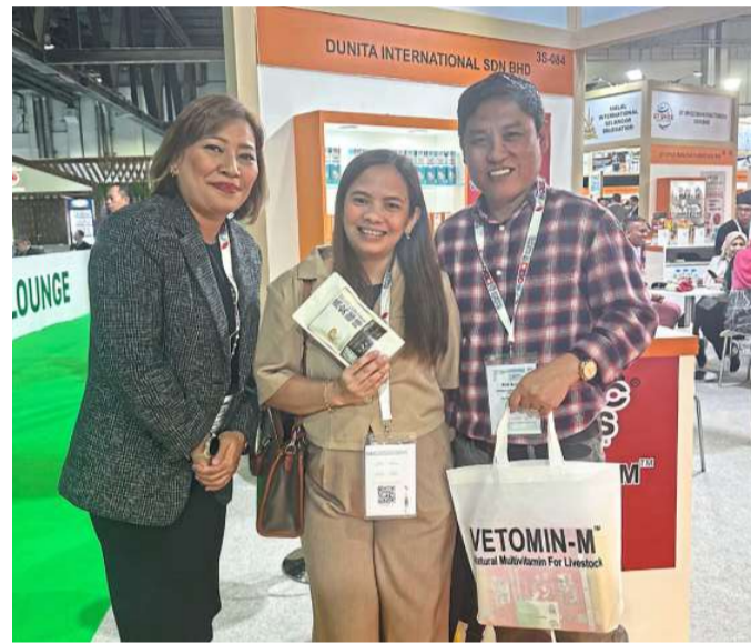
Dunita International Sdn Bhd Nature of business: Animal healthcare products Dunita International highlighting Vetominm, a pioneering natural animal healthcare solution for both felines and livestock.