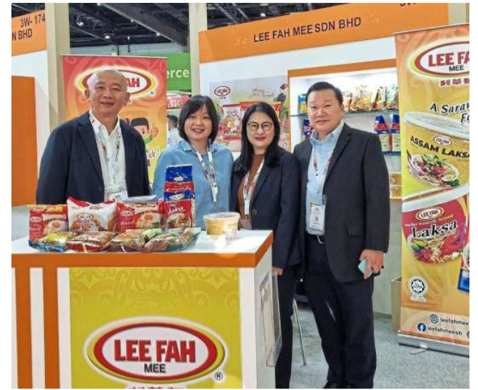
Lee Fah Mee Sdn Bhd Nature of business: Food manufacturer Lee Fah Mee, a Sarawak-based instant food manufacturer with a legacy spanning over 50 years, is now led by the fourth generation of the family. Committed to upholding the family tradition of quality and taste, it is actively working to expand the business globally, catering to diverse customer preferences around the world.