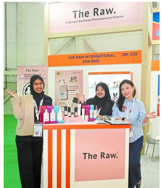
The Raw International Sdn Bhd Nature of business: Skincare backed by pharmaceutical science (cosmetics) The Raw, which earned high acclaim in Dubai, has set its sights on a breakthrough in the Middle Eastern market by 2027.