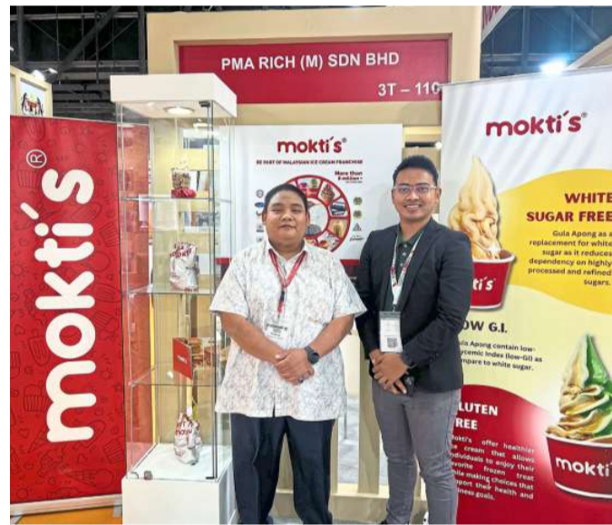
PMA Rich (M) Sdn Bhd Nature of business: F&B PMA Rich specialises in a delightful array of sweet treats, including creamy soft serves, rich gelatos and indulgent stick ice creams. With a focus on customisation, it has the ability to tailor flavours to suit individual preferences.