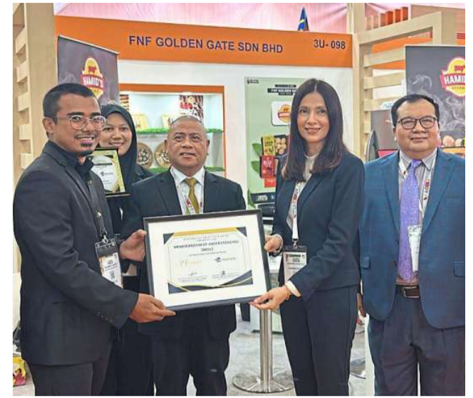
FNF Golden Gate Sdn Bhd Nature of business: Ready-to-cook food FNF Golden Gate showcasing Hamid Gourmets, offering ready-to-cook beef and chicken meatballs and koftas. Crafted with premium herbs and spices, these high-protein delights deliver exceptional taste and nutrition for the whole family.