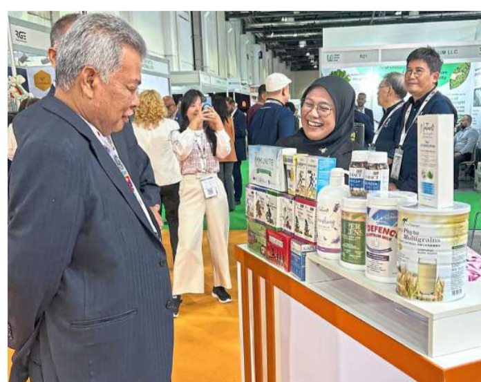
Heritage Index Sdn Bhd Nature of business: Health supplements Heritage Index offers essential health supplements that provide a natural source of daily nutrition.