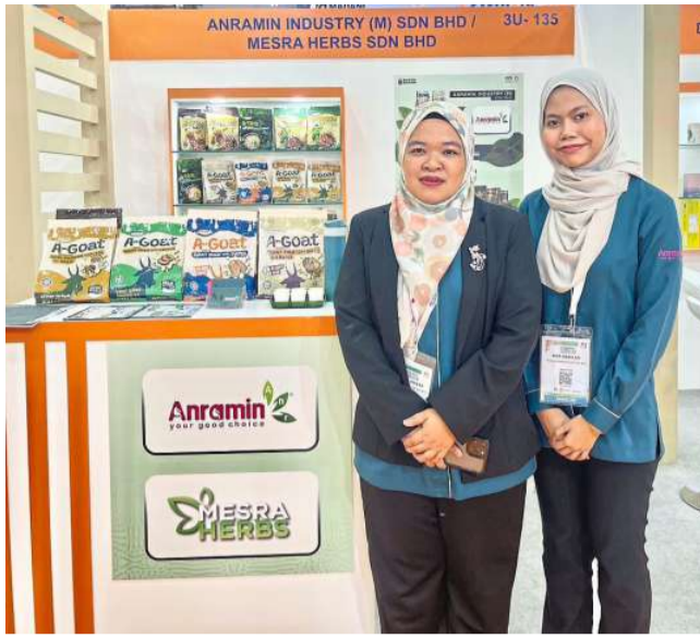
Anramin Industry (M) Sdn Bhd Nature of business: Premix instant drinks manufacturer Anramin proudly showcasing its signature premix drinks and goat milk, demonstrating innovation in the beverage sector while expanding its reach in international markets.