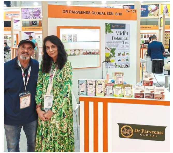
Dr Parveenss Global Sdn Bhd Nature of business: Midin botanical tea, functional black tea, functional coffee manufacturer Dr Parveenss Global offers a selection of authentic functional botanical teas, health black teas and functional coffees.