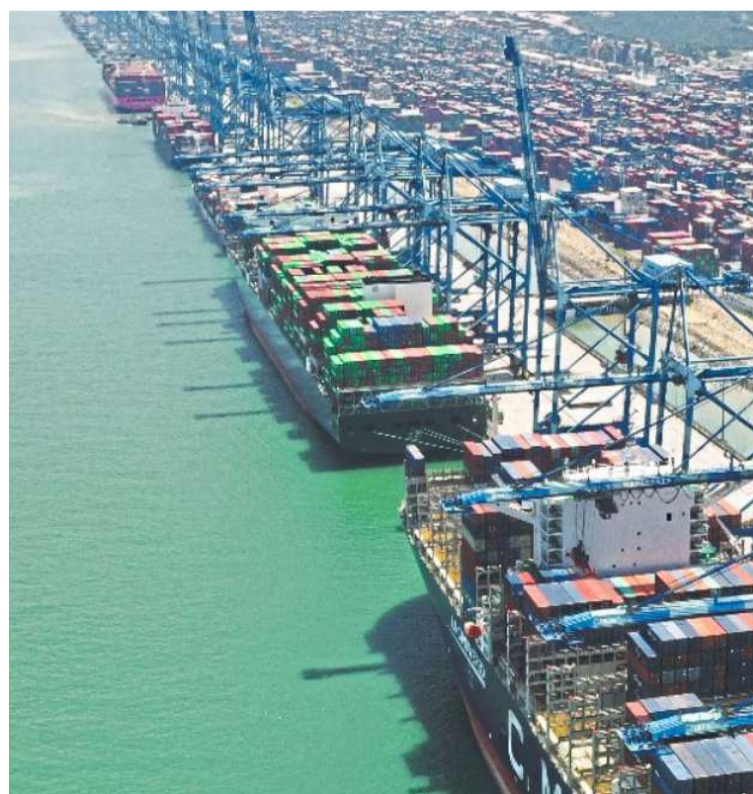
Westports Malaysia Sdn Bhd (formerly known as Kelang Multi Terminal Sdn Bhd)

Nature of business: Producer of naturally oxygenated mineral water With the tagline 'Premium Water, Affordable Price', Bubbles O2 is poised to become a leading premium mineral water brand, thanks to its unique properties and exceptional provenance.