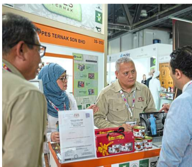
PPES Ternak Sdn Bhd – SEDC Nature of business: State-owned statutory body established to promote both commercial and social development in Sarawak. From Borneo to Dubai, SEDC Sarawak set its sights on the global halal market with its presence at one of the world's most prominent international trade exhibitions, Mihas@Dubai. This marked a strategic move to position Sarawak as a key player in the global halal industry.