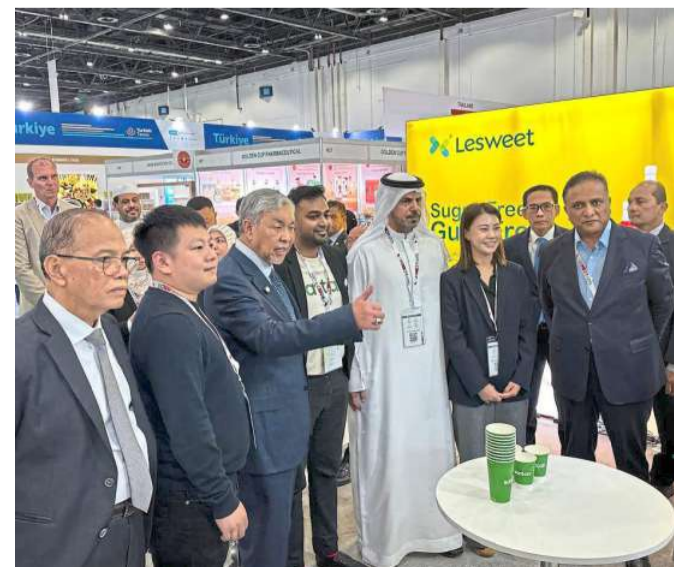
Rokki Sdn Bhd Nature of business: Freeze-dried coffee and tea, ready-to-eat meals, airlines F&B, food service solutions provider The Santan Restaurant team welcoming Deputy Prime Minister Datuk Seri Dr Ahmad Zahid Hamidi (third from left), Pahang Menteri Besar Datuk Seri Wan Rosdy Wan Ismail (left) and Matrade chairman Datuk Seri Reezal Merican Naina Merican (right) to their booth. Santan Restaurant Sdn Bhd offers a delightful dining experience, serving high-quality food, aromatic coffee, and exceptional value for money.