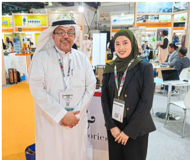
Eartheories Sdn Bhd Nature of business: Aromatherapy and personal care product manufacturer A representative from Eartheories engaging with a visitor at Mihas@Dubai 2024. The company, a leader in natural wellness solutions, showcased its innovative products, demonstrating its commitment to bringing the benefits of nature to people worldwide.