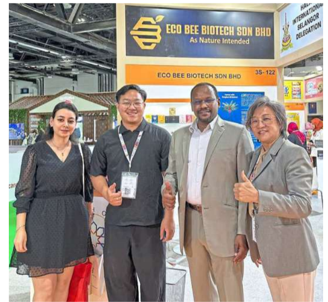
Eco Bee Biotech Sdn Bhd Nature of business: Manufacturing honey bee products Eco Bee Biotech is a leading company specialising in premium bee-derived food products.