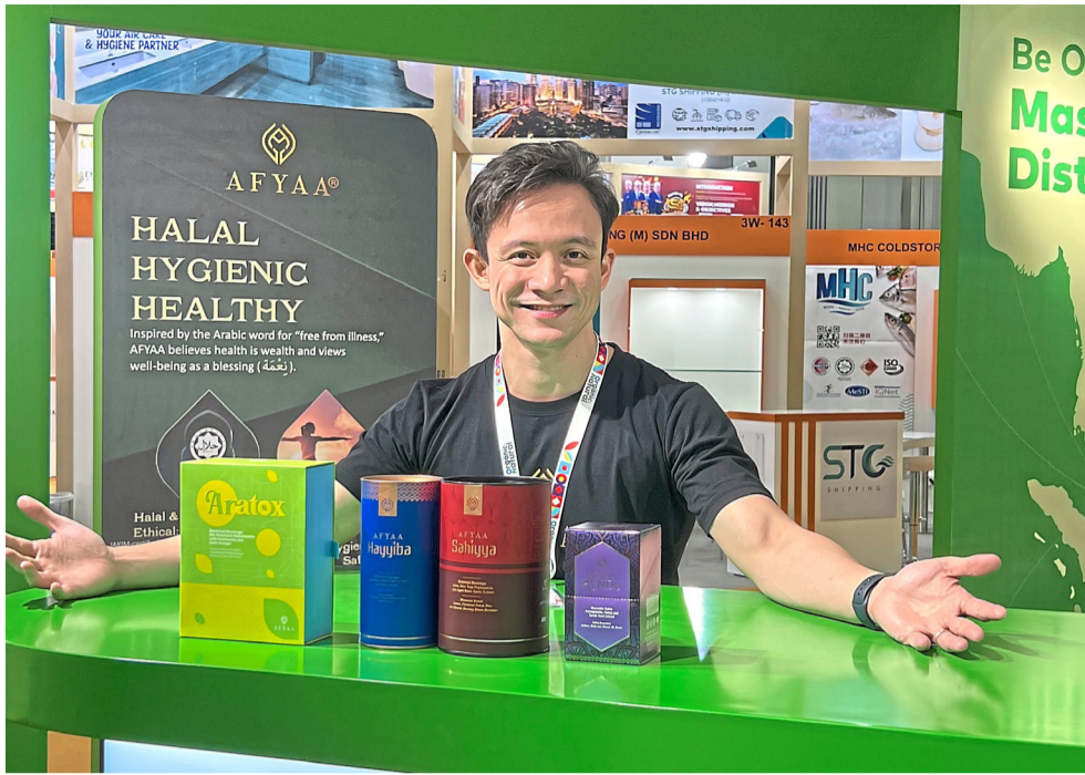
Afyaa Sdn Bhd Nature of business: Functional health foods and supplements Afyaa's nutritionist showcasing Afyaa's range of halal-certified functional foods in Mihas@Dubai 2024, crafted with sunnah ingredients to promote global wellness and innovation.