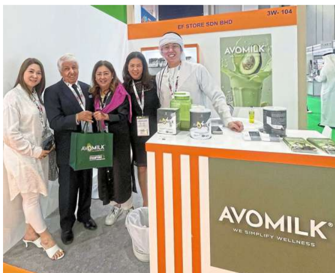
EF Store Sdn Bhd Nature of business: E-commerce organic and natural F&B platform EF Store is an e-commerce platform that specialises in organic and natural products, focusing primarily on food and beverage. Its flagship product, Avomilk by Xiaohealthy, is tailored for families. Avomilk is a nutritious meal replacement beverage suitable for individuals aged one and older. EF Store's commitment lies in simplifying wellness and promoting a healthy lifestyle for the entire family.