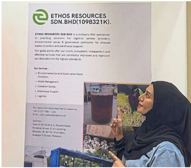
Ethos Resources Sdn Bhd Nature of business: Logistics service solutions provider, environmental social and governance contractor for disposal waste collection and warehouse support Ethos Resources is a leading provider specialising in logistics and waste management solutions.