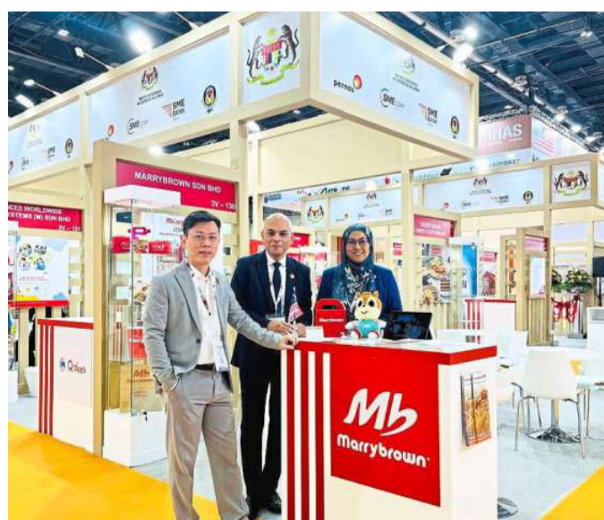
Marrybrown Sdn Bhd Nature of business: Fast food Marrybrown is seeking international franchisees to expand the brand into new countries through multiple unit development agreements with suitable business partners.