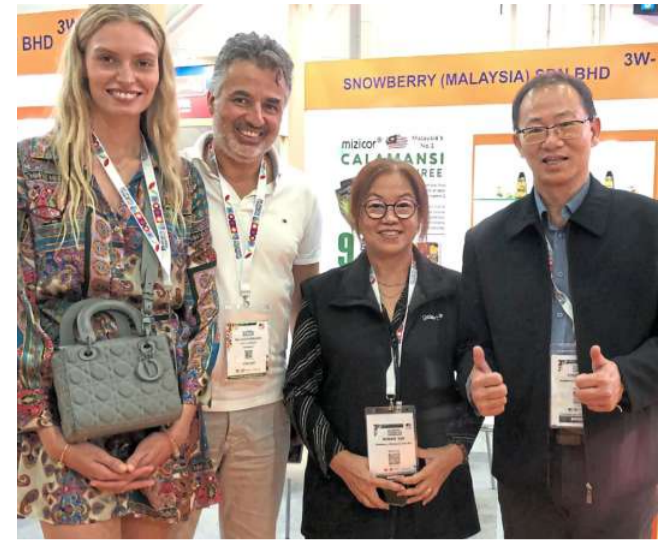
Snowberry Malaysia Sdn Bhd

Nature of business: Pineapple products and food supplements SLRH Discovery brings the taste of farm-fresh pineapples straight to your table, delivering unmatched freshness in every juicy bite. The company also proudly introduces Malaysia's first Stomach Comfort Meal Replacement, crafted by expert nutritionists to support your health with every sip.