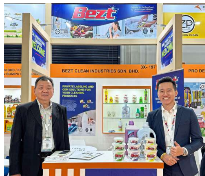
Bezt Clean Industries Sdn Bhd Nature of business: Manufacturer of dishwashing paste and other household cleaning products Bezt is a leading manufacturer of premium household cleaning products, offering high-quality detergents to customers worldwide.