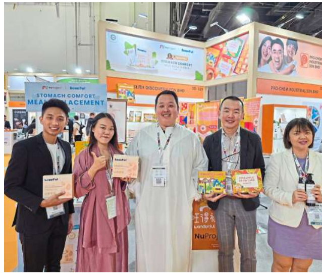
SLRH Discovery Sdn Bhd

From a local favourite to a global sensation, Pasta Port impressed visitors at Mihas@Dubai. Founded by a group of passionate pasta enthusiasts from Penang, this homegrown brand is keen to share its love for pasta with the world.