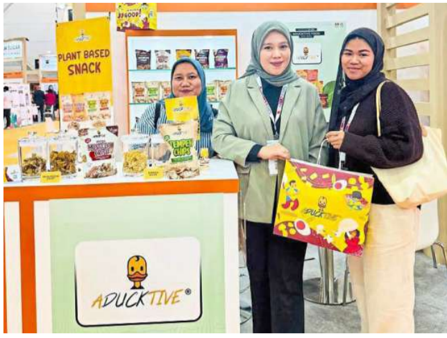
Aducktive Food Sdn Bhd Nature of business: Snack food manufacturer Established in 2019, Aducktive's journey began when cravings for the perfect salted egg snack went unmet. Starting from humble beginnings in a home kitchen, the brand created its signature #seriouslyAducktive snack. The name "Aducktive" is a blend of "duck egg yolk" and "addictive". Aducktive invites snack lovers to say goodbye to ordinary treats and embark on a flavourful journey to spice up their taste buds.