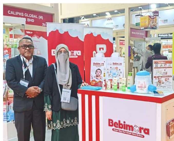
Caliphs Global (M) Sdn Bhd Nature of business: Producing high-quality baby diapers and baby care natural products BebiMora is a leading local brand specialising in natural baby care products thoughtfully designed for infants. The company offers a range of plant-based essentials, including chlorine-free diapers, soothing lotions, tummy oil and baby wet wipes, all crafted with the well-being of babies in mind.