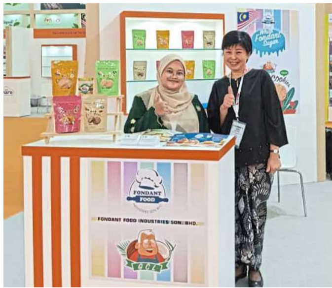
Fondant Food Industries Sdn Bhd Nature of business: Food manufacturer Crafted from freshly grated coconut and baked to perfection, Fondant Food's scrumptious coconut cookies are available in both original and cashew nut variations.