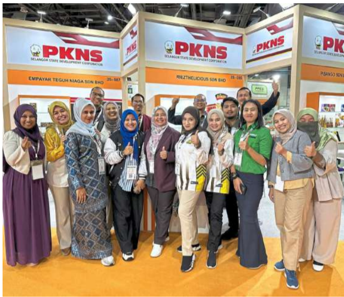
Pisango Sdn Bhd Nature of business: Banana-based food products Pisango specialises in banana-based food processing, offering innovative solutions through kiosks, frozen products, and a variety of flavourful banana chips, delivering a unique twist on this versatile fruit.