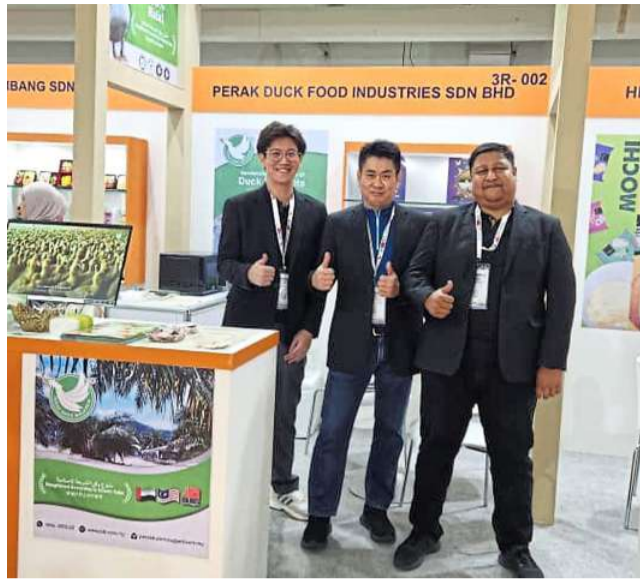
Perak Duck Food Industries Sdn Bhd Nature of business: Poultry The Perak Duck Food Industries team showcasing their products at Mihas@Dubai. Specialising in producing high-quality duck products, the company was founded to process cultivated ducks for both domestic and international markets.