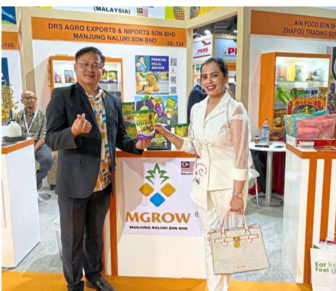
Manjung Naluri Sdn Bhd Nature of business: Agricultural produce Manjung Naluri introduced the first Low GI Ananas Granola Bites to the halal market. These innovative granola bites are halal-certified and meet rigorous quality standards, including ISO 22000, HACCP, GMP, MeSTI, and ISO 9001. The company recently showcased its products at Mihas@Dubai, successfully connecting with potential buyers throughout the Middle East.