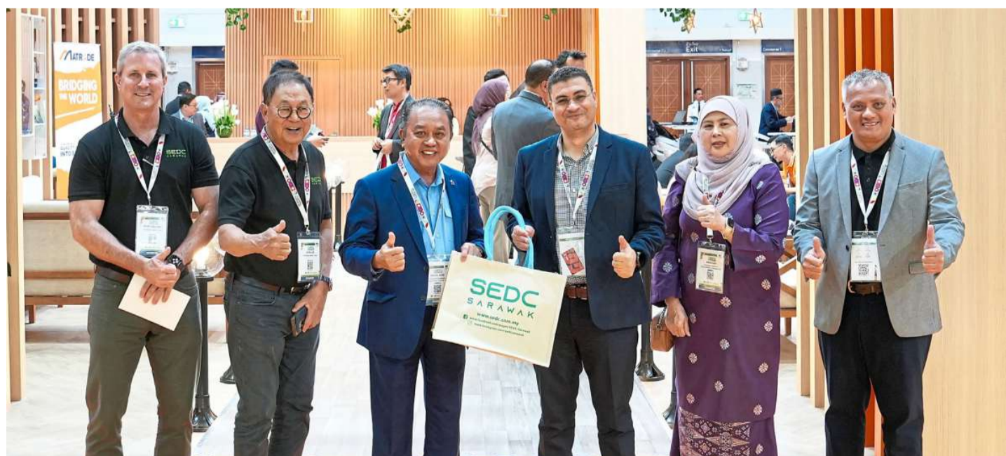
Rosewood Station - SEDC Nature of business: State-owned statutory body established to promote both commercial and social development in Sarawak From Borneo to Dubai, SEDC Sarawak set its sights on the global halal market with its presence at one of the world's most prominent international trade exhibitions, Mihas@Dubai. This marked a strategic move to position Sarawak as a key player in the global halal industry.