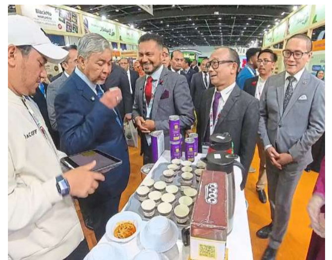
Brain Story Sdn Bhd Nature of business: Functional food manufacturer Deputy Prime Minister Datuk Seri Dr Ahmad Zahid Hamidi (second from left) enjoying a sip of Dacoff, a unique date seed coffee from Brain Story. The innovative company achieved remarkable success at Mihas@Dubai, generating an impressive US$200,000 (RM890,000) in sales from nine Middle Eastern buyers in just one day.