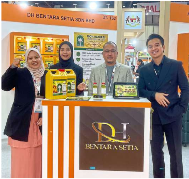
DH Bentara Setia Sdn Bhd Nature of business: Palm oil products DH Bentara Setia is a trusted supplier of palm oil products and cooking oil, renowned for its commitment to quality and reliability.