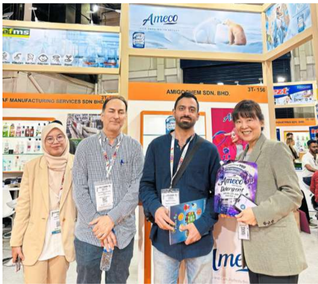
Amigochem Sdn Bhd Nature of business: Manufacturer of liquid laundry detergent Ameco is committed to creating high-quality, hygienic laundry care solutions that align with global standards. With exceptional cleaning performance and trusted hygiene, their products bring innovation and care to families worldwide.