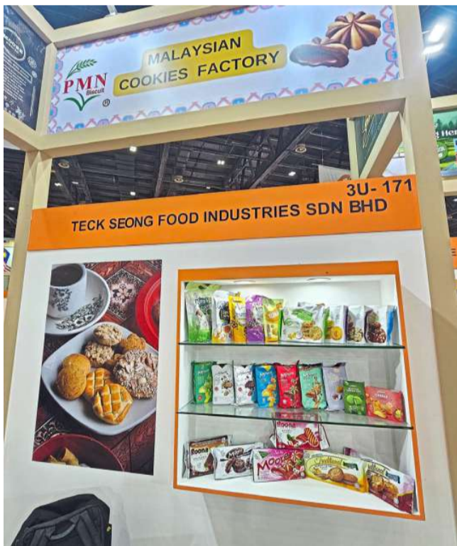
Teck Seong Food Industries Sdn Bhd Nature of business: Halal cookies and snacks Teck Seong Food Industries proudly showcasing its PMN Biscuit products at Mihas@Dubai, offering a delicious taste of Malaysia to the global stage.