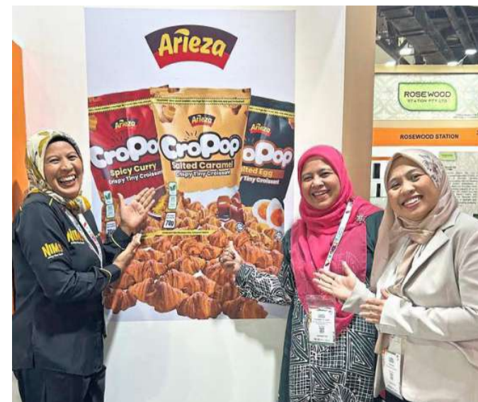
Riezthelicious Sdn Bhd Nature of business: Snacks and confectionery Arieza has introduced Cropop, a unique snack that combines the shape of a croissant with a variety of flavours. These bite-sized treats offer a crunchy, light and flavourful experience. Cropop aims to stand out in the snack market by blending traditional and modern flavours, making it a fun and convenient snack option.