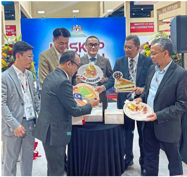
Cheeseu Bistro Sdn Bhd Nature of business: F&B Cheeseu unveiled its latest creation, a creamy and delectable Musang King Durian Cheesecake, at Mihas@Dubai 2024.