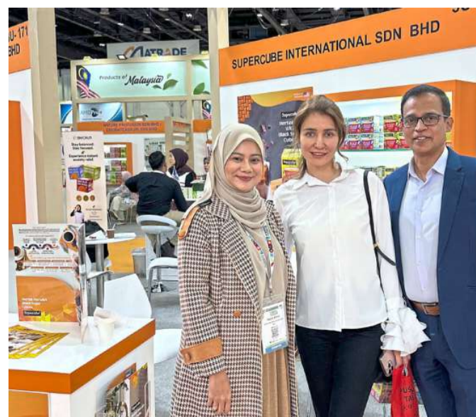
Supercube International Sdn Bhd

Nature of business: Herbal drinks, herbal tea, functional beverage, natural supplement beverage Supercube No.1 Tea Cubes introduce innovation in tea consumption, offering a fresh and unique experience. Made from 100% natural ingredients, these tea cubes are caffeine-free, making them a healthy option.