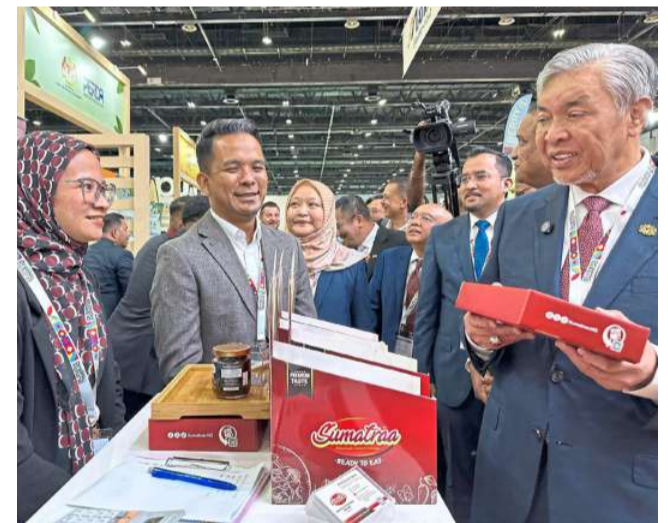
Sumatraa Industries Sdn Bhd

Nature of business: Total logistics provider STG Shipping is committed to delivering fast, reliable and efficient shipping solutions. Established in 2020, the company offers advanced supply chain solutions, including warehousing, transportation and transloading.