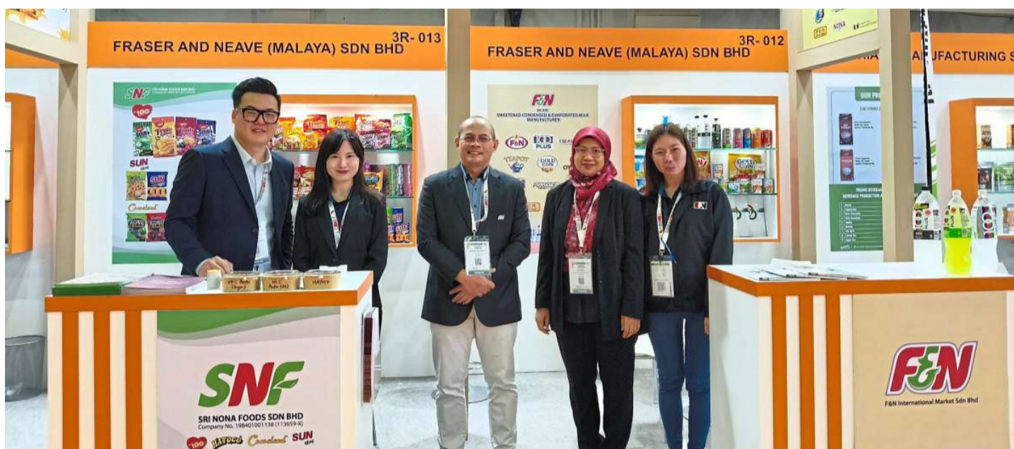
Fraser and Neave (Malaya) Sdn Bhd Nature of business: F&N, a leading beverage manufacturer, boasts top brands like 100Plus, F&N Season, F&N Ice Mountain and Oyoshi. Dominating the sweetened condensed and evaporated milk markets, it has expanded its product range through Sri Nona. F&N also offers confectionery products such as Lot 100 Gummy and Koko Jelly, OEM services and culinary items like ketupat and cooking sauces.