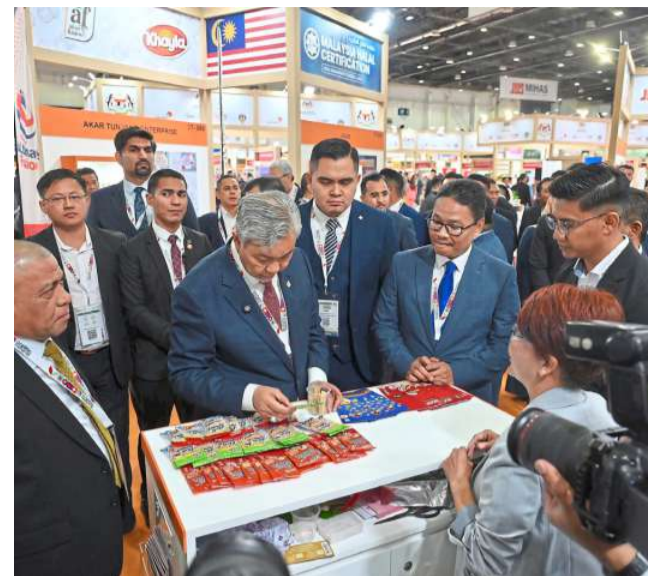
QL Foods Sdn Bhd Nature of business: Surimi and surimi-based products such as fishball, fish cake, fish tofu, imitation crabstick and fish snack QL Foods introducing its new lekor nipis concept to Deputy Prime Minister Datuk Seri Dr Ahmad Zahid Hamidi (centre), aiming to bring this traditional Malaysian fish product to a global audience.