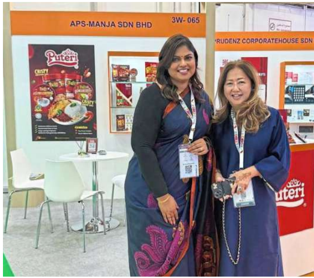
APS-Manja Sdn Bhd Nature of business: Manufacturing food-related products, transportation, merchant trading, agro farming and training providers APS-Manja strives to deliver hygienic, safe and diverse products infused with authentic Malaysian flavours, taking them to the world stage.