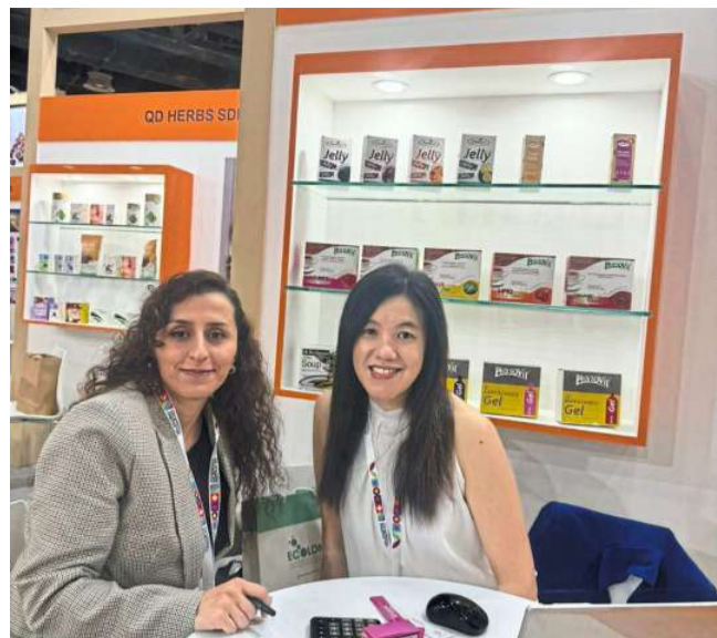
QD Herbs Sdn Bhd Nature of business: Pharmaceutical manufacturer Key members of the QD herbs team at Mihas@Dubai. With over 25 years of expertise in the industry, QD Herbs has established itself as a leading original equipment manufacturer (OEM) specialising in traditional herbs and health supplement products.