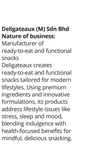
Deligateaux (M) Sdn Bhd Nature of business: Manufacturer of ready-to-eat and functional snacks Deligateaux creates ready-to-eat and functional snacks tailored for modern lifestyles. Using premium ingredients and innovative formulations, its products address lifestyle issues like stress, sleep and mood, blending indulgence with health-focused benefits for mindful, delicious snacking.