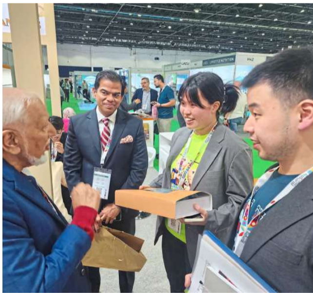
Ghee Hiang Manufacturing Co Sdn Berhad Nature of business: Pure sesame oil, chocolate chip cookies and traditional Chinese pastries manufacturer With a legacy spanning 167 years, Ghee Hiang continues to delight with its premium sesame oil and delectable cookies.