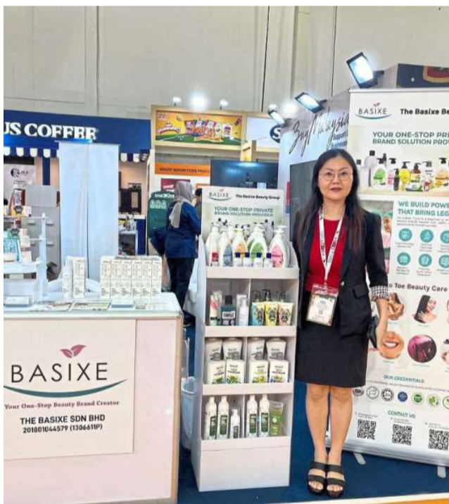
The Basixe Sdn Bhd Nature of business: Beauty cosmetics original design manufacturing/ original equipment manufacturing (ODM/OEM) The Basixe is an innovative one-stop solution in natural, top-to-toe beauty care, offering a diverse range of products including toiletries, hair care, baby care, oral care, skincare, perfumery, beauty and health foods.