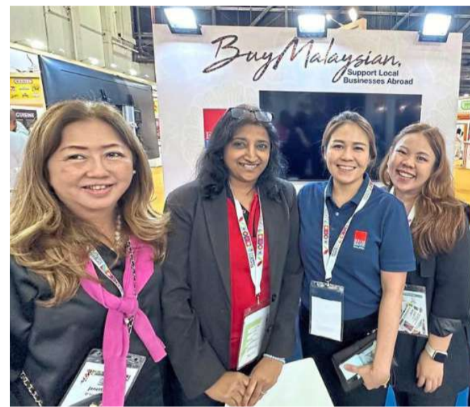
Spice Kingdom Sdn Bhd

Nature of business: Manufacturing spices Spice Kingdom is a leading manufacturer of high-quality spice powders, elevating culinary experiences with its aromatic blends and authentic flavours.