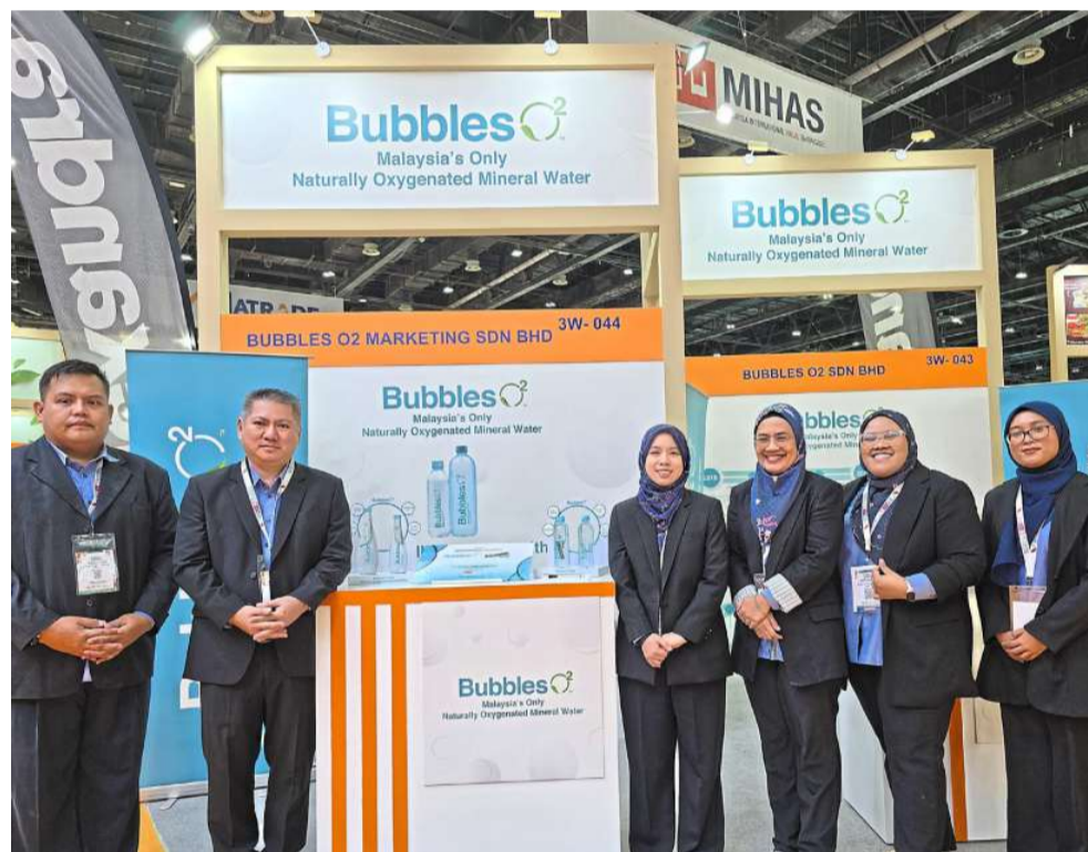
Bubbles O2 Sdn Bhd

Nature of business: Distribution of naturally oxygenated mineral water Bubbles O2 Marketing signed a Memorandum of Agreement with distributor partner Richiamo Coffee and Queen of Nature Group (UAE local) at Mihas@Dubai.