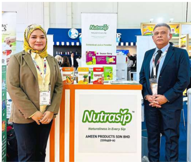
Ameen Products Sdn Bhd Nature of business: Beverage manufacturer Ameen Products unveils Nutrasip, a premium collection of botanical products thoughtfully crafted to enhance well-being. Each product is infused with scientifically proven botanical extracts known for boosting cognitive health and vitality. Experience the perfect blend of nature and science with Nutrasip.