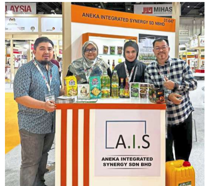
Aneka Integrated Synergy Sdn Bhd Nature of business: F&B The Aneka Integrated Synergy team showcased a wide range of SiTi brand products, including cream crackers, corn crackers, sweet soy sauce and chilli sauce.