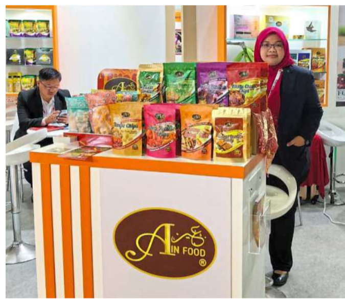
Ain Food Sdn Bhd Nature of business: Manufacturing, distribution and agriculture Known for its core business in snack processing and distribution, Ain Food has successfully expanded into the agricultural sector.