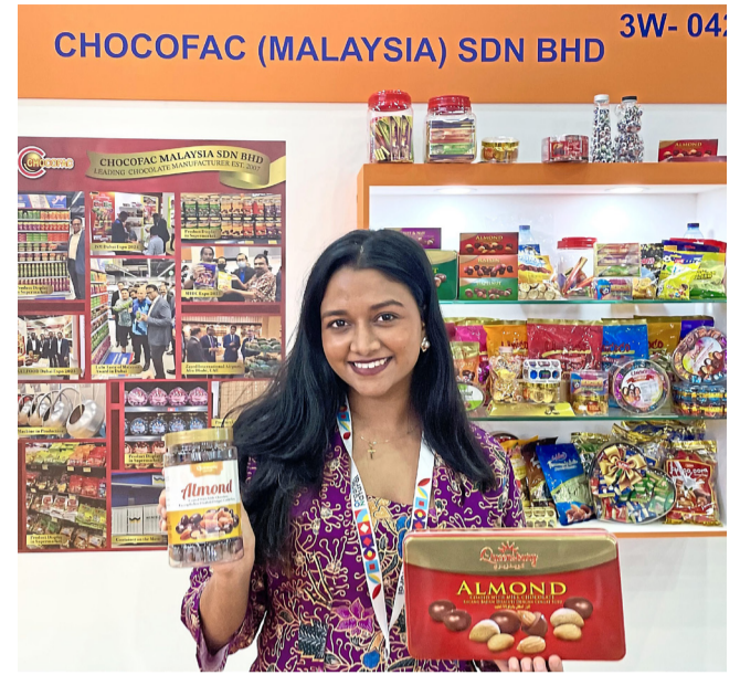
Chocofac (Malaysia) Sdn Bhd Nature of business: Chocolate manufacturer A leading chocolate manufacturer, Chocofac Malaysia showcases an extensive range of halal-certified chocolate products.