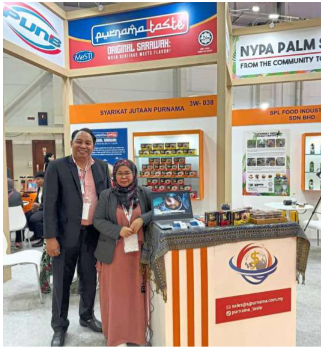
Syarikat Jutaan Purnama Nature of business: Manufacturing dry noodles Syarikat Jutaan Purnama proudly introducing Sarawak's heritage products to the Middle East, showcasing local delicacies like Purnama Taste Dry Noodles' Mi Kolok, Mi Pok and Mi Kampua. This initiative marks a bold step in promoting homegrown brands on the global stage and driving international growth.