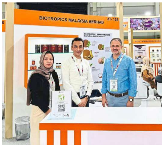
Biotropics Malaysia Bhd Nature of business: Nutraceutical ingredients and health supplements manufacturer Biotropics Malaysia offers premium, nutraceutical ingredients and health supplements tailored for the Middle Eastern market.