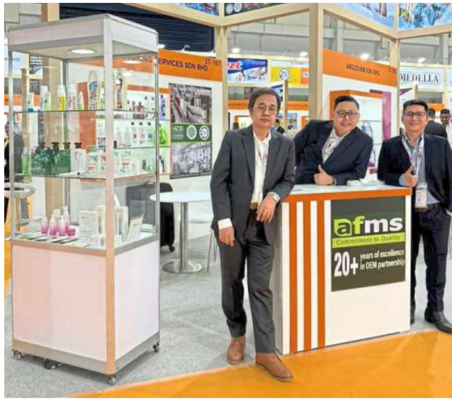
AF Manufacturing Services Sdn Bhd Nature of business: OEM/ODM for personal care and cosmetics products AF Manufacturing Services provides a comprehensive range of OEM solutions for cosmetics and personal care products, catering to the diverse needs of its customers.