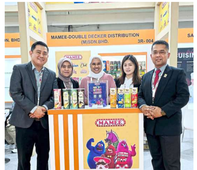
Mamee-Double Decker Distribution (M) Sdn Bhd Nature of business: Manufacturing and distribution of snack foods and beverages Mamee-Double Decker stands out as one of Asean's most unique snack and beverage companies. Its journey began with a bold mission to spread joy through unforgettable food experiences.