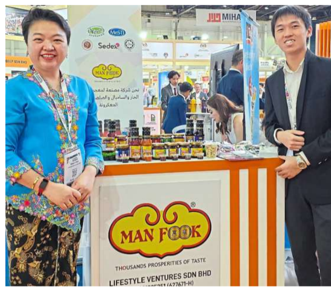
Lifestyle Ventures Sdn Bhd Nature of business: Sambal, sauces and noodle seasoning manufacturer Lifestyle Ventures, a pioneer in vegan sauces, is certified with Food Safety System Certification (FSSC) 22000, as well as halal and vegan certifications. The company specialises in crafting fresh Peranakan sauces and pastes while utilising solar energy to promote sustainable production practices.