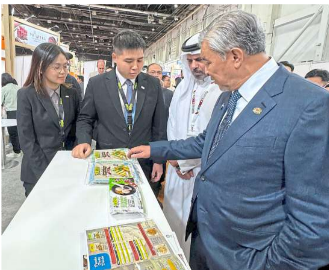
Bumimas Food Manufacturing Sdn Bhd Nature of business: Halal frozen food manufacturer Bumimas Food is a global leader in Asian halal frozen foods, offering products such as roti paratha, naan and spring roll pastries. As a trusted partner, Bumimas is certified by the Malaysian Islamic Development Department (Jakim) for its commitment to quality and halal standards.