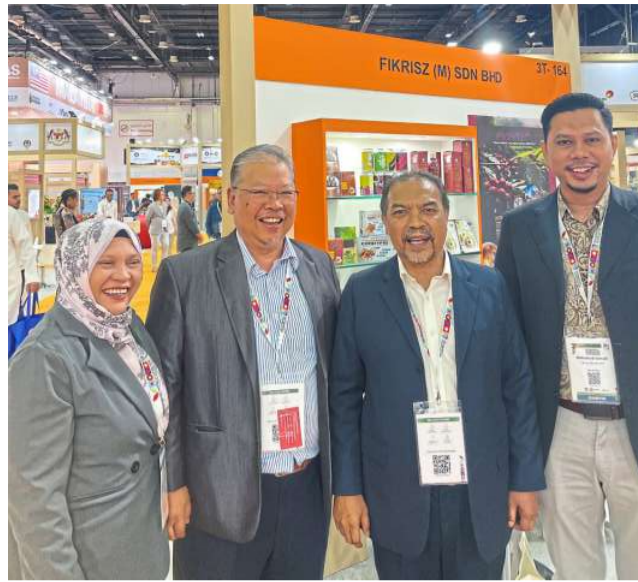
Fikriz (M) Sdn Bhd Nature of business: F&B manufacturer Fikriz has been a leading provider of halal and organic instant premix drinks since 1999. The company's mission is to promote health and wellness by offering convenient and nutritious beverage solutions.