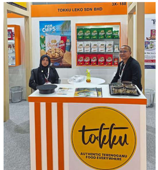
Tokku Leko Sdn Bhd Nature of business: Food manufacturer Tokku Leko, a renowned keropok manufacturer, brought authentic Malaysian snacks to Dubai with the aim of expanding into the Middle Eastern market.