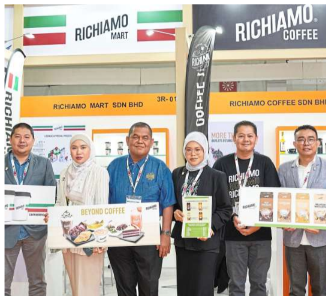
Richiamo Coffee Sdn Bhd Nature of business: Coffee shop chain Richiamo Coffee is a premium coffee shop chain offering over 20 different coffee varieties, expertly blended to satisfy even the most discerning coffee connoisseur. In addition to its coffee offerings, it also provides a selection of delectable pastries, cakes and local delicacies.