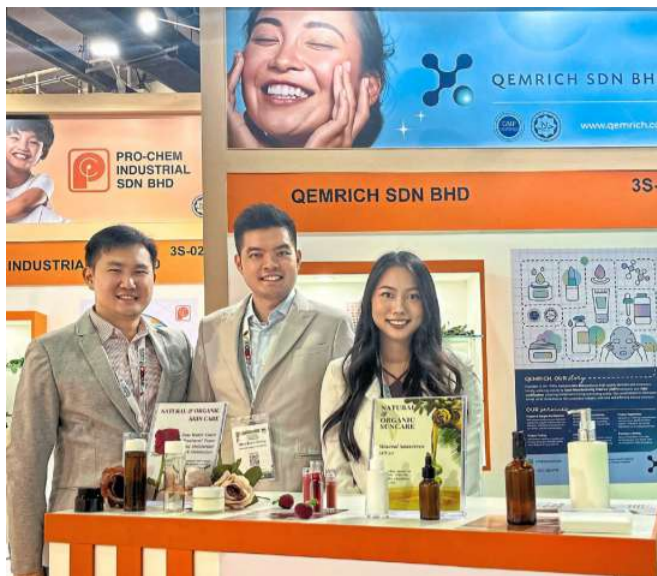
Qemrich Sdn Bhd Nature of business: Fast-moving consumer goods (FMCG), personal care, skincare, cosmetics Qemrich's success at Mihas@Dubai opened new global markets for its personal care, skincare and cosmetics products, expanding the company's reach and establishing a stronger international presence.