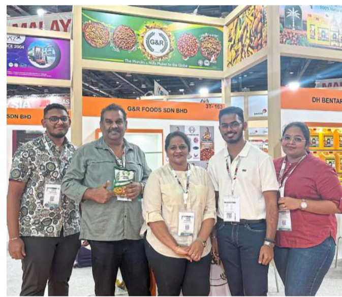
G & R Foods Sdn Bhd Nature of business: Snacks and nuts manufacturer G & R Foods brings the taste of Malaysia to the world, showcasing its authentic murukku and nuts at Mihas@Dubai 2024.