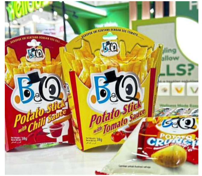
B Plus Q Sdn Bhd Nature of business: Manufacturer of fruit juice and food products B Plus Q offers a convenient and delicious snacking experience with its BQ Potato Sticks and Tomato Sauce Dipping Capsule, which it showcased at Mihas@Dubai.