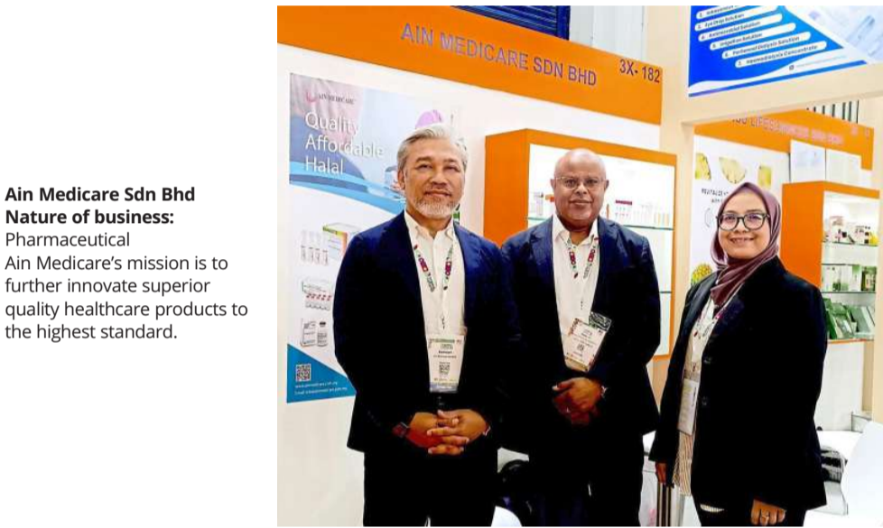
Ain Medicare Sdn Bhd Nature of business: Pharmaceutical Ain Medicare's mission is to further innovate superior quality healthcare products to the highest standard.