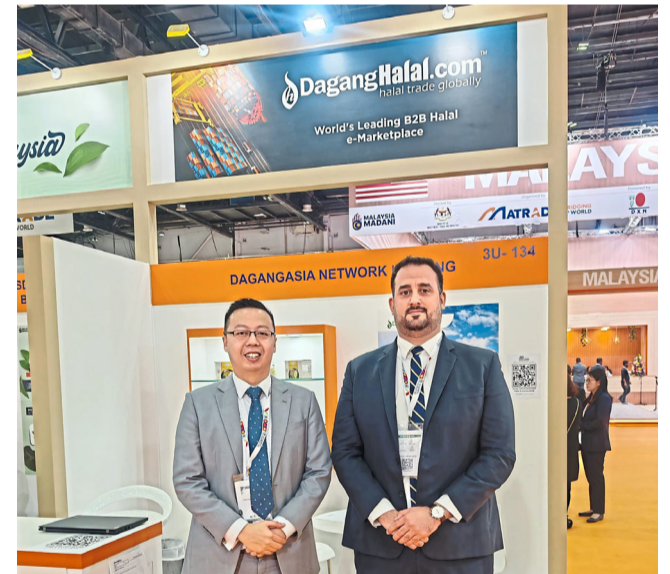
DagangAsia Network Holding Sdn Bhd Nature of business: Exporter of halal products DagangHalal aligns with Mihas@Dubai's vision to position Malaysia as a global halal leader and to tap into the lucrative Middle East and North Africa (Mena) market, a region with a combined GDP of US$4 trillion (RM18 trillion) and a population of 500 million.