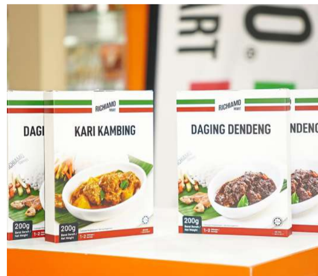
Richiamo Mart Sdn Bhd Nature of business: Convenience stores chain Richiamo Mart, a chain of convenience stores under the well-known Richiamo Group, is committed to providing high-quality products and exceptional customer service. Driven by a dedicated team, Richiamo Mart strives to consistently deliver on its organisational vision and mission.