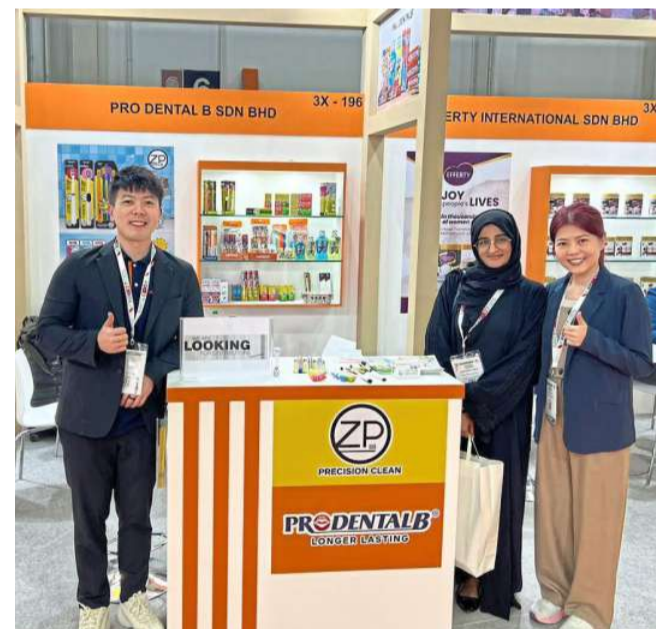
Pro Dental-B Sdn Bhd Nature of business: Oral care Celebrating 30 years of Malaysian excellence, Pro Dental B continues to expand and innovate in the global oral care market.