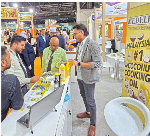
Bountiful Ventures Sdn Bhd Nature of business: Manufacturer and OEM of coconut oil Bountiful Ventures proudly introduced Malaysia's No.1 coconut cooking oil to the UAE market, offering consumers a healthier choice for their culinary needs.