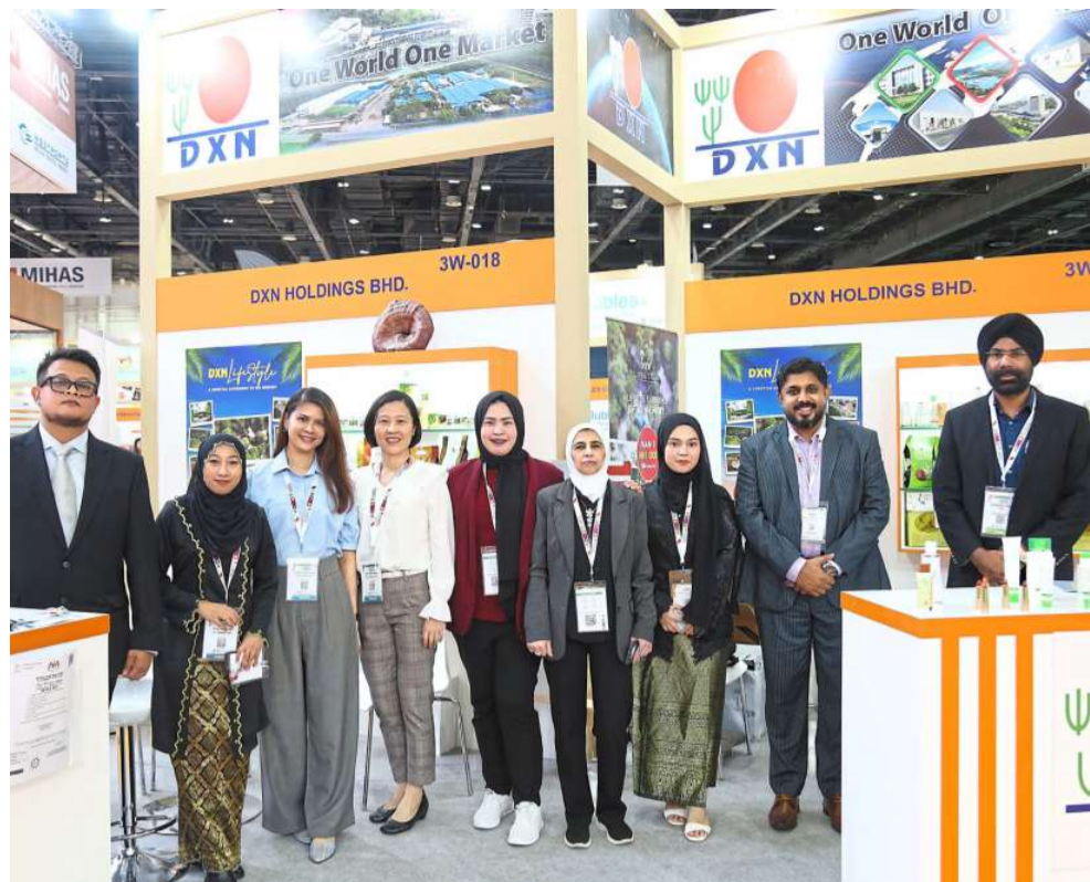
DXN Holdings Bhd Nature of business: F&B