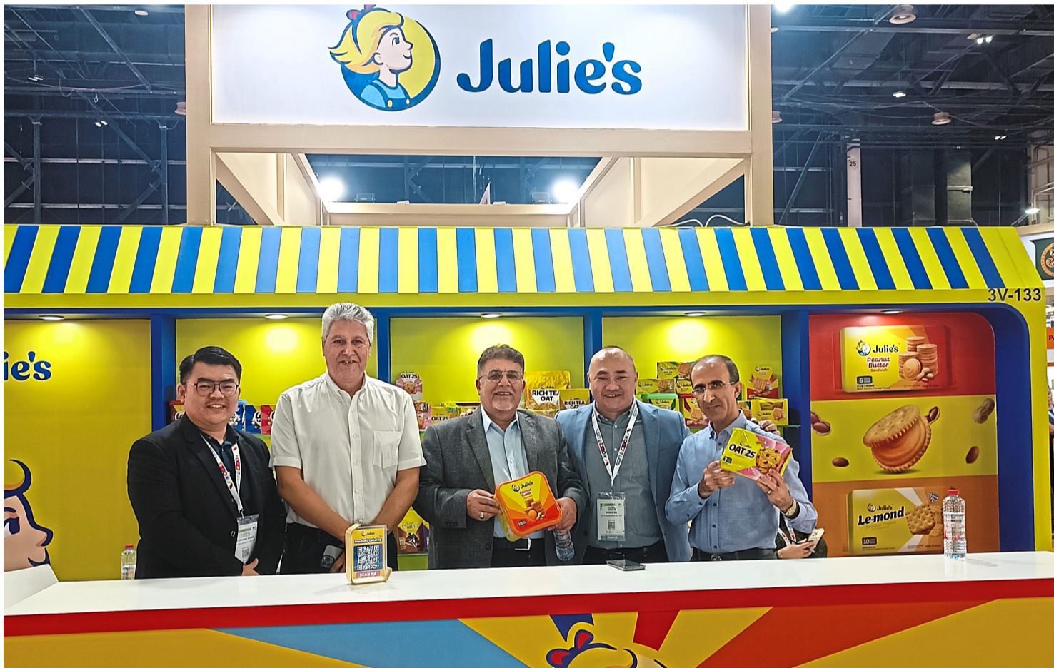
Julie's Manufacturing Sdn Bhd Nature of business: Biscuit manufacturer Julie's Biscuits goes global, showcasing its wide range of delicious and certified halal treats at Mihas@Dubai 2024.