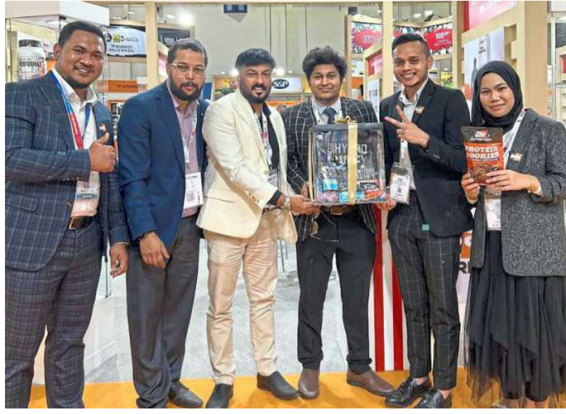
BS Fitness Nutrition (M) Sdn Bhd Nature of business: Manufacturer and supplier of food supplements The BS Fitness Nutrition team connecting with potential distributors to meet the growing demand for food supplements in the UAE, reaffirming their commitment to delivering quality products worldwide.