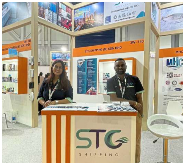
STG Shipping (M) Sdn Bhd

Nature of business: F&B manufacturer SPL Food Industries is dedicated to producing sustainable, locally sourced nipa palm sugar products from Sarawak, Malaysia. The company works closely with local communities to expand the market and increase the acceptance of this valuable organic product, harvested from the forests of Borneo.