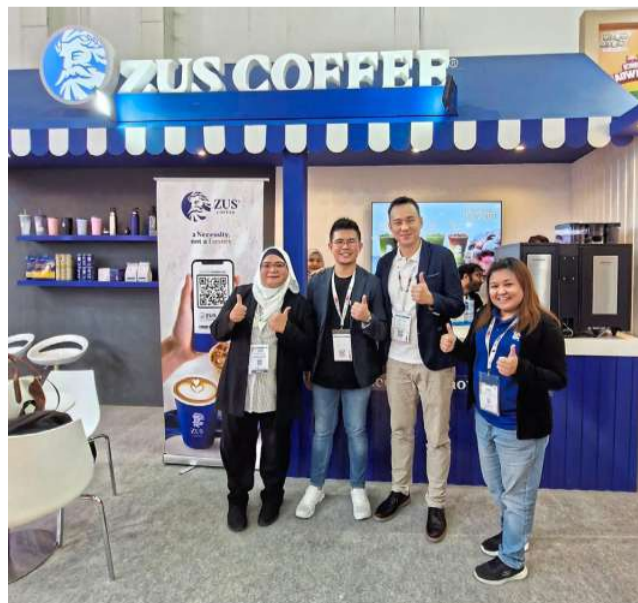
Zuspresso International Sdn Bhd Nature of business: Coffeeshop The Zuspresso team is in an upbeat mood at Mihas@Dubai. ZUS Coffee stands as Malaysia's leading tech-driven coffee chain, aiming to be the next disruptive force in South-East Asia. The company believes that specialty coffee should be a daily necessity for everyone, rather than a luxury limited by location and cost. Established in 2019, Zus Coffee now operates 650 stores across Malaysia, the Philippines, Singapore, and Brunei.