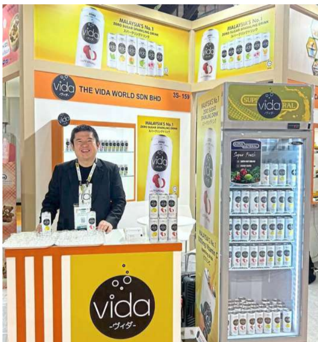
The Vida World Sdn Bhd Nature of business: Beverage manufacturer Vida World Sdn Bhd, a leading Malaysian beverage company, is committed to refreshing the world with its range of flavourful and healthy drinks. Among its standout offerings is the best-selling Vida Zero Sugar Sparkling Drink.