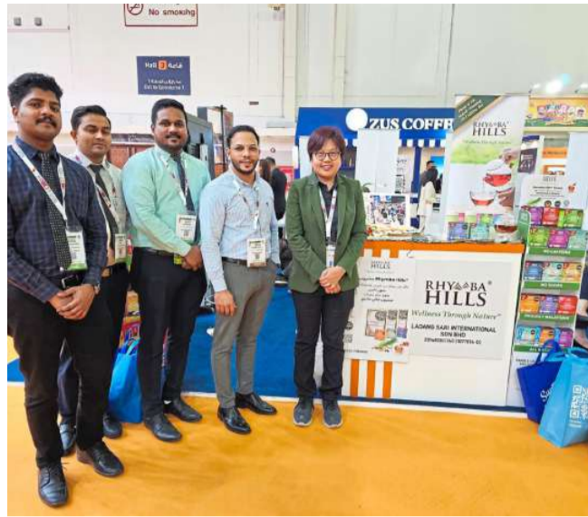
Ladang Sari International Sdn Bhd Nature of business: Manufacturing Malaysian botanical beverages under the Rhymba Hills Tea brand Ladang Sari International produces the award-winning, caffeine-free Rhymba Hills Tea, a Malaysian botanical beverage crafted with natural ingredients such as lemongrass, pandan and Bentong ginger.