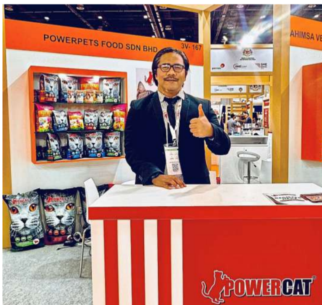
Powerpets Food Sdn Bhd Nature of business: Pet food Powerpets Food showcased its trusted halal-organic-fresh cat food, Powercat, at Mihas@Dubai. This premium product is designed to promote the health, happiness and vitality of feline companions.