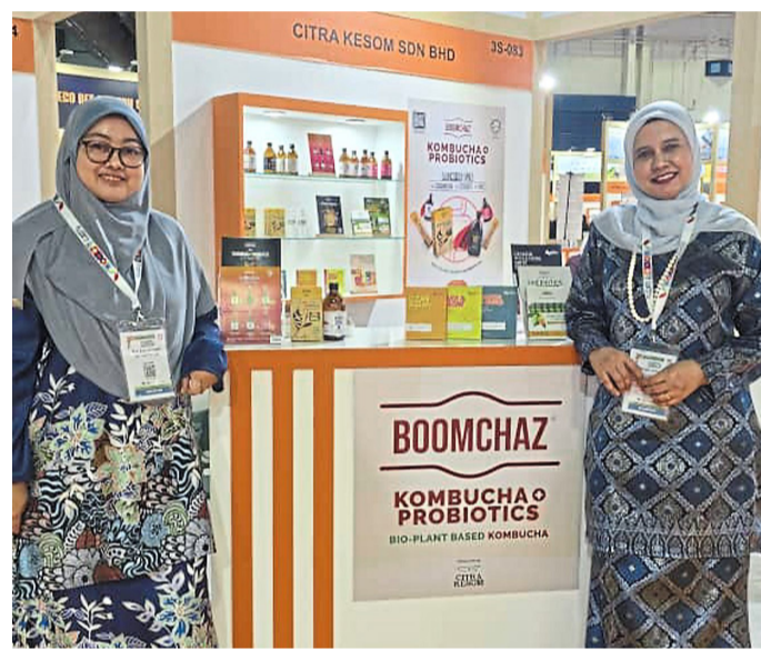
Citra Kesom Sdn Bhd Nature of business: Healthy beverages Citra Kesom proudly introducing Boomchaz, a refreshing functional drink designed for a healthier lifestyle. The company aims to introduce this wellness beverage to global markets, inspiring healthier living across the world.