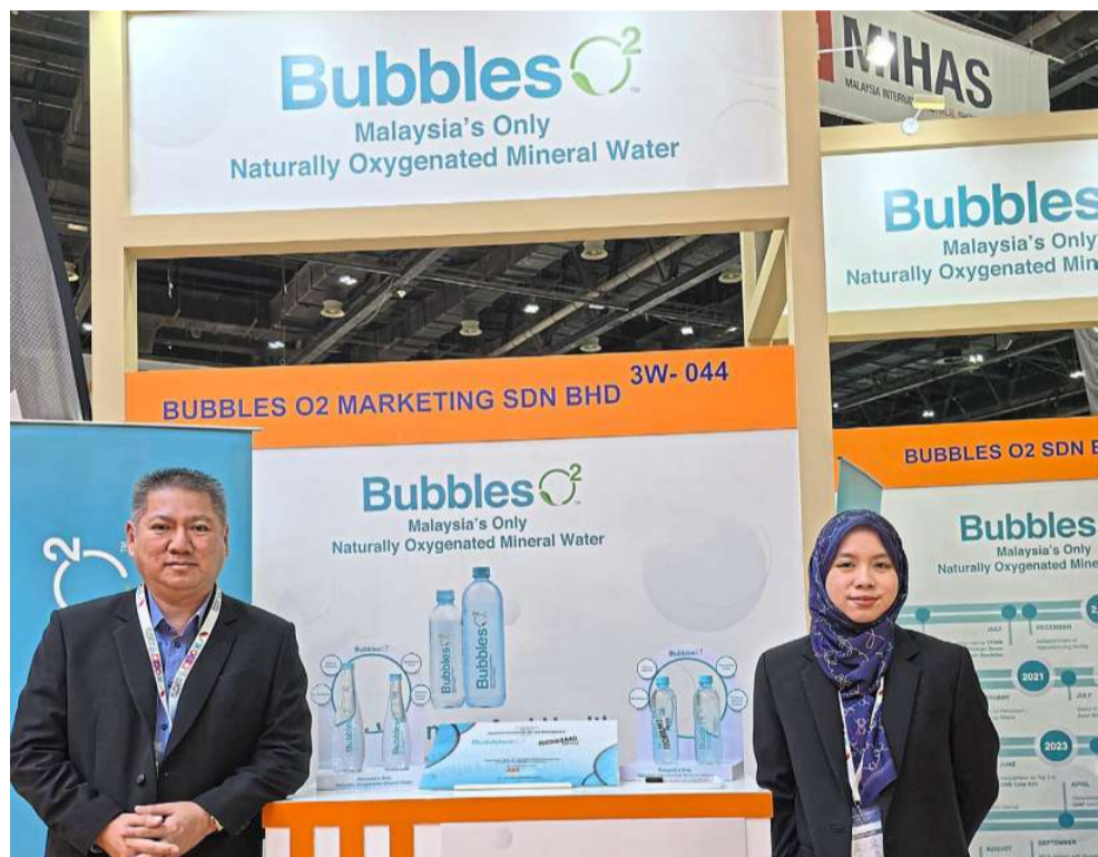
Bubbles O2 Marketing Sdn Bhd

Nature of business: Distribution of naturally oxygenated mineral water Bubbles O2 Marketing signed a Memorandum of Agreement with distributor partner Richiamo Coffee and Queen of Nature Group (UAE local) at Mihas@Dubai.