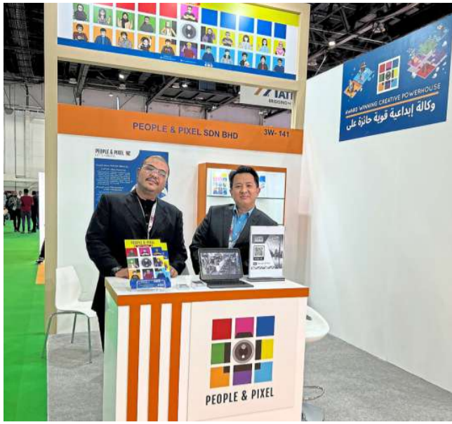
People & Pixel Sdn Bhd Nature of business: Video production, photography and videography, creative services People & Pixel is an acclaimed creative powerhouse renowned for crafting high-quality, engaging content.