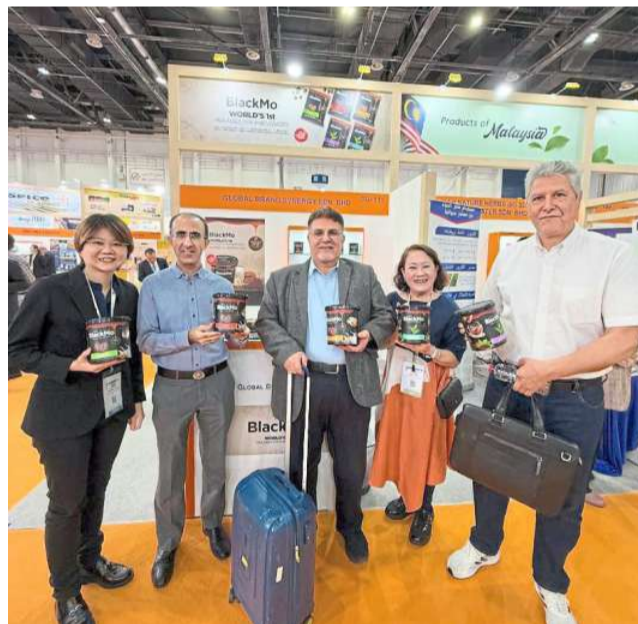
Global Brand Synergy Sdn Bhd Nature of business: Beverages Global Brand Synergy introduces the world's first molasses syrup beverage, offering a unique and flavourful drink experience.