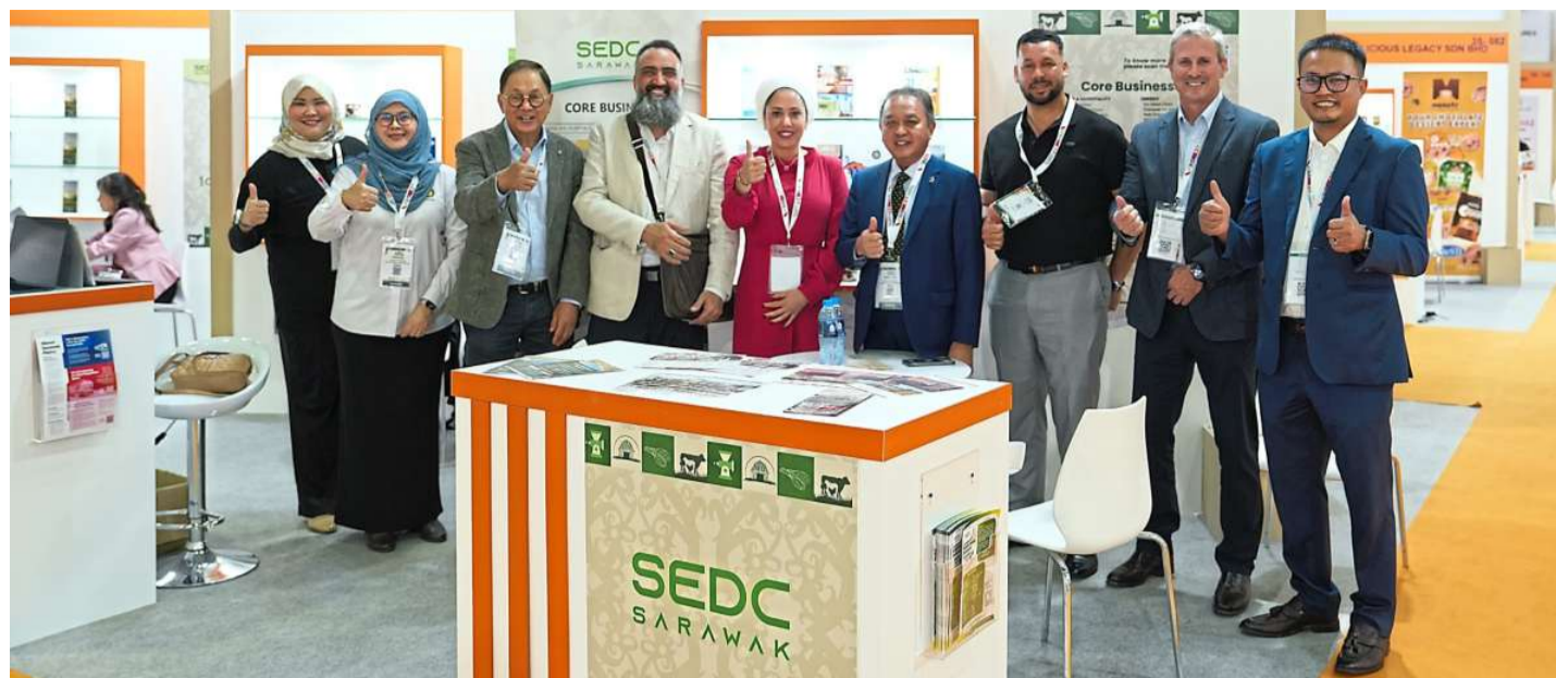
Sarawak Economic Development Corporation (SEDC) Nature of business: State-owned statutory body established to promote both commercial and social development in Sarawak From Borneo to Dubai, SEDC Sarawak set its sights on the global halal market with its presence at one of the world's most prominent international trade exhibitions, Mihas@Dubai. This marked a strategic move to position Sarawak as a key player in the global halal industry.