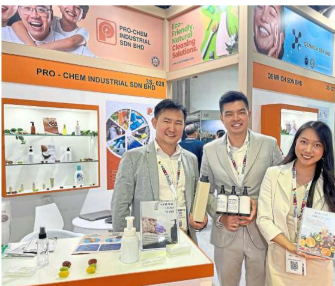
Pro-Chem Industrial Sdn Bhd Nature of business: Fast-moving consumer goods (FMCG), homeware cleaning chemicals and hospitality amenities Pro-Chem Industrial's success at Mihas@Dubai opens new global markets for its homeware cleaning chemicals.