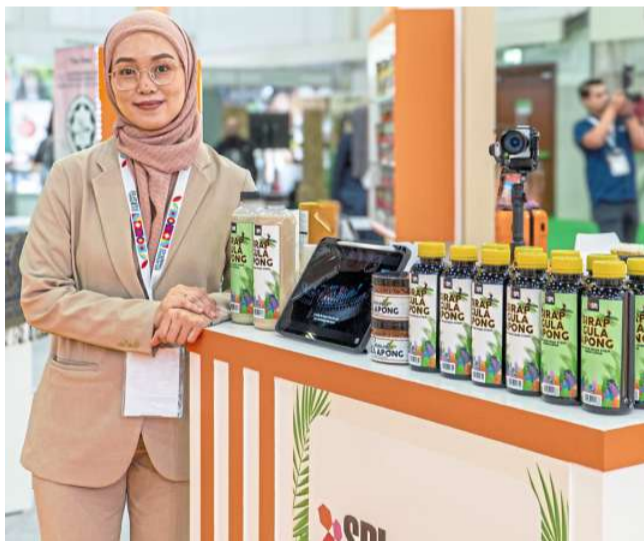
SPL Food Industries Sdn Bhd

Nature of business: Manufacturing spices Spice Kingdom is a leading manufacturer of high-quality spice powders, elevating culinary experiences with its aromatic blends and authentic flavours.