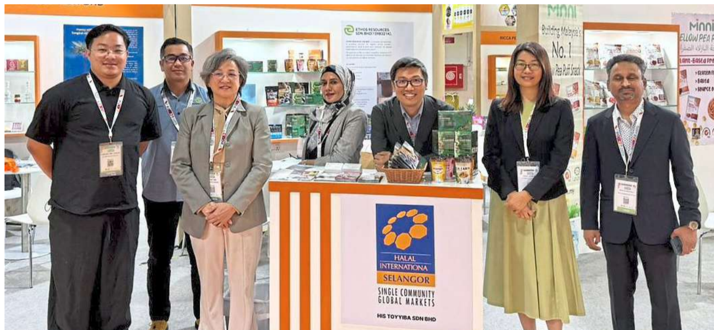
Halal International Selangor (HIS) Nature of business: Selangor state agency with F&B and logistics partner Halal International Selangor (HIS) is an initiative by the Selangor state government aimed at positioning Selangor as a global leader in the halal industry.