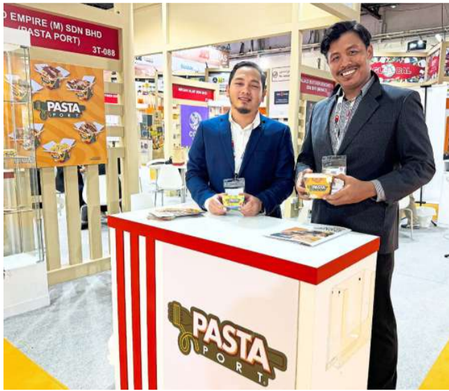
SJD Empire (M) Sdn Bhd (Pasta Port) Nature of business: F&B

From a local favourite to a global sensation, Pasta Port impressed visitors at Mihas@Dubai. Founded by a group of passionate pasta enthusiasts from Penang, this homegrown brand is keen to share its love for pasta with the world.