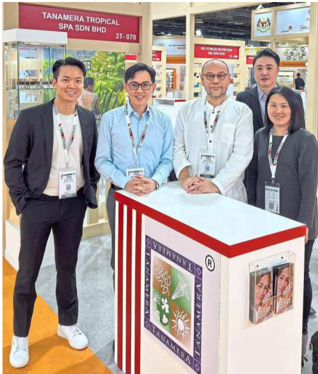
Tanamera Tropical Spa Sdn Bhd Nature of business: Postnatal care, personal care and skin care Tanamera offers women a luxurious, holistic wellness experience rooted in 600 years of Malay herbal remedies, made with tropical herbs.