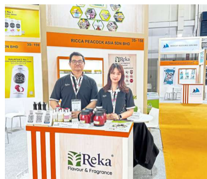
Ricca Peacock Asia Sdn Bhd Nature of business: Manufacturer and distributor of food flavours and fragrances Ricca Peacock Asia showcased its wide range of Reka Flavour and Fragrance products, which enhance sensory experiences, at Mihas@Dubai.