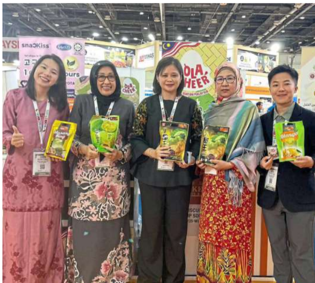
Loke Kee Biscuits And Cake Shop Sdn Bhd Nature of business: Confectionery local food manufacturer (biscuit and gummy, premix coffee, candy bar) Loke Kee is shaking up the snack scene with its latest innovation: the Nasi Lemak Peanut Bar. This bold fusion of Malaysia's iconic flavours is a delightful surprise that's sure to tantalise taste buds.