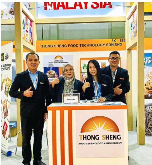
Thong Sheng Food Technology Sdn Bhd Nature of business: Manufacturing, import and export of F&B, ingredients Thong Sheng Food Technology is a leading Malaysian company specialising in the sales, marketing and distribution of innovative and high-quality food additives and ingredients.