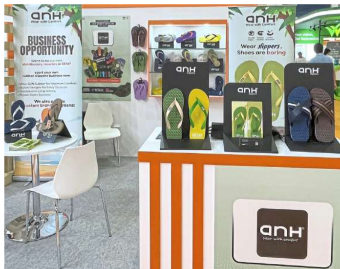
ANH Smart Venture Sdn Bhd Nature of business: Footwear (slippers and sandals) ANH Smart Venture showcases a footwear collection that combines practicality with playful flair. With every pair, the company encourages people to step out of the ordinary and into a world of fun and relaxation, proving that footwear can be both stylish and comfortable.