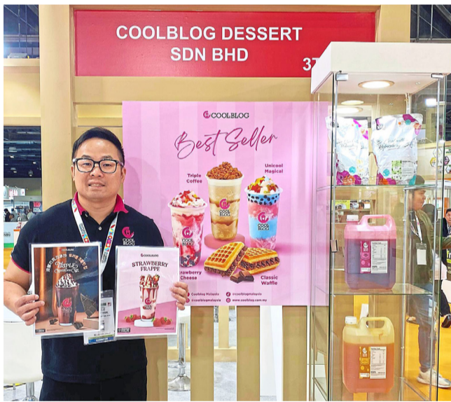
Coolblog Dessert Sdn Bhd Nature of business: F&B Coolblog is a Malaysian brand that specialises in a wide variety of desserts and beverages, particularly known for its innovative ice-blended drinks and smoothies. The company is actively seeking international partners to expand its presence in new global markets.