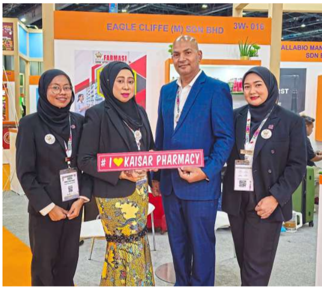
Eagle Cliffe (M) Sdn Bhd Nature of business: Retail and wholesale pharmacy offering over 100 in-house brand items Eagle Cliffe's Kaisar Pharmacy shone at Mihas@Dubai 2024, where it showcased innovative healthcare solutions that embody Malaysian excellence.