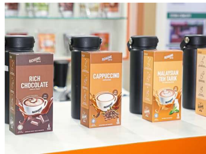
Richiamo Manufacturing Sdn Bhd Nature of business: Manufacturing Richiamo Manufacturing is a subsidiary of Richiamo Coffee, recognised as one of the fastest-growing top-tier cafe restaurant chains in Malaysia. This subsidiary specialises in research and development, production and marketing of premix beverage powders for instant drinks tailored for cafes and restaurants. Its products are manufactured in a facility that meets Malaysia Standard MS 1500 halal and HACCP certifications, ensuring high-quality standards and safety measures. Its sugar-free 3-in-1 premix sachets offer a healthier option for consumers.