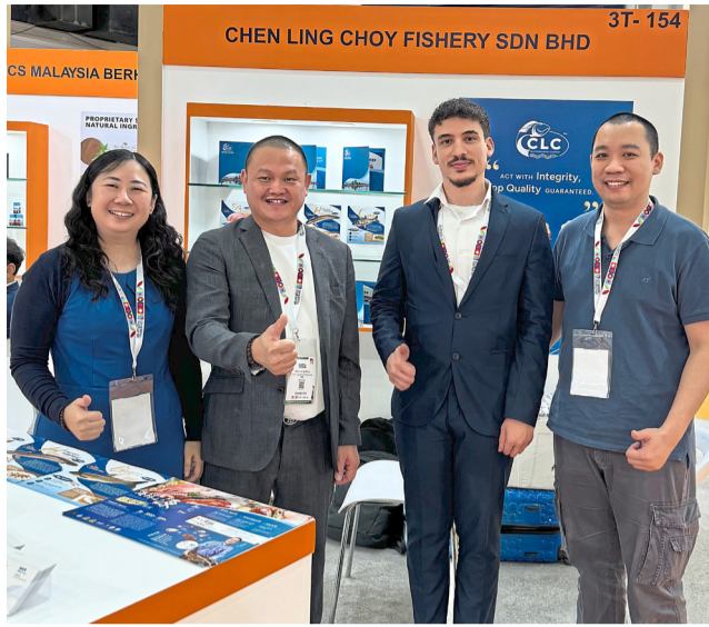
Chen Ling Choy Fishery Sdn Bhd Nature of business: Seafood trading and processing Chen Ling Choy Fishery is a trusted supplier of premium, halal-certified and sustainably sourced seafood. With a commitment to excellence, the company ensures that its products uphold ethical values and meet the highest quality standards.