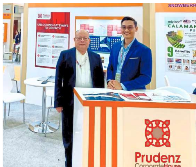
Prudenz Corporatehouse Sdn Bhd Nature of business: Corporate secretarial and business support services Prudenz CorporateHouse is a leading provider of corporate secretarial and outsourcing services, offering comprehensive business support solutions. The company is affiliated with Azmi & Associates, one of Malaysia's top 10 largest law firms.