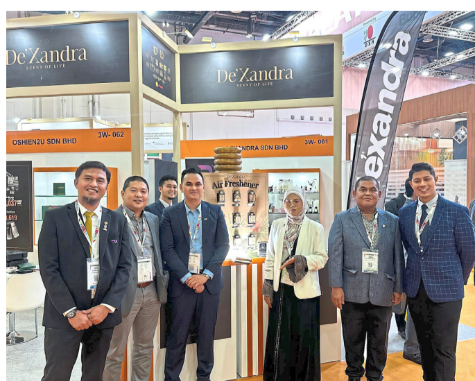
Dexandra Sdn Bhd Nature of business: Fragrance OEM manufacturer Dexandra offers customers the opportunity to create their own unique fragrances. The company has received several awards for the exceptional quality of its products, reflecting its commitment to excellence in the fragrance industry.