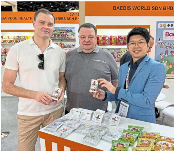
Baebis World Sdn Bhd Nature of business: Baby food products Baebis World provides high-quality, nutritious snacks and multivitamins that enhance children's health.