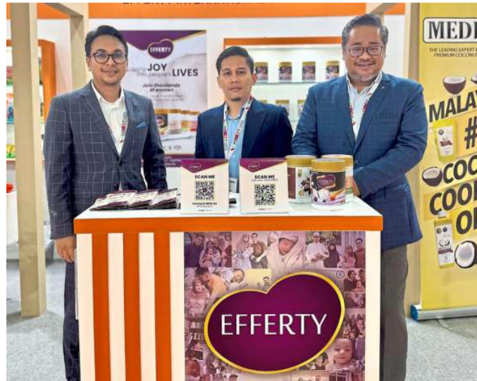
Efferty International Sdn Bhd Nature of business: Health products Efferty International offers a variety of products that support women on their journey to motherhood, focusing on both health and wellness.