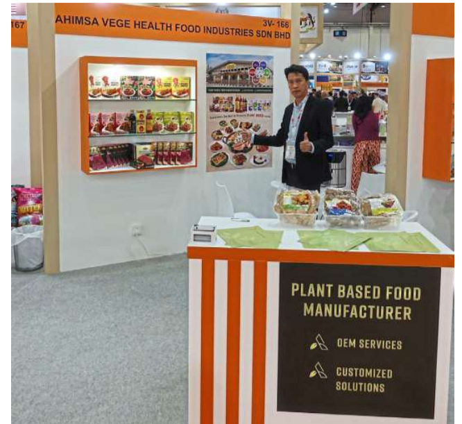
Ahimsa Vege Health Food Industries Sdn Bhd Nature of business: Food Ahimsa Vege Health Food spreads compassion in every bite, inspiring healthier lifestyles across the UAE.