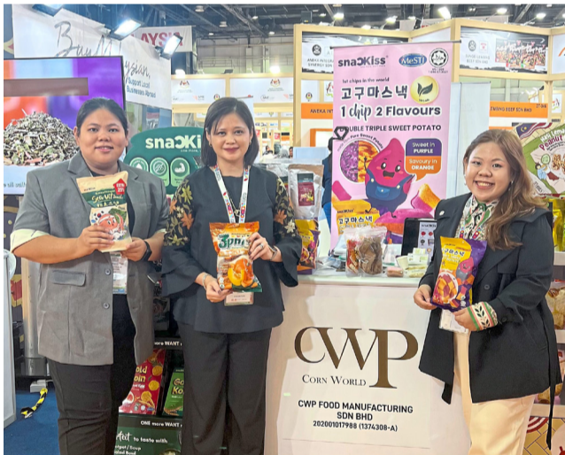
CWP Food Manufacturing Sdn Bhd Nature of business: Manufacturing halal snacks, plant-based snacks, freeze-dried snacks CWP Food Manufacturing, a leading food manufacturer, is excited to unveil Snackiss, a delectable range of halal, plant-based seaweed snacks inspired by local flavours, at Mihas@Dubai 2024. This healthy and delicious alternative to traditional snacks is set to redefine the snacking experience.