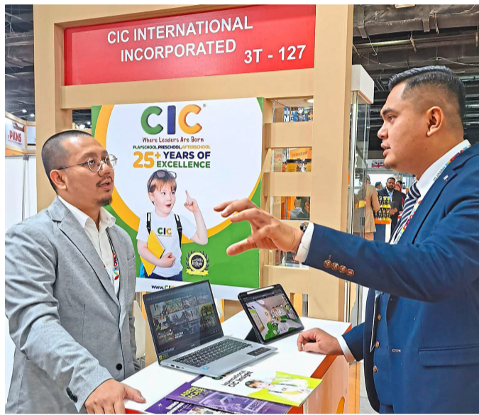
CIC International Inc Nature of business: Early childhood education CIC took the global stage at Mihas@Dubai 2024 to promote its innovative early childhood education franchise model, positioning Malaysia as a leader in international education.