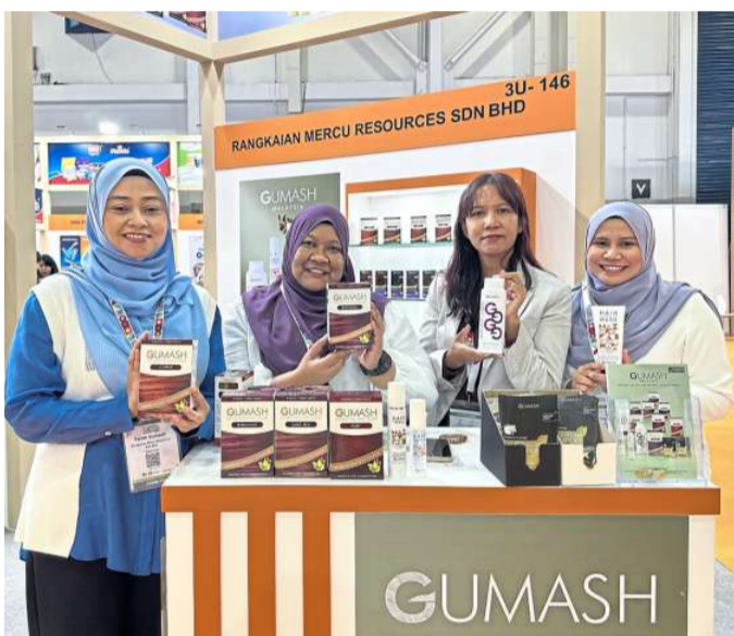
Rangkaian Mercu Resources Sdn Bhd Nature of business: Hair colouring and haircare products Rangkaian Mercu Resources proudly showcasing Gumash Color, a Wudhu'-compliant hair colouring product, alongside an extensive range of innovative hair care products.